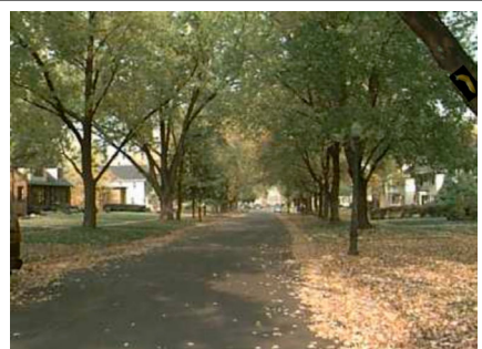
Street trees enhance visual character, provide shade and habitat, and reduce noise and air pollution.

Implementation of a number of Comprehensive Plan policies will contribute to improving air quality .