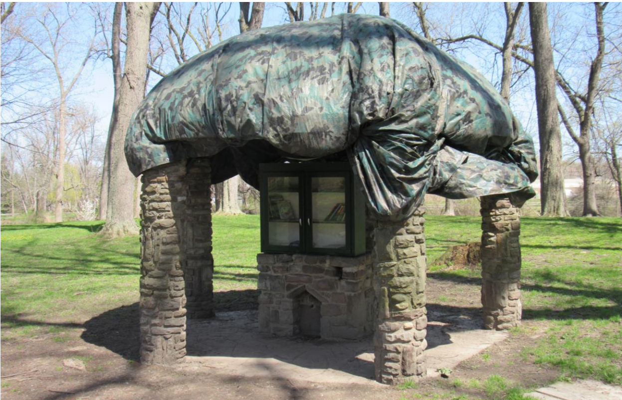
NY_Erie County_Town of Amherst_10 Creekside Drive_Shelter I-36

20. HISTORICAL AND ARCHITECTURAL IMPORTANCE: Remains unchanged.