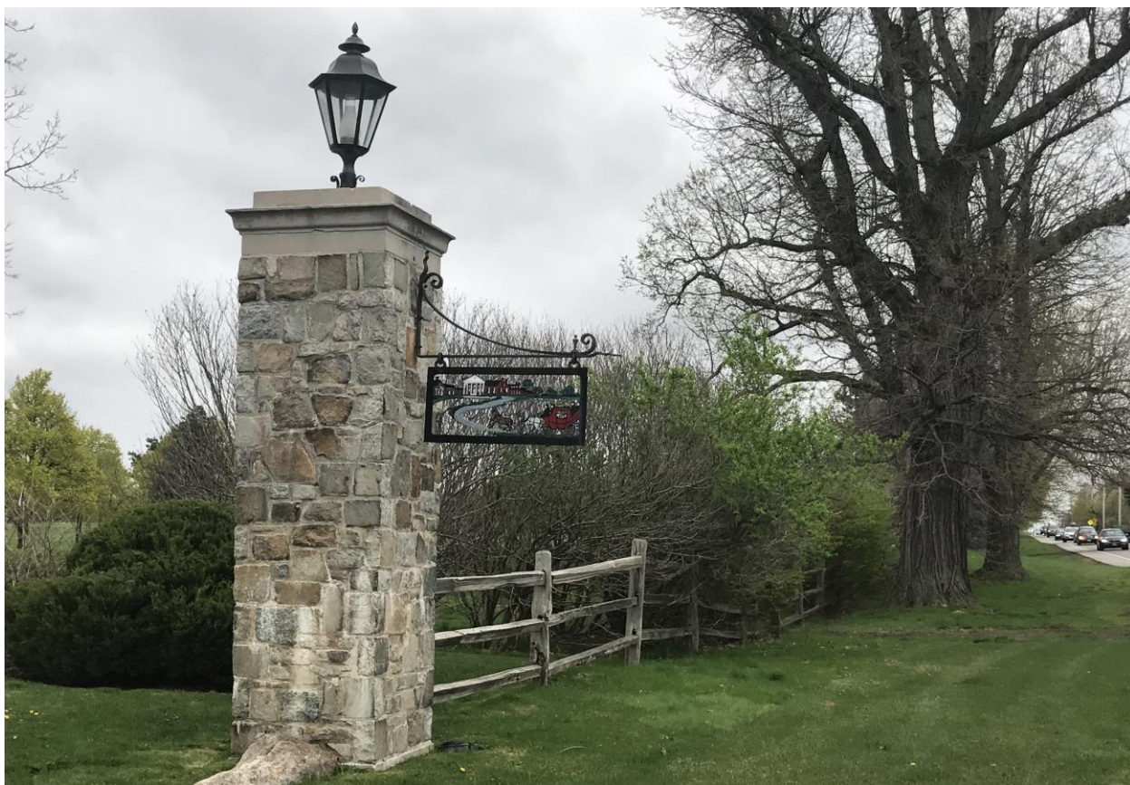
NY_Erie County_Town of Amherst_250 Youngs Road_South Entrance Detail