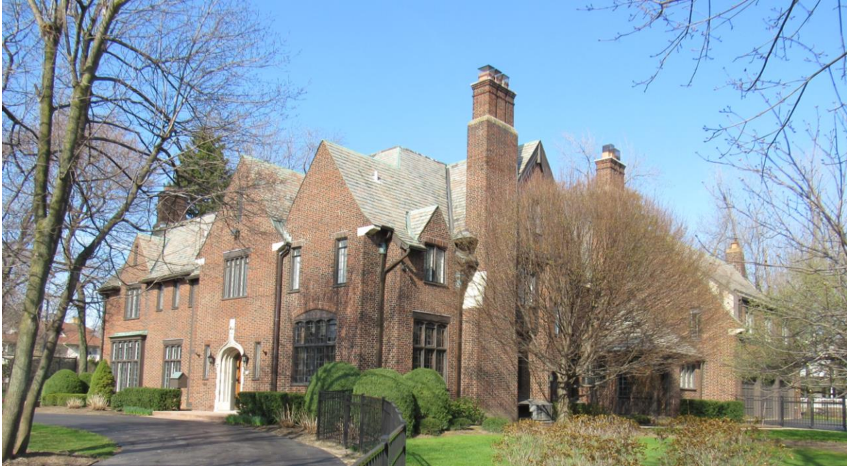
NY_Erie County_Town of Amherst_889 LeBrun Road_South and West Elevations