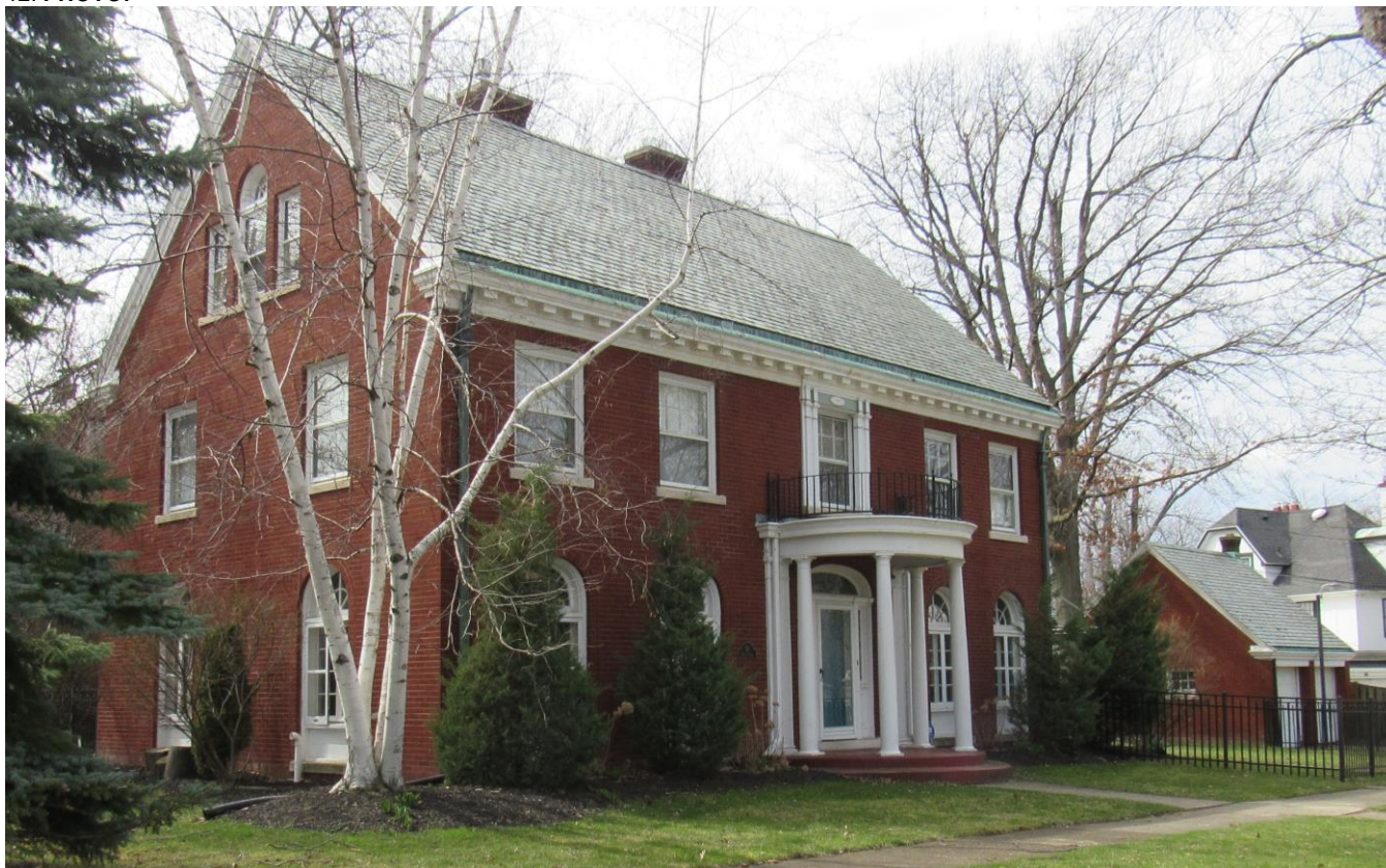
NY_Erie County_Town of Amherst_48 Park Circle_South and East Elevations

20. HISTORICAL AND ARCHITECTURAL IMPORTANCE: Remains Unchanged.