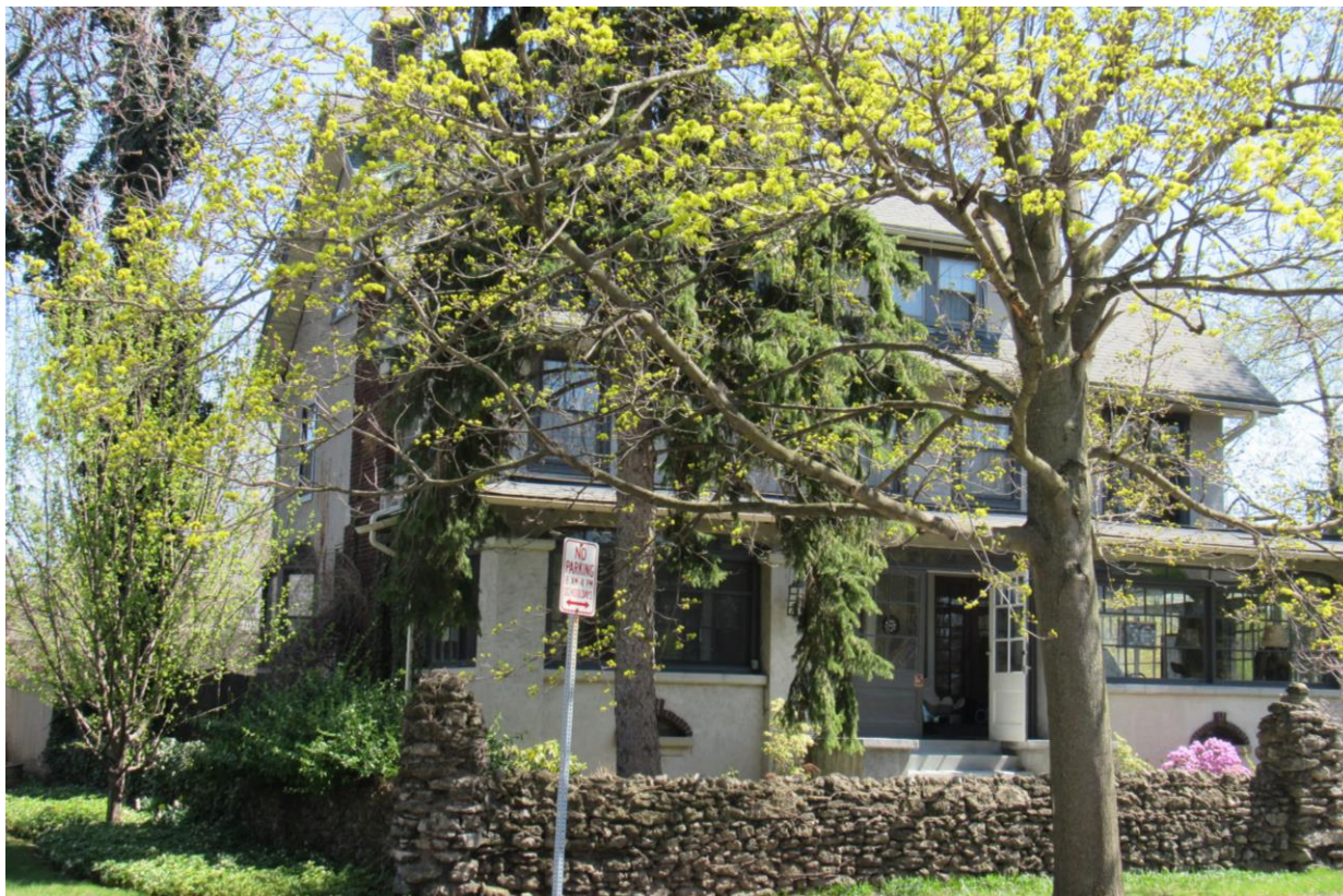
NY_Erie County_Town of Amherst_36 Washington Highway_North and West Elevations