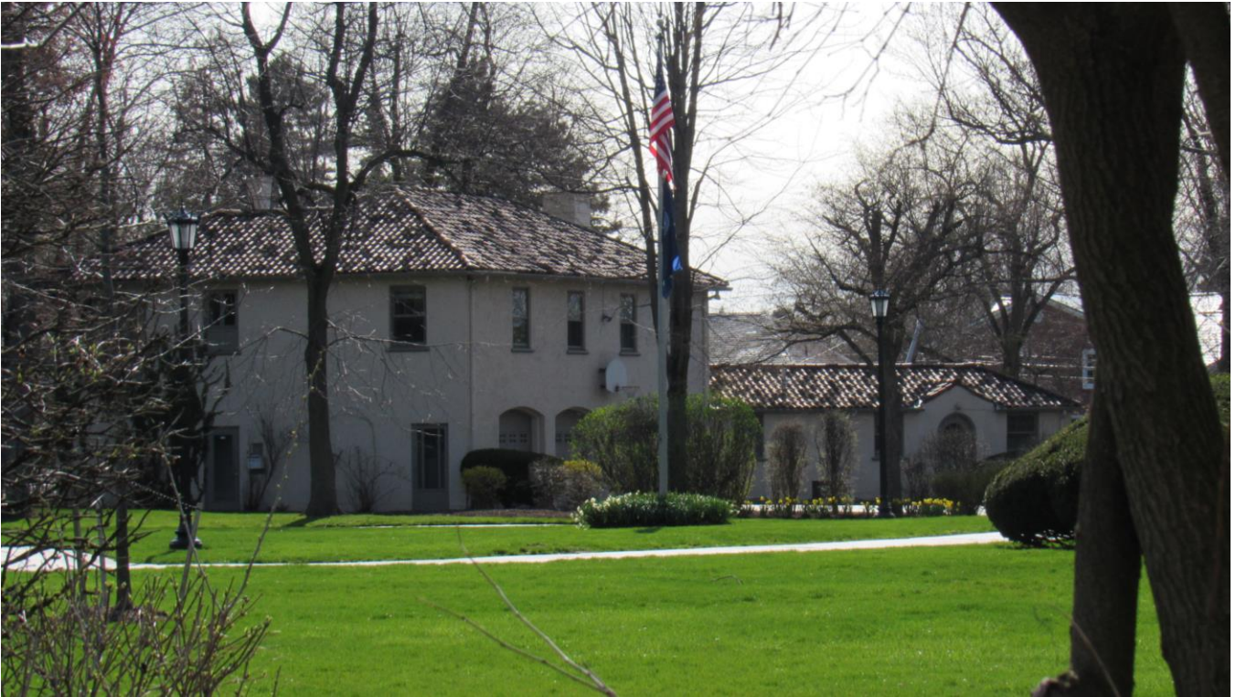
NY_Erie County_Town of Amherst_726 LeBrun Road_North and East Elevations