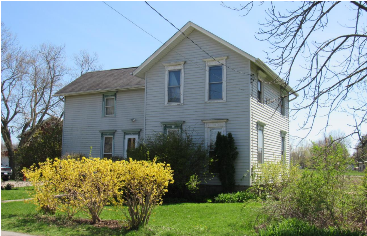
NY_Erie County_Town of Amherst_215 Brenon Road_North and West Elevations