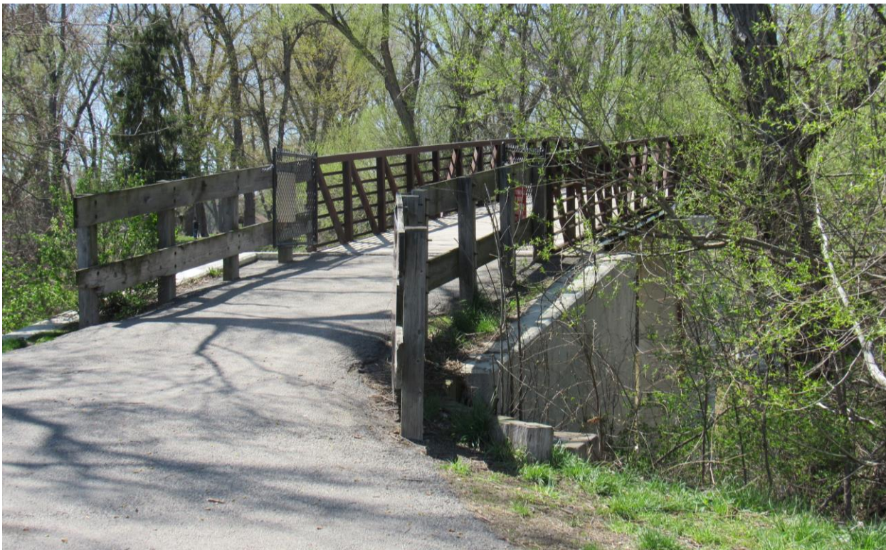
NY_Erie County_Town of Amherst_10 Creekside Drive_Entrance