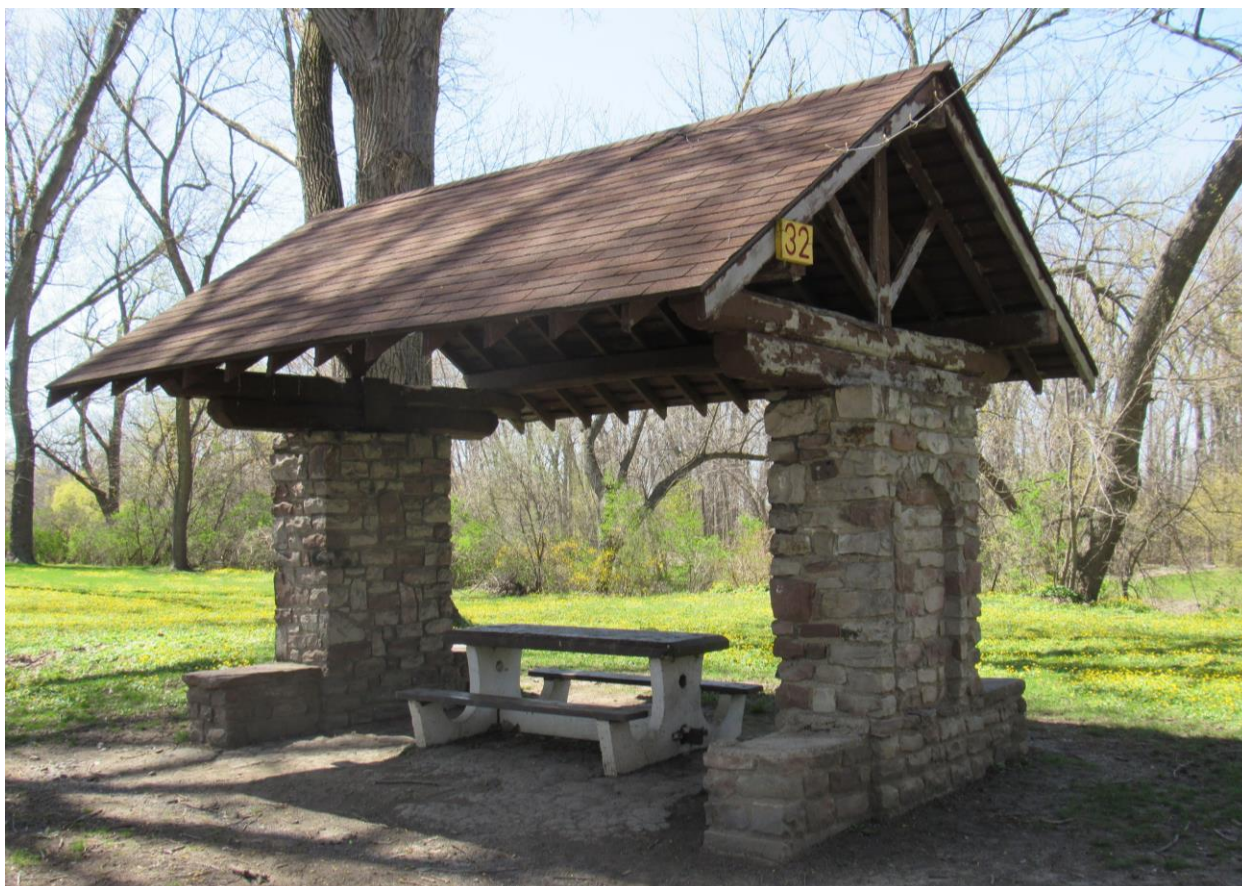
NY_Erie County_Town of Amherst_10 Creekside Drive_Shelter I-32