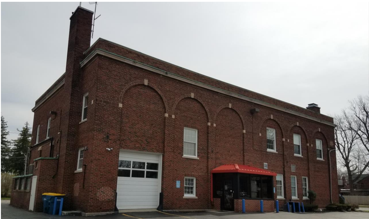
NY_Erie County_Town of Amherst_3826 Main Street_North and West Elevations