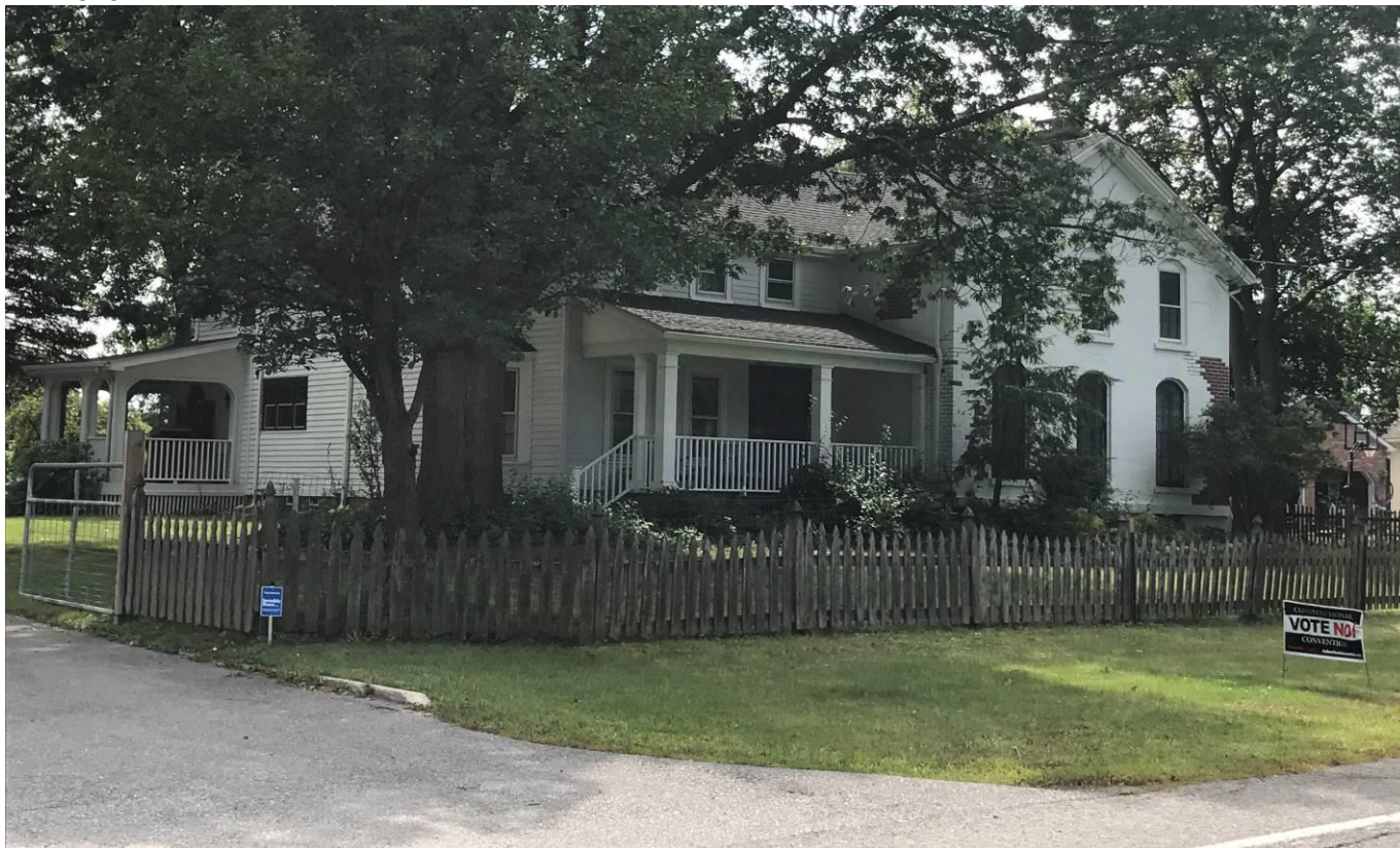
NY_Erie County_Town of Amherst_459 South Ellicott Creek Road_East and North Elevations

20. HISTORICAL AND ARCHITECTURAL IMPORTANCE: Remains unchanged.