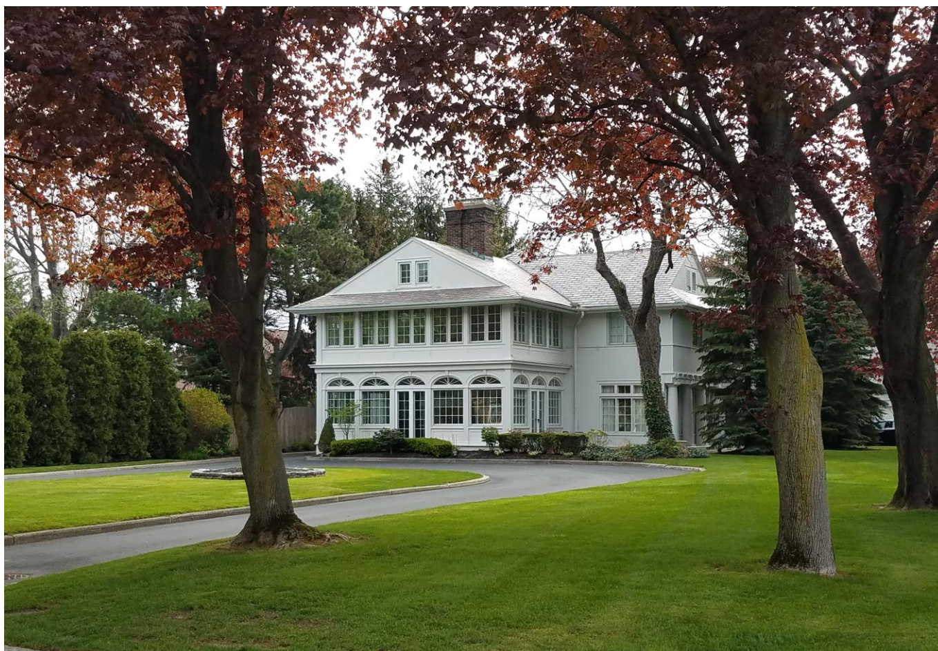
NY_Erie County_ Town of Amherst _23 Four Seasons Rd West_ West and South Elevations