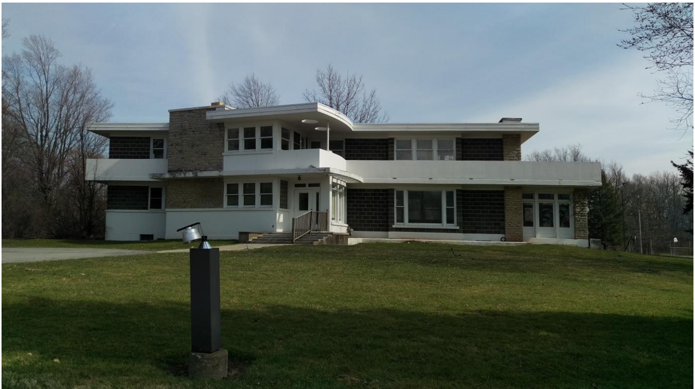
NY_Erie County_Town of Amherst_895 North Forest Road_West Elevation

20. HISTORICAL AND ARCHITECTURAL IMPORTANCE: Remains Unchanged.