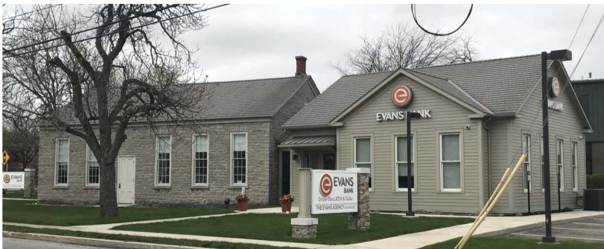
NY_Erie County_Town of Amherst_5178 Main Street_North and East Elevations