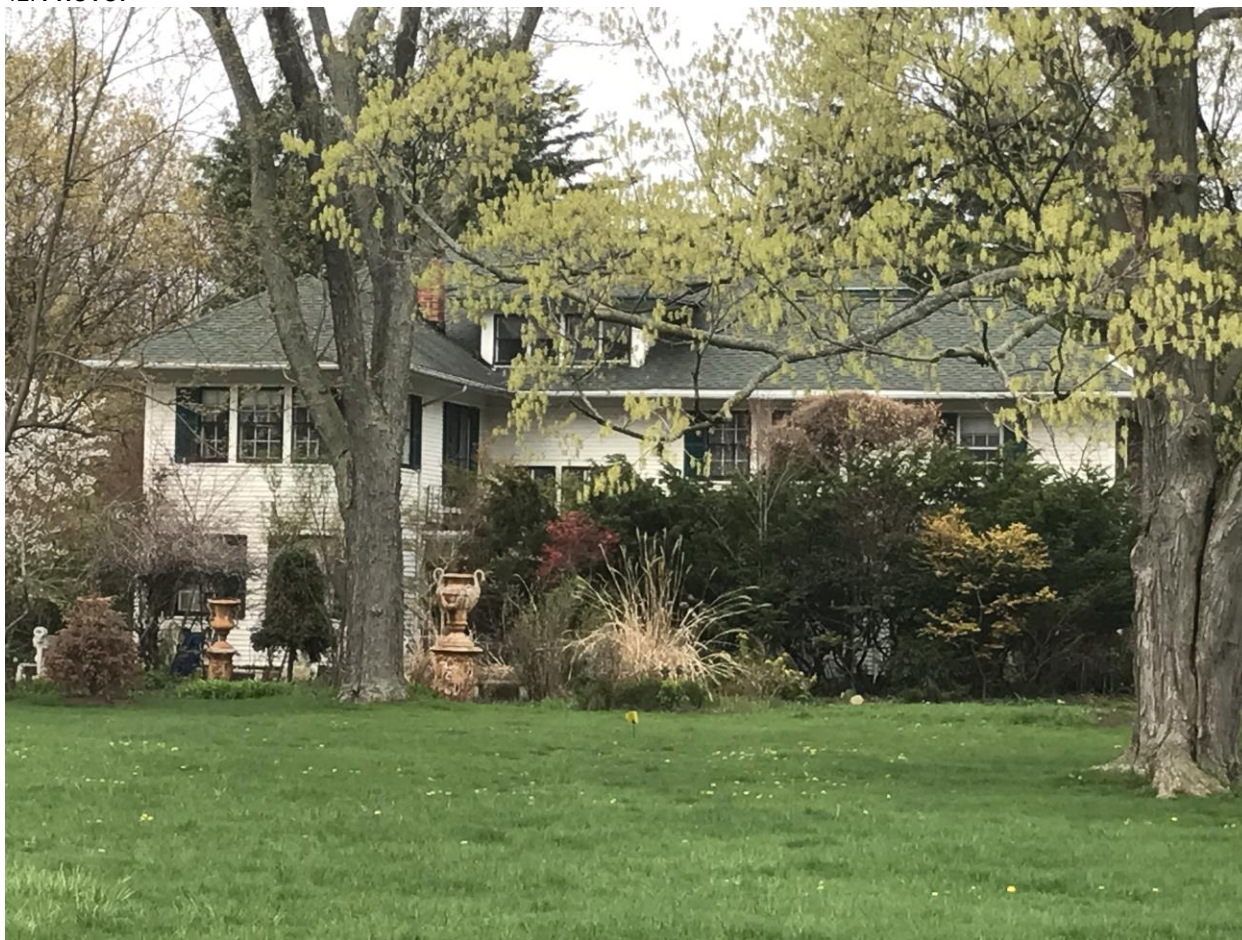
NY_Erie County_Town of Amherst_305 Brompton Road_East Elevation