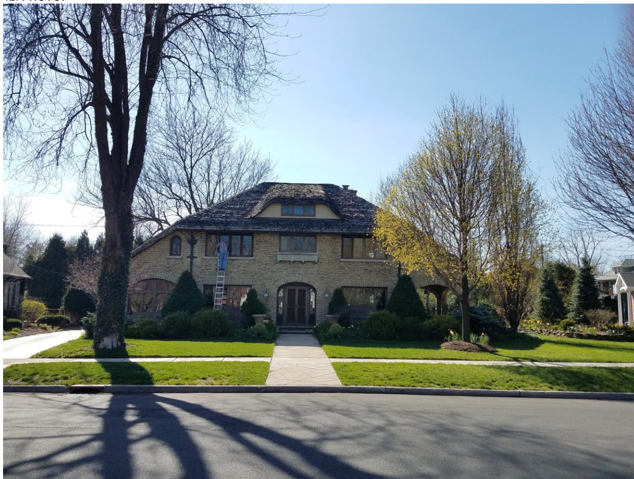
NY_Erie County_Town of Amherst_31 Darwin Drive_East Elevation