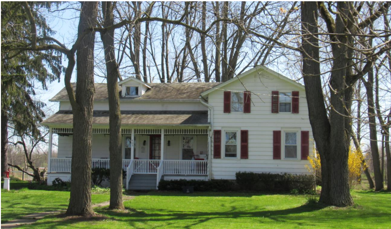
NY_Erie County_Town of Amherst_405 Schoelles Road_North Elevation