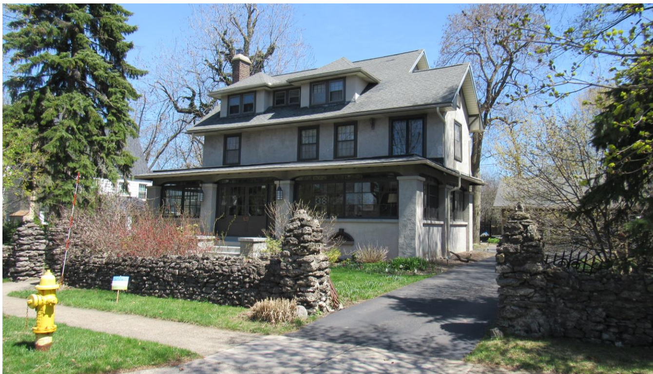
NY_Erie County_Town of Amherst_36 Washington Highway_South and West Elevation

20. HISTORICAL AND ARCHITECTURAL IMPORTANCE: Remains Unchanged.