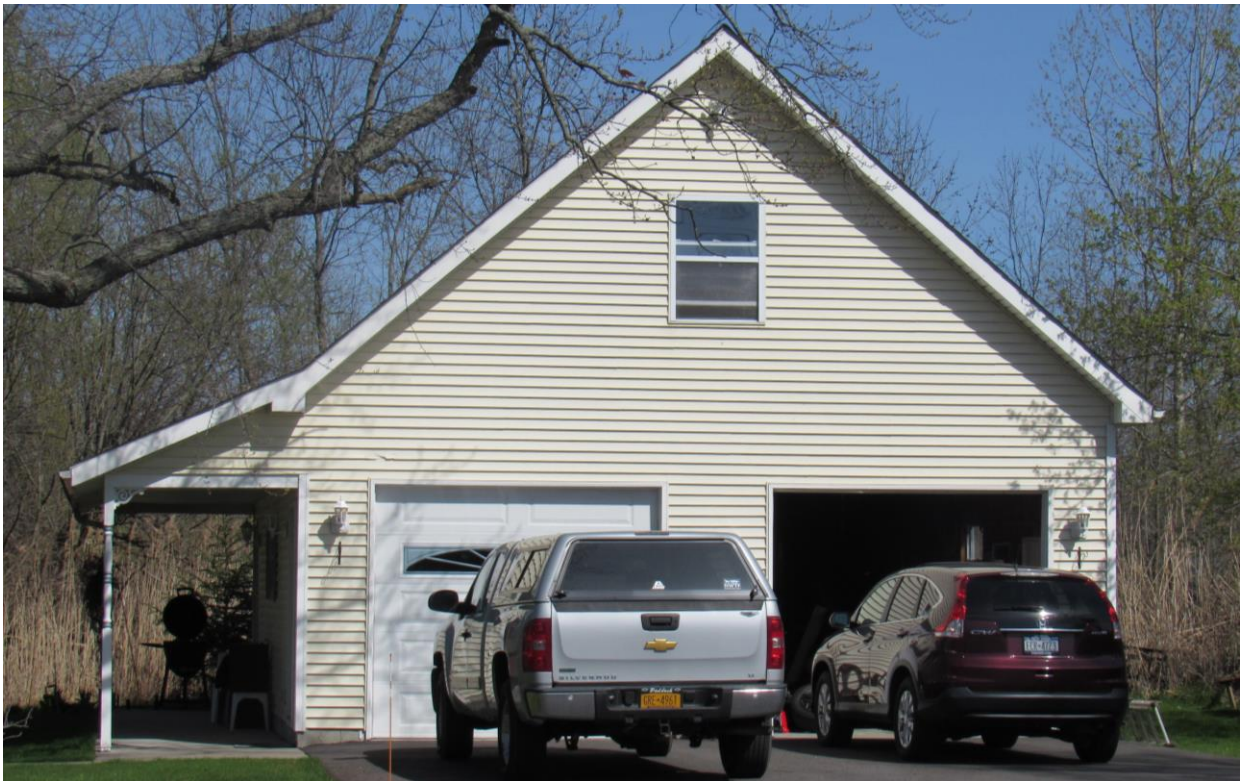
NY_Erie County_Town of Amherst_1025 New Road_Detached Garage (2000)