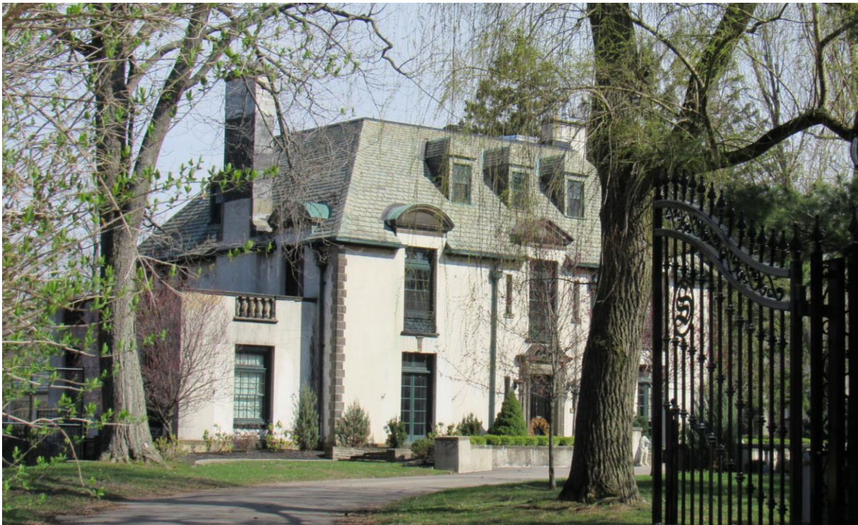
NY_Erie County_Town of Amherst_697 LeBrun Road_North and West Elevations