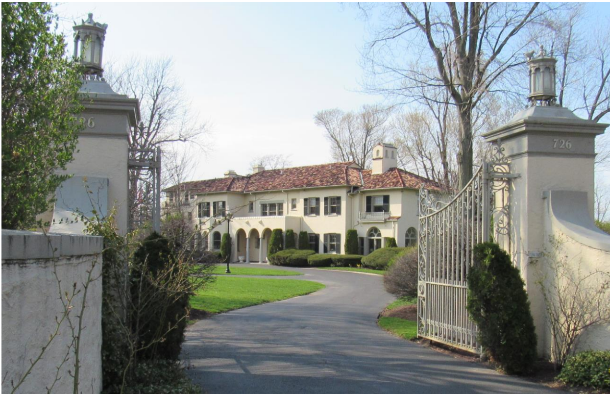
NY_Erie County_Town of Amherst_726 LeBrun Road_South Elevation

20. HISTORICAL AND ARCHITECTURAL IMPORTANCE: Remains Unchanged.