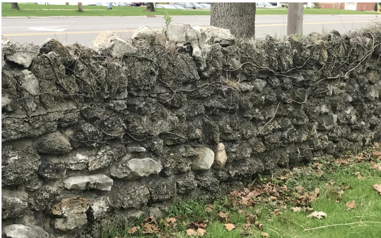
Stone wall in front of 6350 Main Street