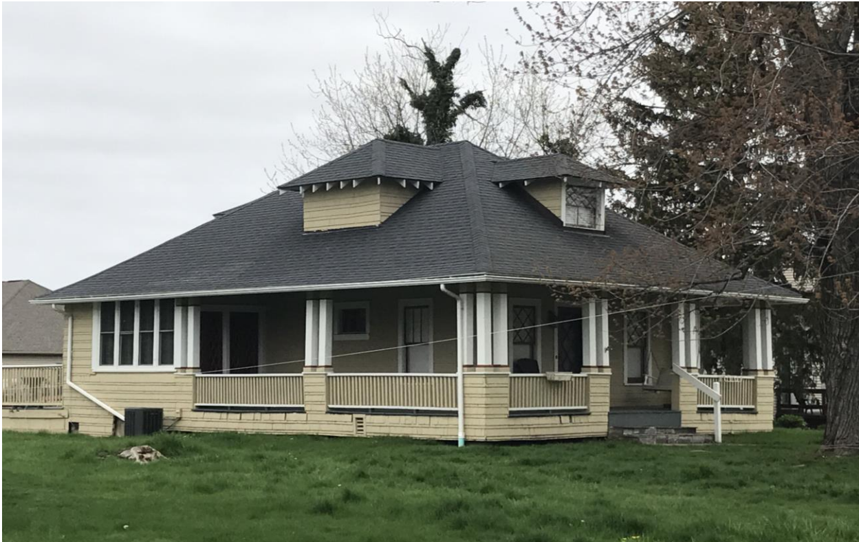
NY_Erie County_Town of Amherst_1000 North Forest Road_South and East Elevations