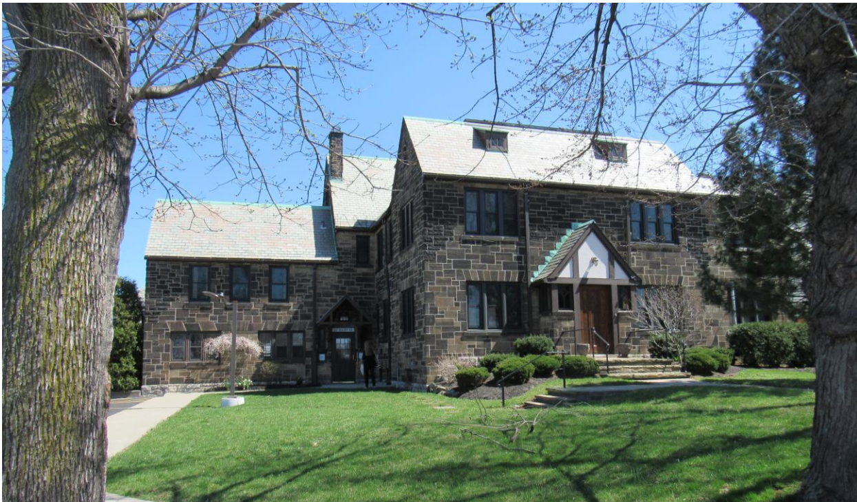
NY_Erie County_Town of Amherst_1317 Eggert Road_Rectory_West Elevation