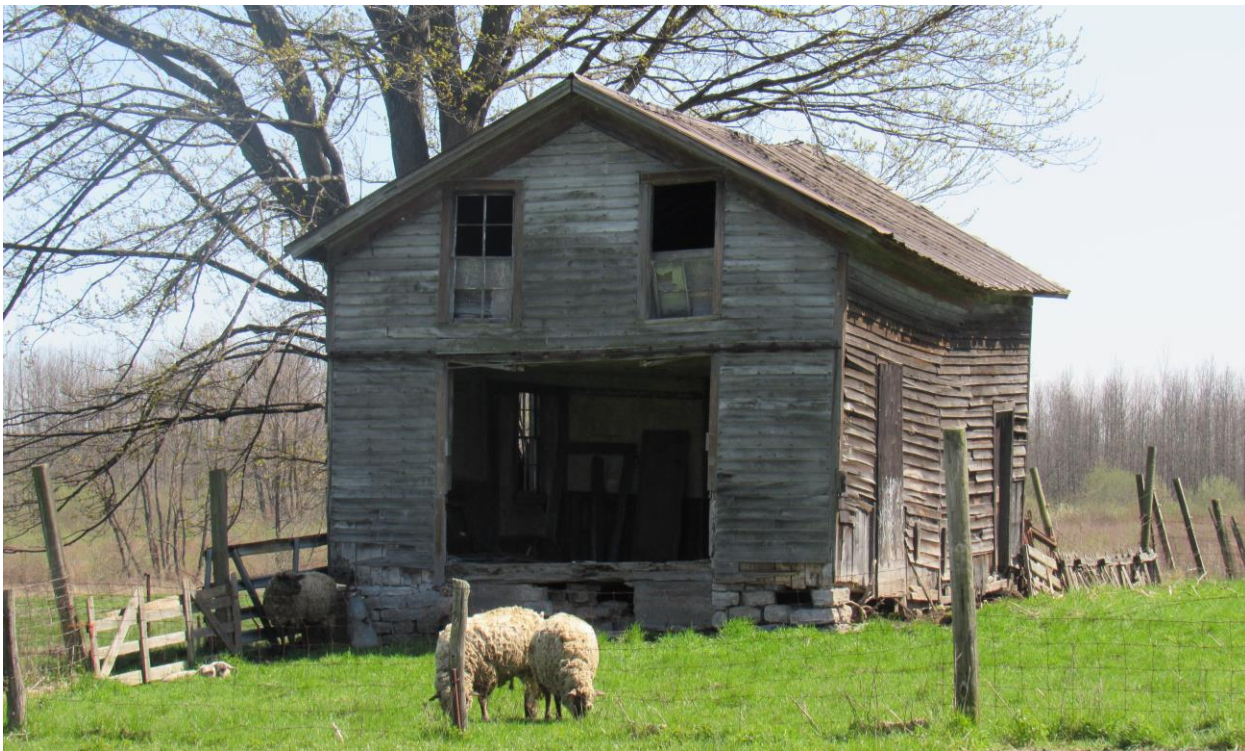
NY_Erie County_Town of Amherst_405 Schoelles Road_North and East Elevations_Outbuilding East of House