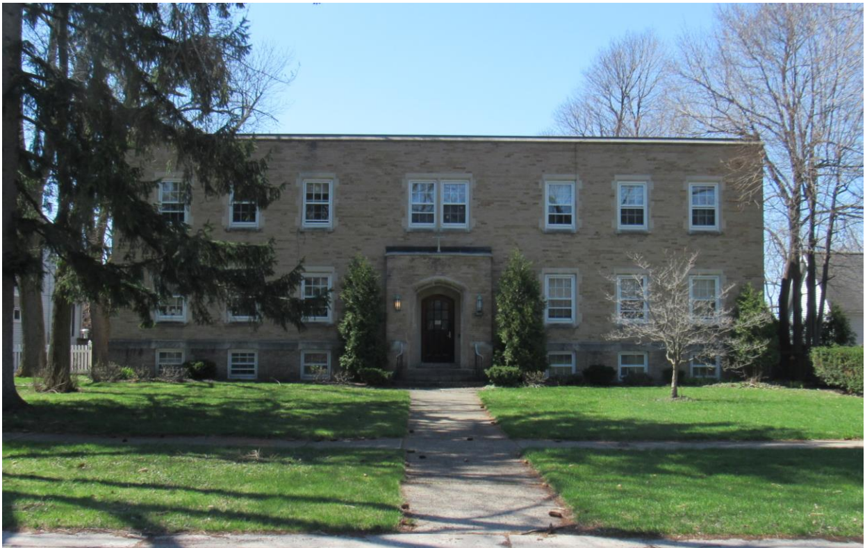
NY_Erie County_Town of Amherst_1317 Eggert Road_St.Benedict's Convent, 38 Westfield Road_East Elevation

20. HISTORICAL AND ARCHITECTURAL IMPORTANCE: Remains Unchanged