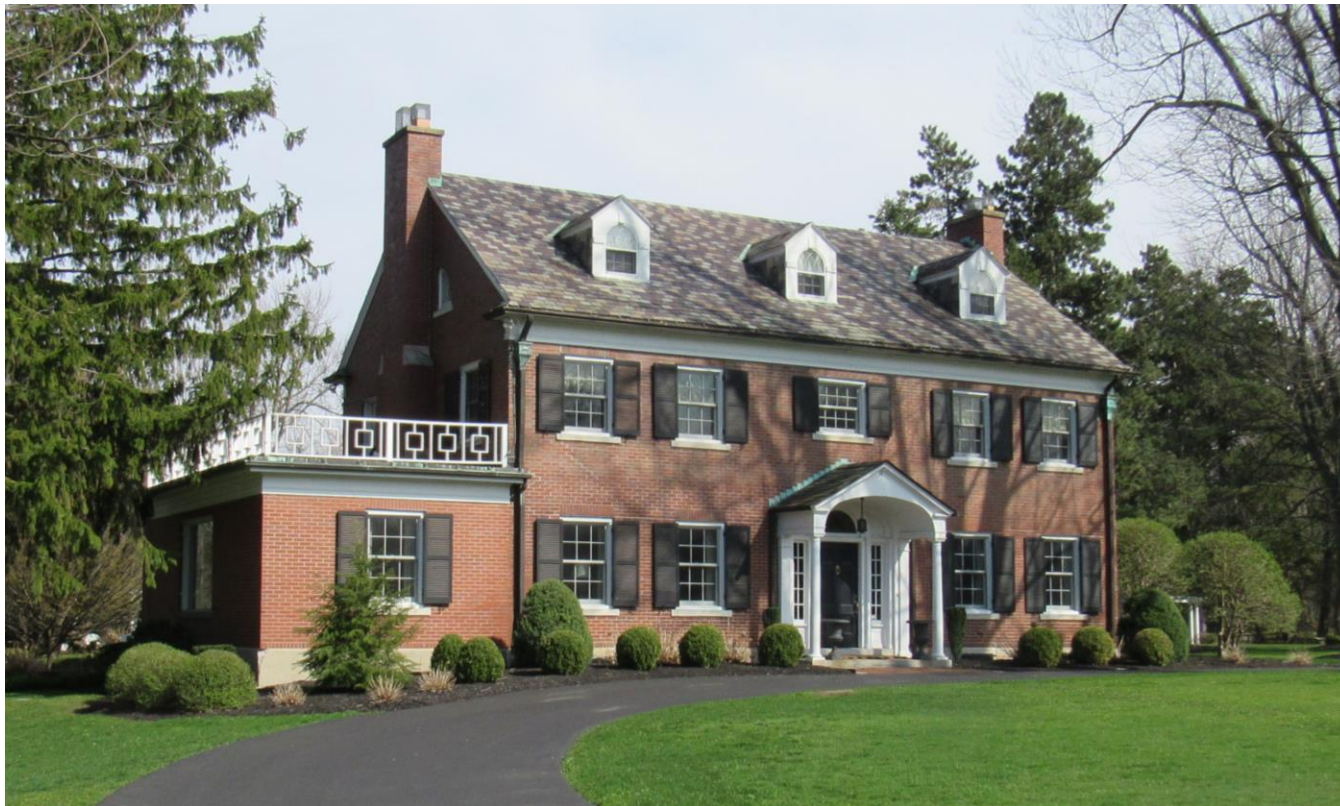
NY_Erie County_Town of Amherst_725 LeBrun Road_North and West Elevations

20. HISTORICAL AND ARCHITECTURAL IMPORTANCE: Remains unchanged.