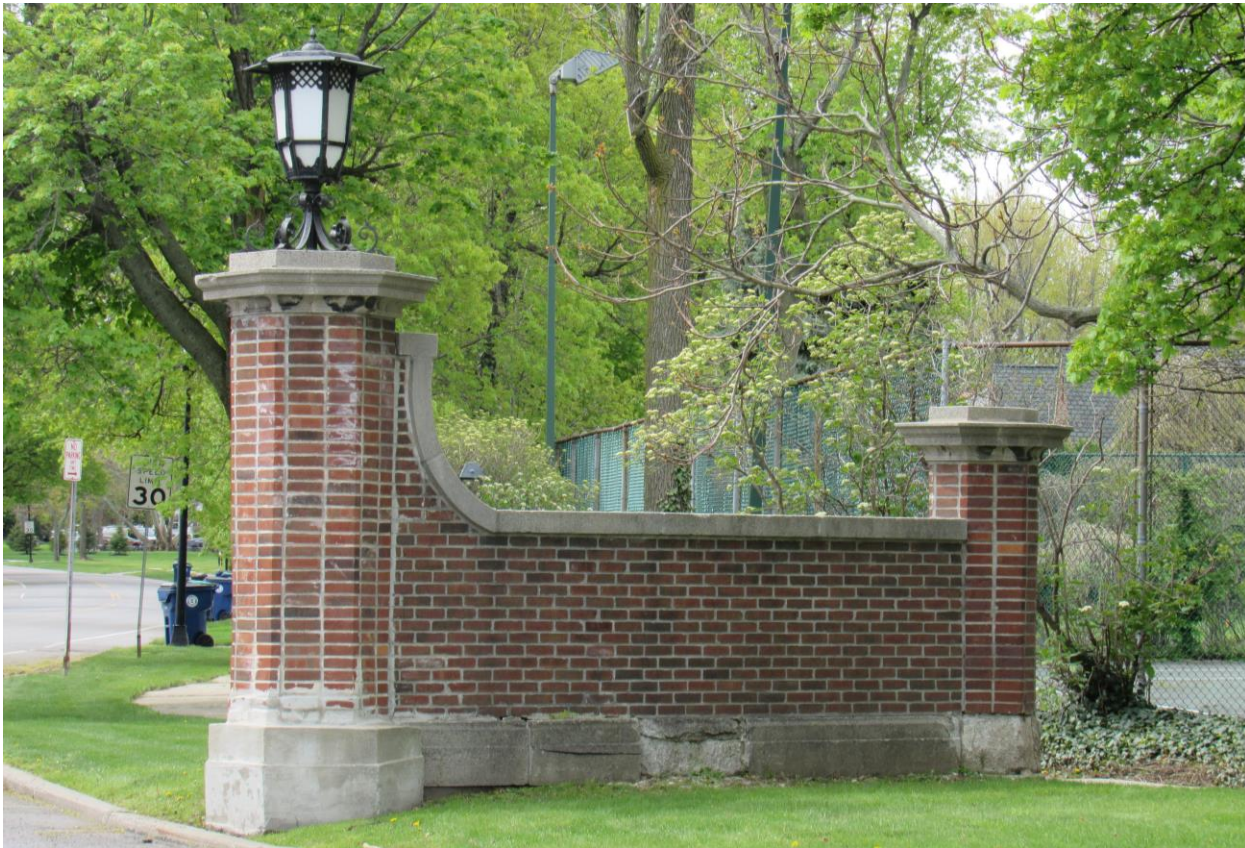
Portion of the Brick walls at LeBrun Road and Main Street