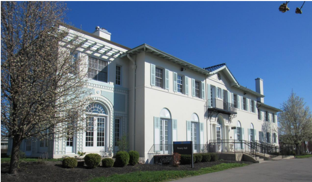
NY_Erie County_Town of Amherst_4380 Main Street_West and South Elevations