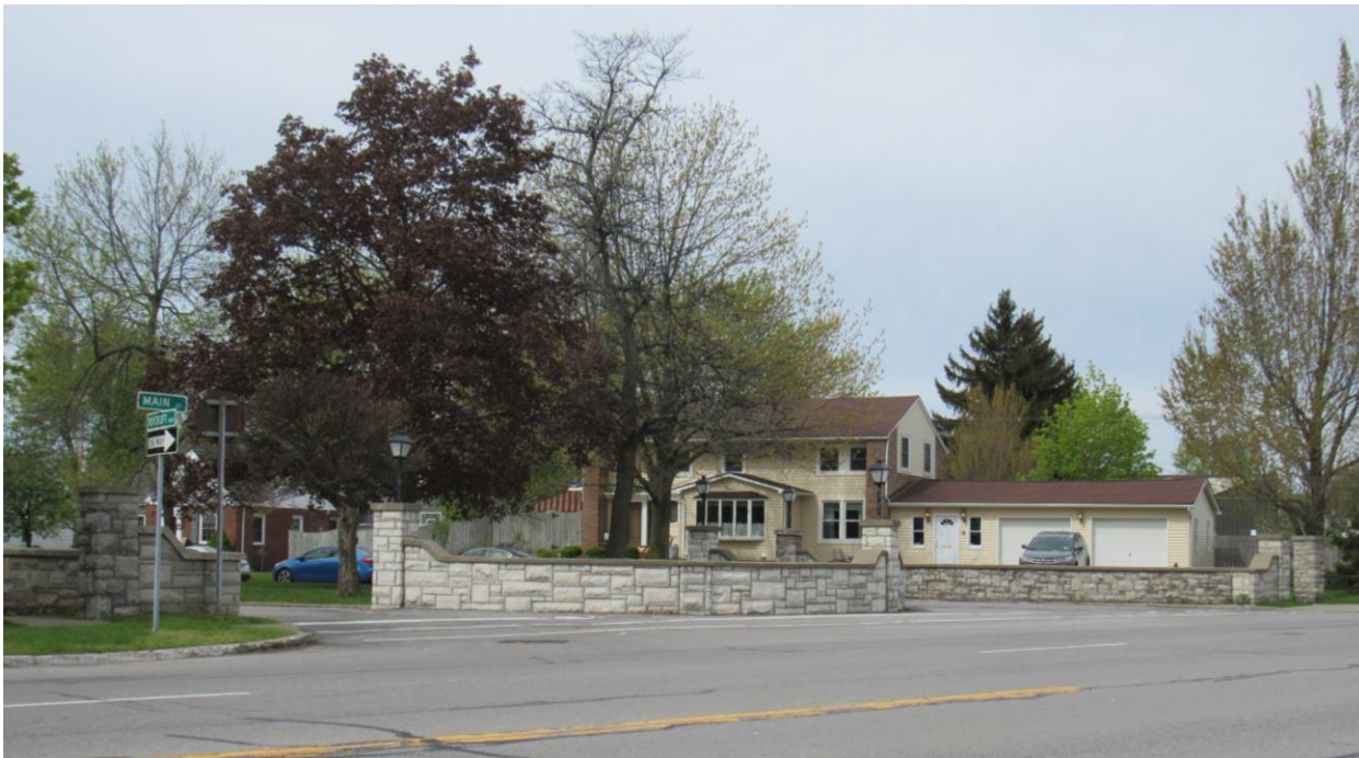
Stone walls at Roycroft and Main Street