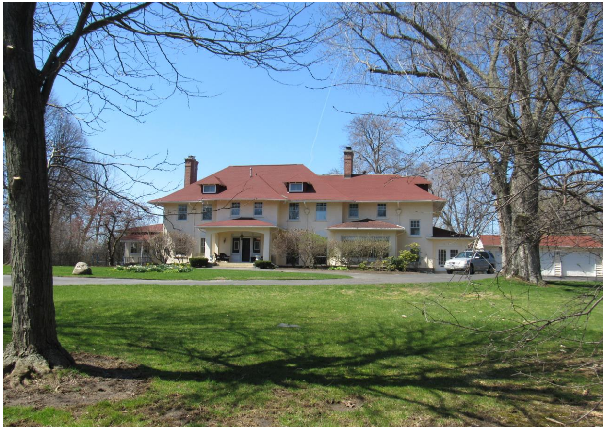
NY_Erie County_Town of Amherst_1 Cloister Court_East Elevation

20. HISTORICAL AND ARCHITECTURAL IMPORTANCE: Remains unchanged.