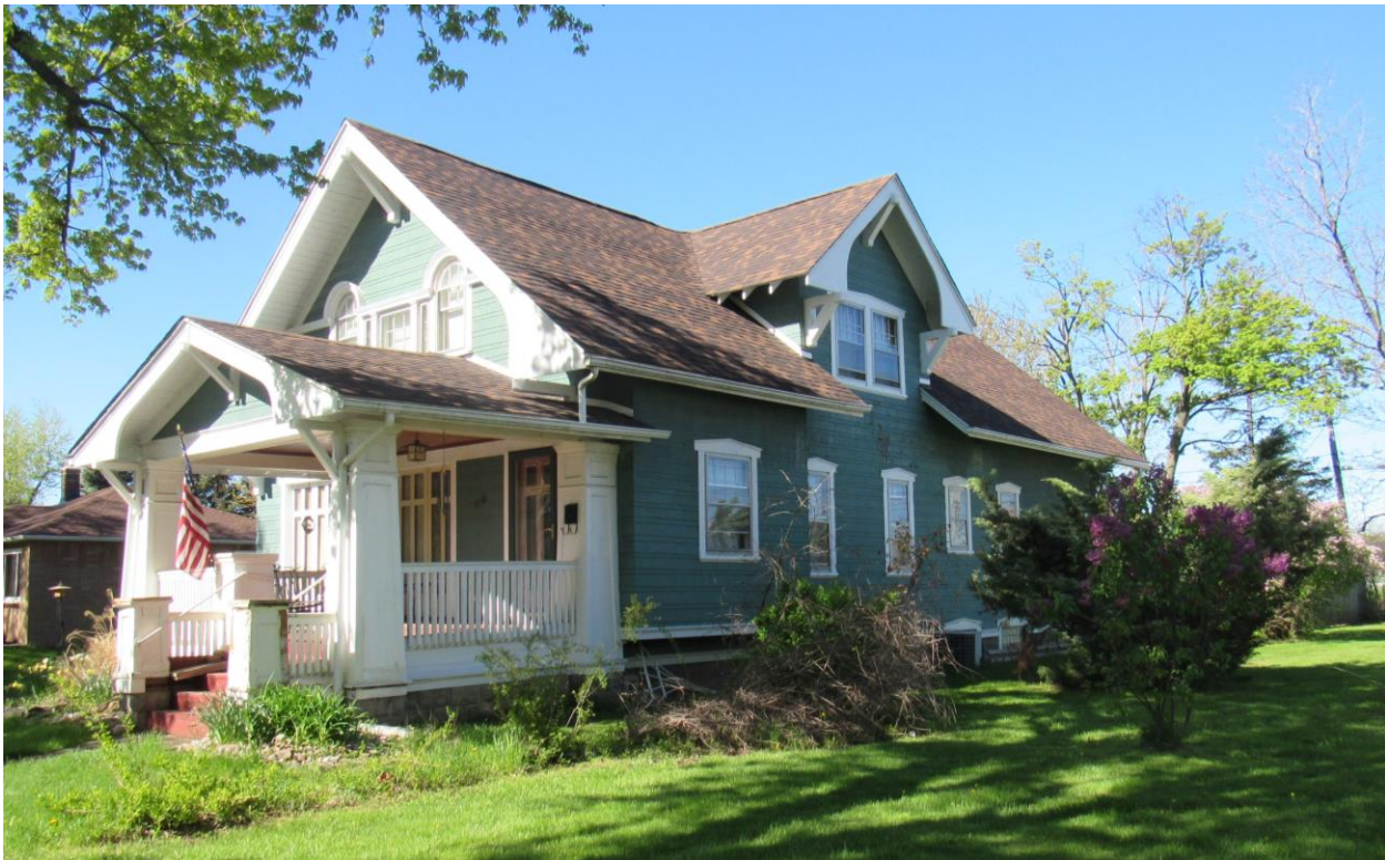
NY_Erie County_Town of Amherst_89 Royal Parkway_North and East Elevations