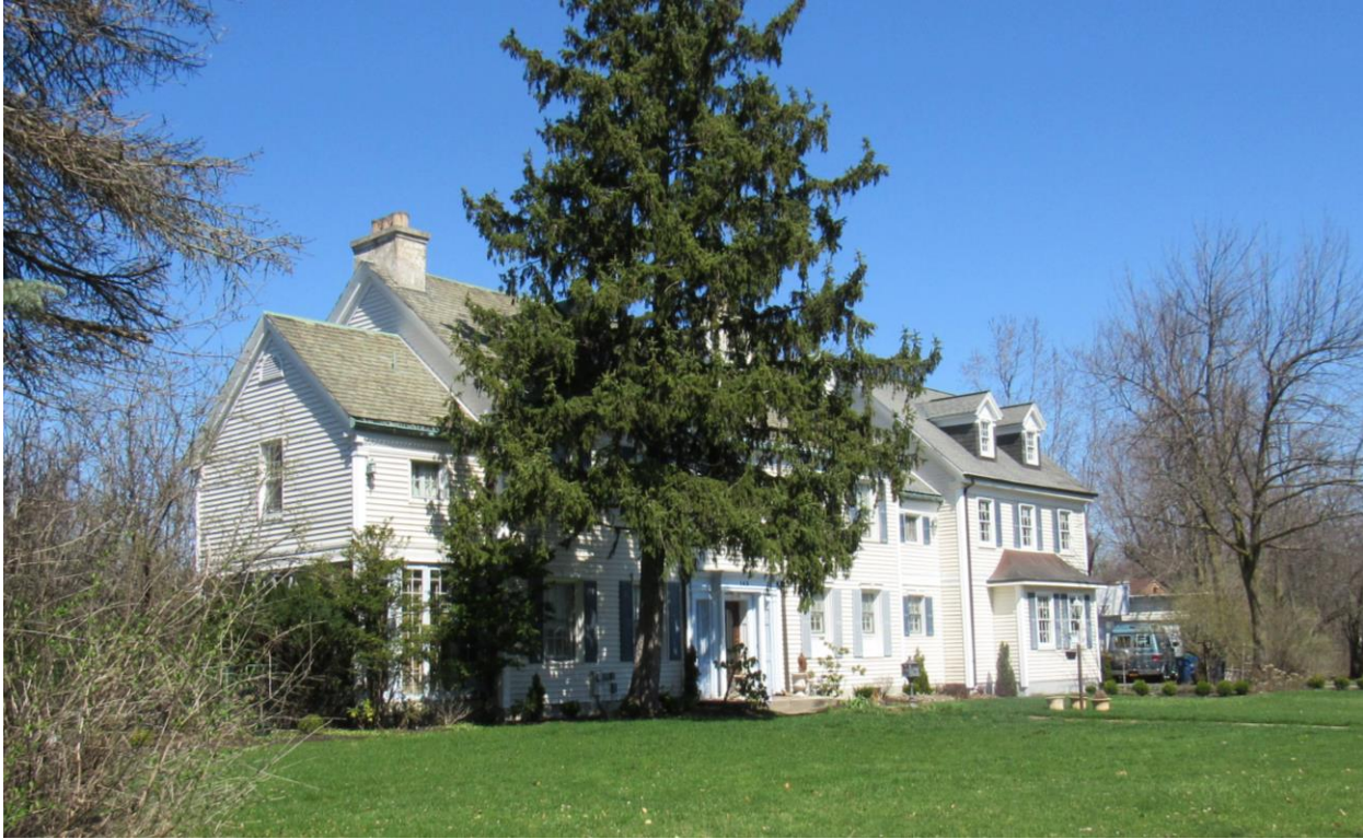
NY_Erie County_Town of Amherst_145 LeBrun Circle_South and East Elevations