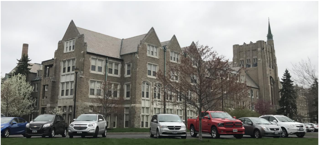
NY_Erie County_Town of Amherst_508 Mill Street_South and West Elevations