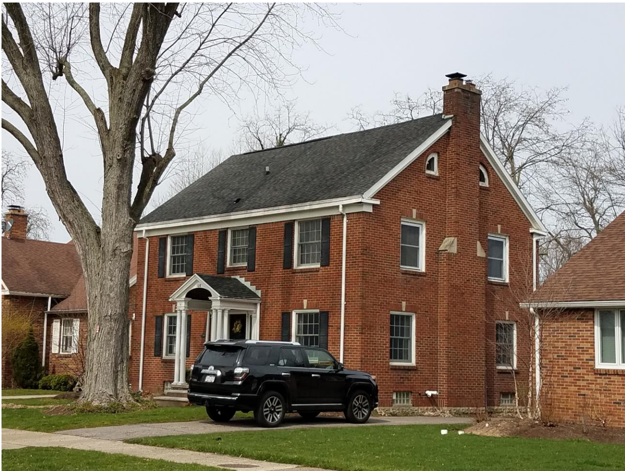
NY_Erie County_Town of Amherst_128 Crosby Boulevard_South and East Elevations