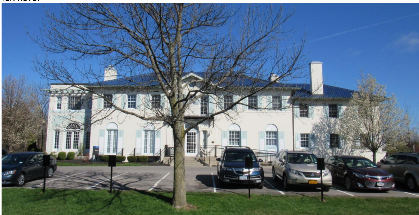
NY_Erie County_Town of Amherst_4380 Main Street_South Elevation

20. HISTORICAL AND ARCHITECTURAL IMPORTANCE: Remains Unchanged.