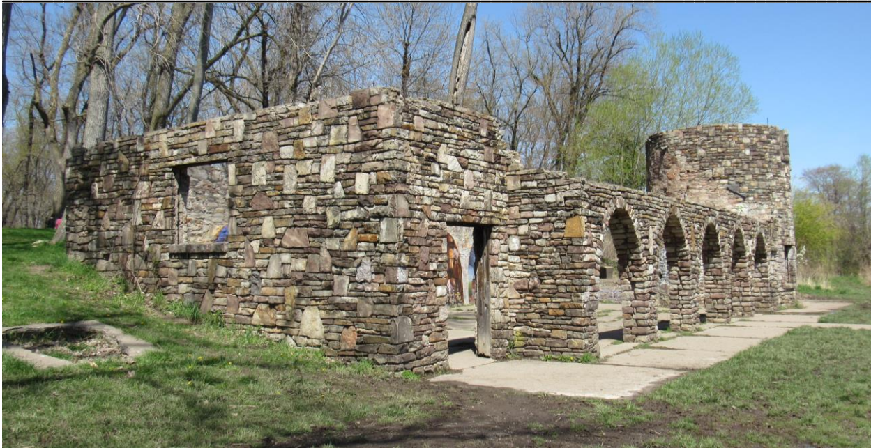
NY_Erie County_Town of Amherst_10 Creekside Drive_Boat House