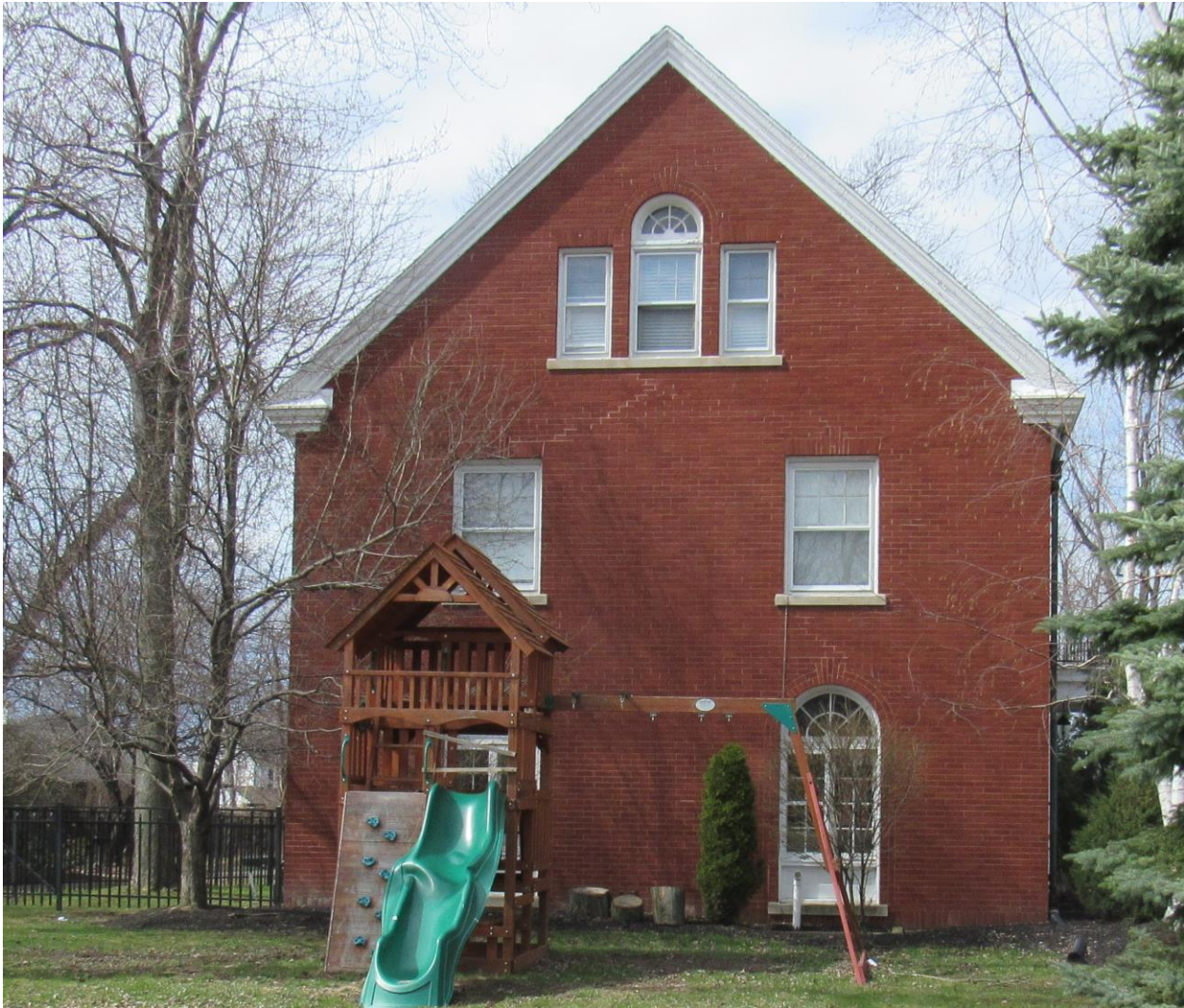
NY_Erie County_Town of Amherst_48 Park Circle_South Elevation