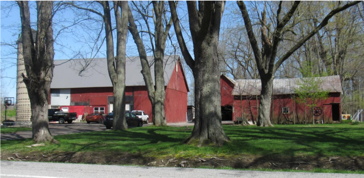
NY_Erie County_Town of Amherst_3049 Tonawanda Creek Road_North and West Elevations_Barn Complex