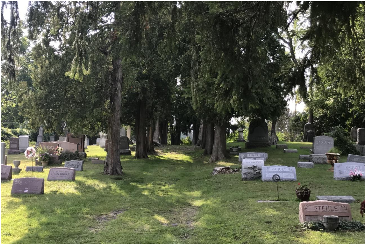
NY_Erie County_ Town of Amherst _8950 Transit_View Southwest