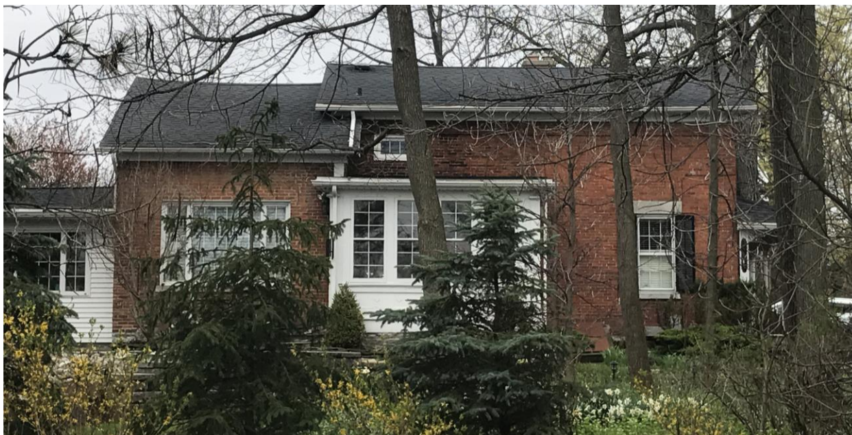
NY_Erie County_Town of Amherst_829 North Forest Road_North Elevation