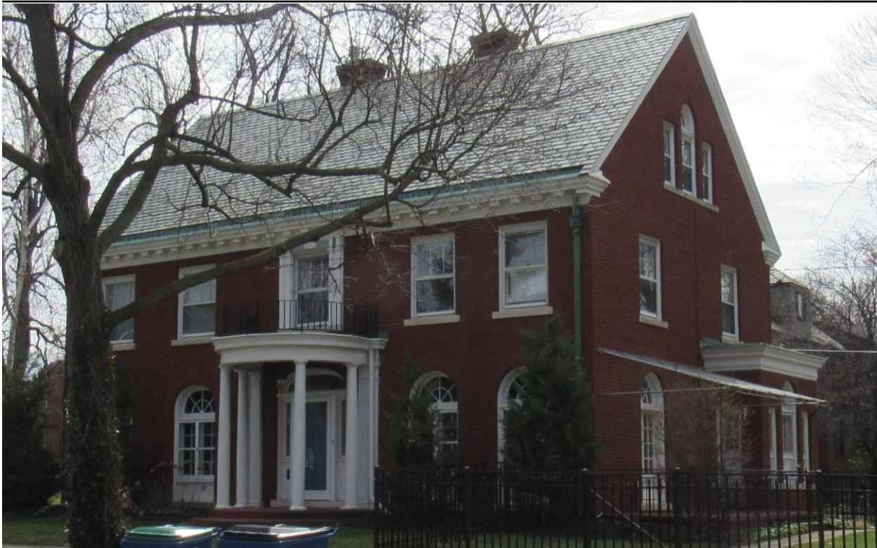
NY_Erie County_Town of Amherst_48 Park Circle_North and East Elevations