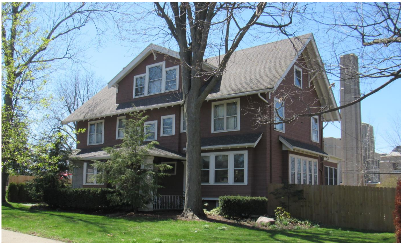
NY_Erie County_Town of Amherst_33 Washington Highway_North and East Elevations

20. HISTORICAL AND ARCHITECTURAL IMPORTANCE: Remains Unchanged.