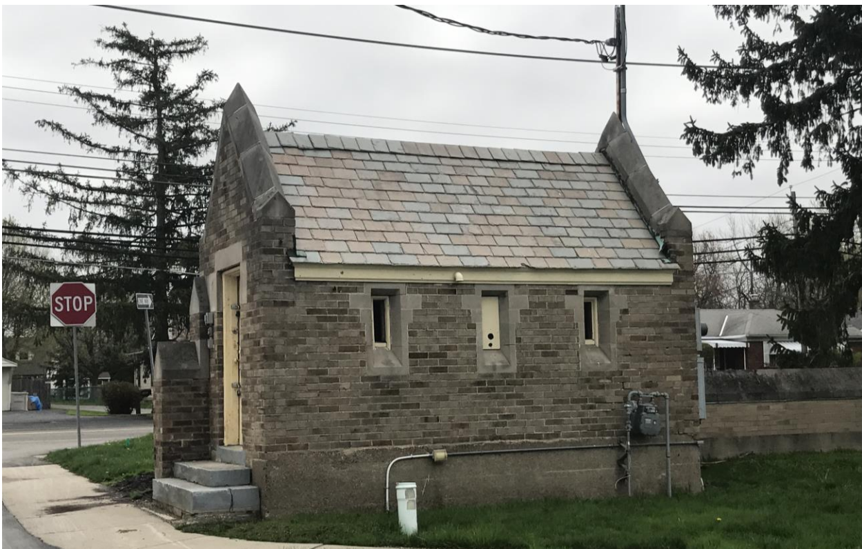
NY_Erie County_Town of Amherst_508 Mill Street_Gatehouse