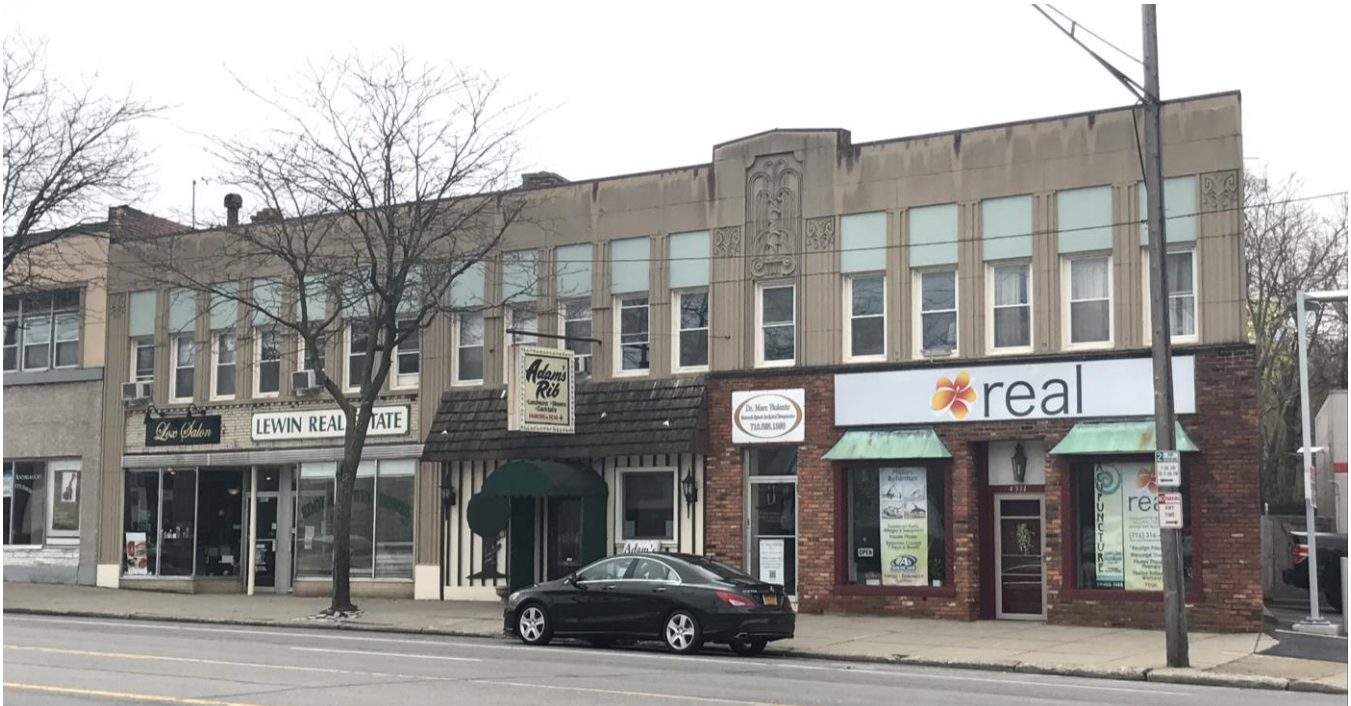
NY_Erie County_Town of Amherst_4511-4521 Main Street_North and West Elevations

20. HISTORICAL AND ARCHITECTURAL IMPORTANCE: Still meets Local Landmark Criterion despite concealment of decorative window panels.