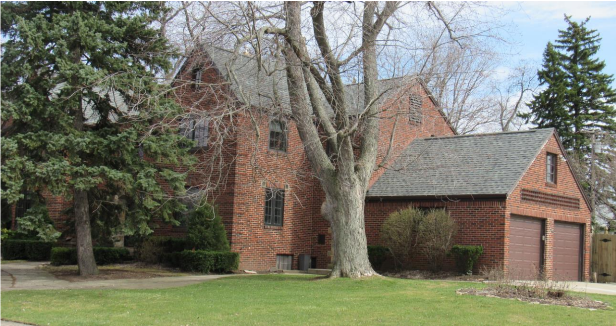
NY_Erie County_Town of Amherst_85 Crosby Boulevard_North and West Elevations

20. HISTORICAL AND ARCHITECTURAL IMPORTANCE: Still meets Local Landmark Criterion despite window modifications.