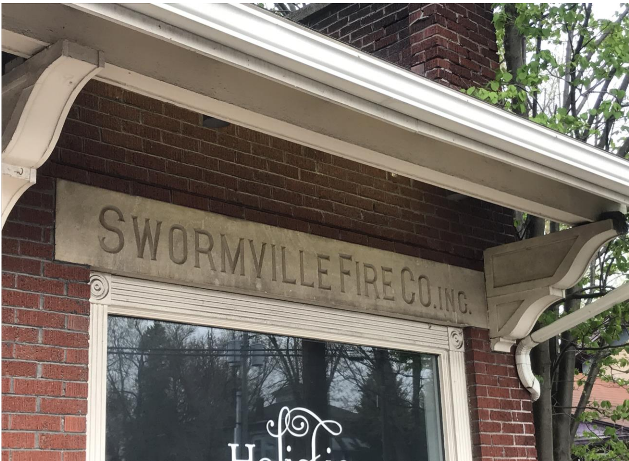
NY_Erie County_Town of Amherst_9918 Transit Road_East Elevation_Detail