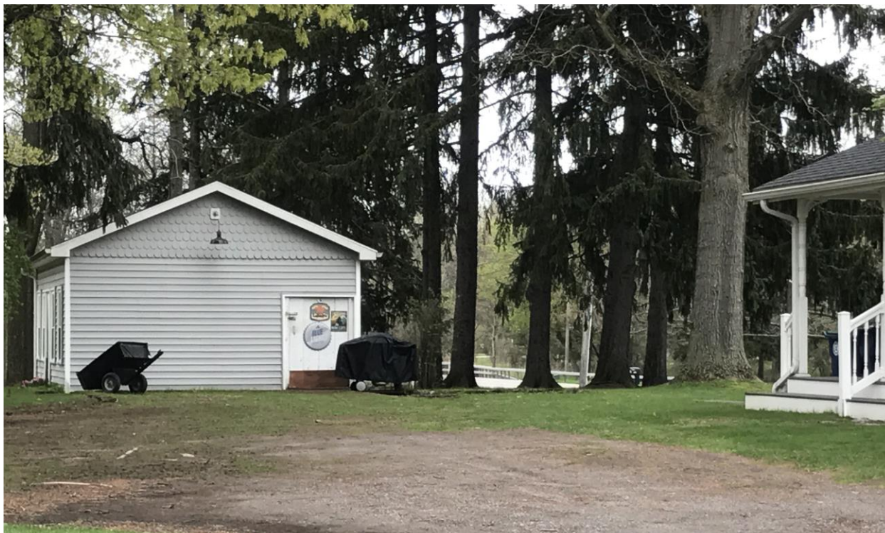
NY_Erie County_Town of Amherst_1990 Dodge Road_Detached Garage

20. HISTORICAL AND ARCHITECTURAL IMPORTANCE: No longer meets local landmark criterion due to significant alterations.