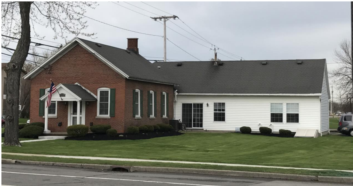
NY_Erie County_Town of Amherst_1323 North Forest Road_South and West Elevations

20. HISTORICAL AND ARCHITECTURAL IMPORTANCE: Still meets Local Landmark Criterion despite loss of some historic integrity due to large additions to rear and side