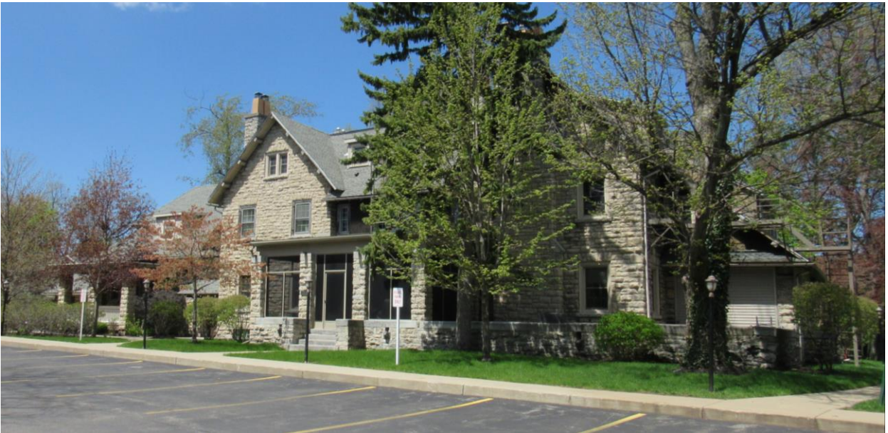
NY_Erie County_Town of Amherst_50 Getzville Road_South and East Elevations

20. HISTORICAL AND ARCHITECTURAL IMPORTANCE: Remains unchanged