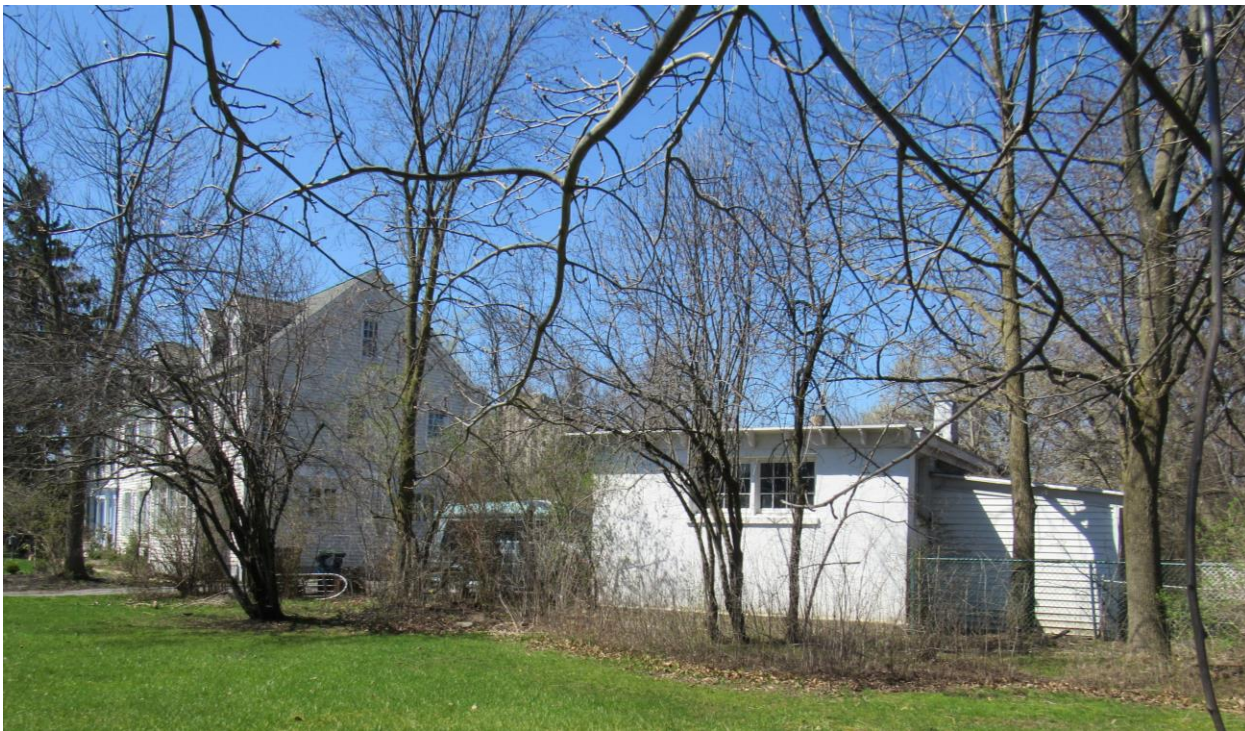
NY_Erie County_Town of Amherst_145 LeBrun Circle_North and East Elevation_Detached Garage