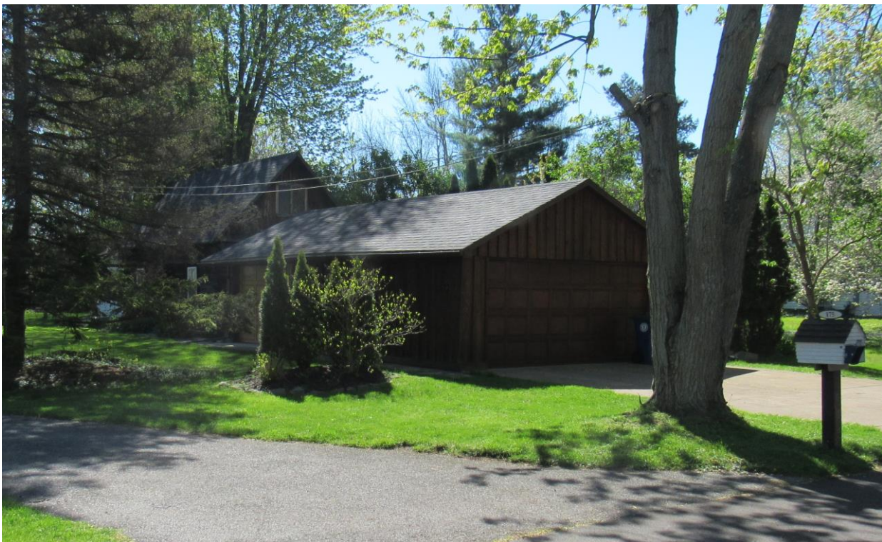
NY_Erie County_Town of Amherst_175 Stuewe Road_North and West Elevations