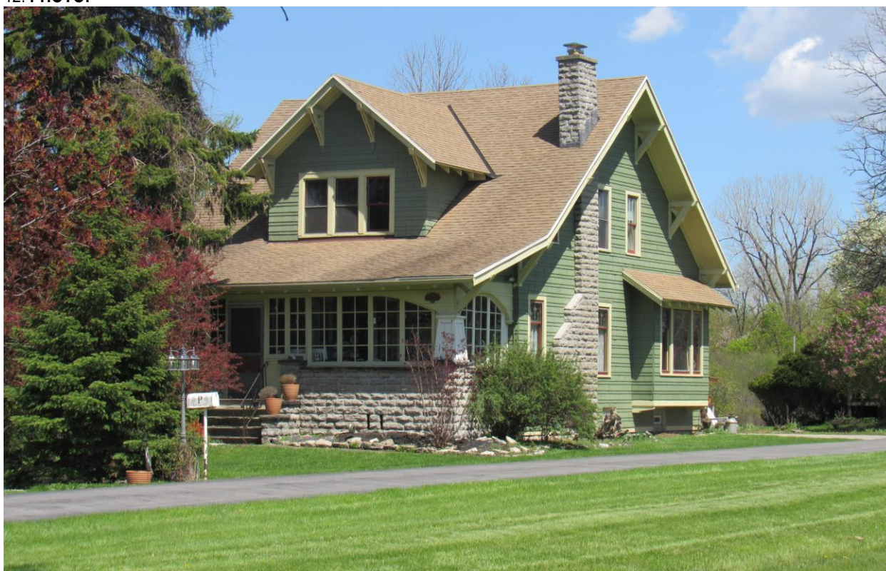
NY_Erie County_Town of Amherst_4655 Harlem Road_South and West Elevations

20. HISTORICAL AND ARCHITECTURAL IMPORTANCE: Remains Unchanged.