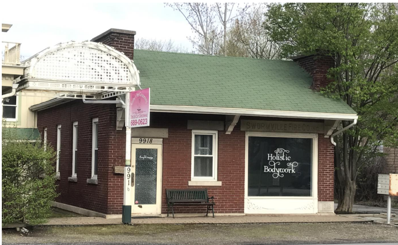
NY_Erie County_Town of Amherst_9918 Transit Road_South and East Elevations

20. HISTORICAL AND ARCHITECTURAL IMPORTANCE: Remains Unchanged