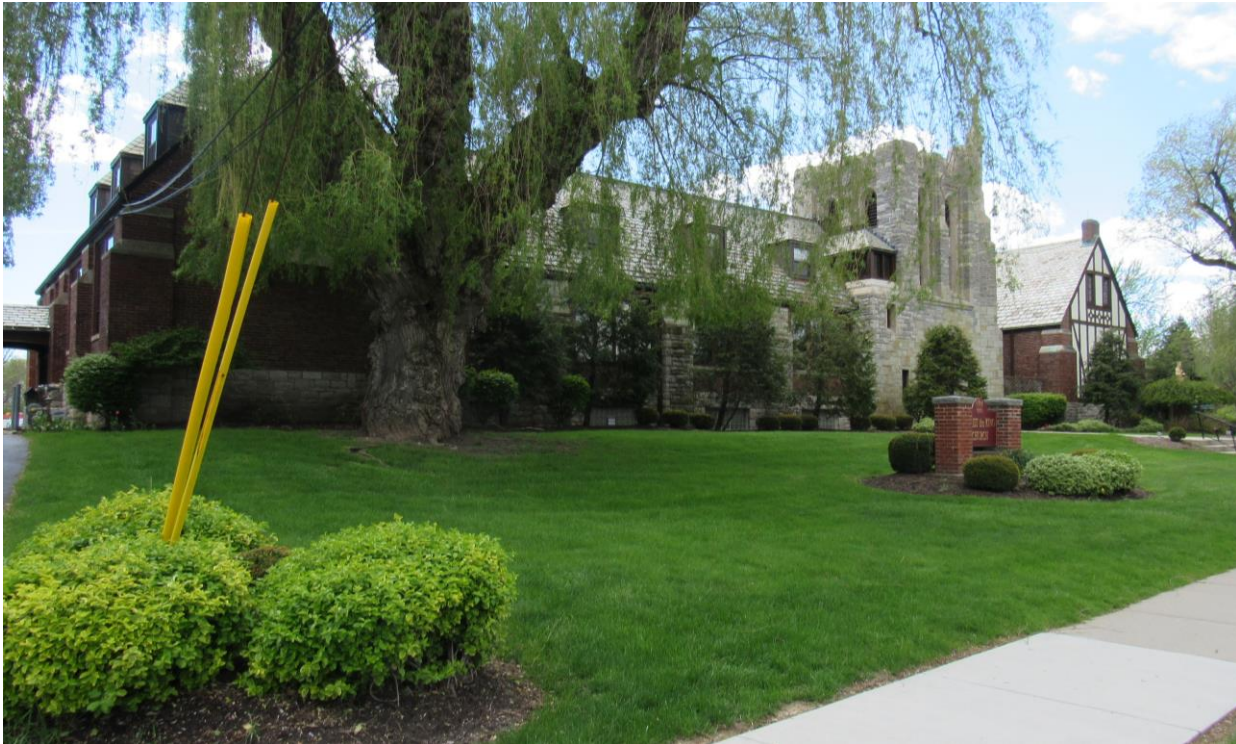
NY_Erie County_Town of Amherst_30 Lamarck Drive_North and East Elevations