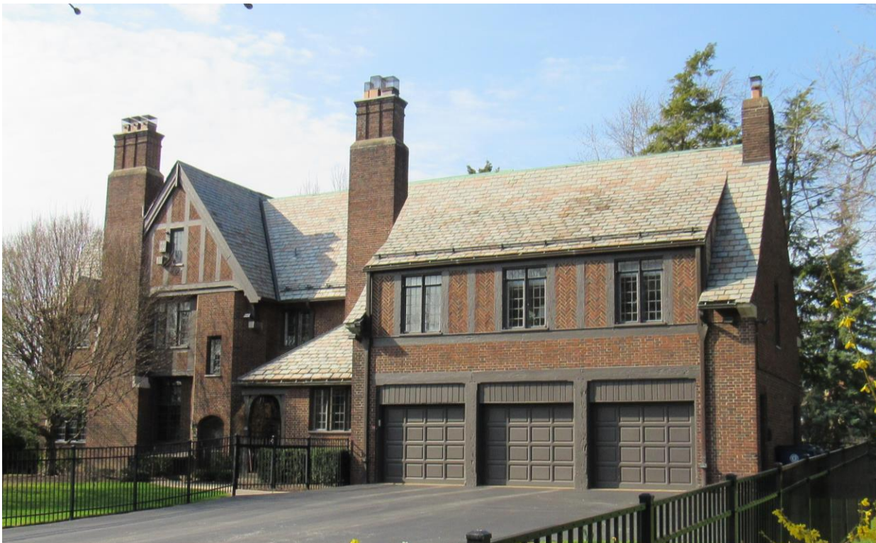
NY_Erie County_Town of Amherst_889 LeBrun Road_South and East Elevations