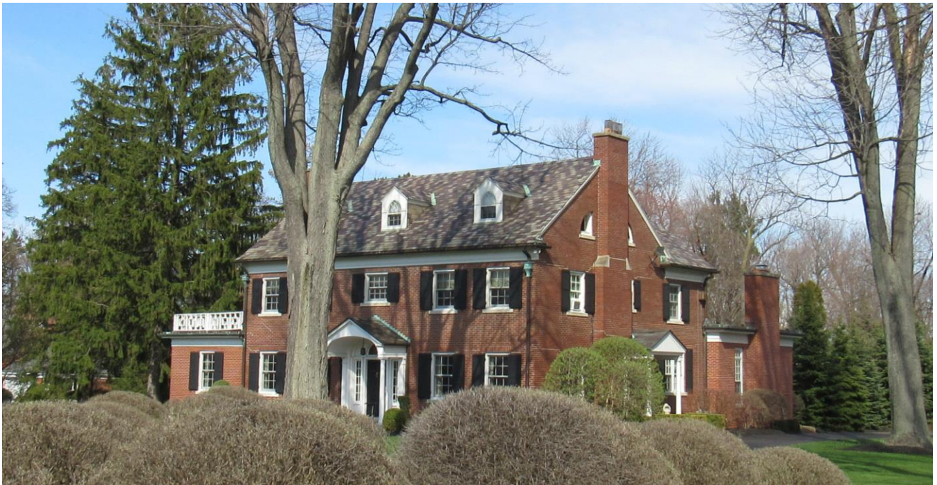
NY_Erie County_Town of Amherst_725 LeBrun Road_South and West Elevations