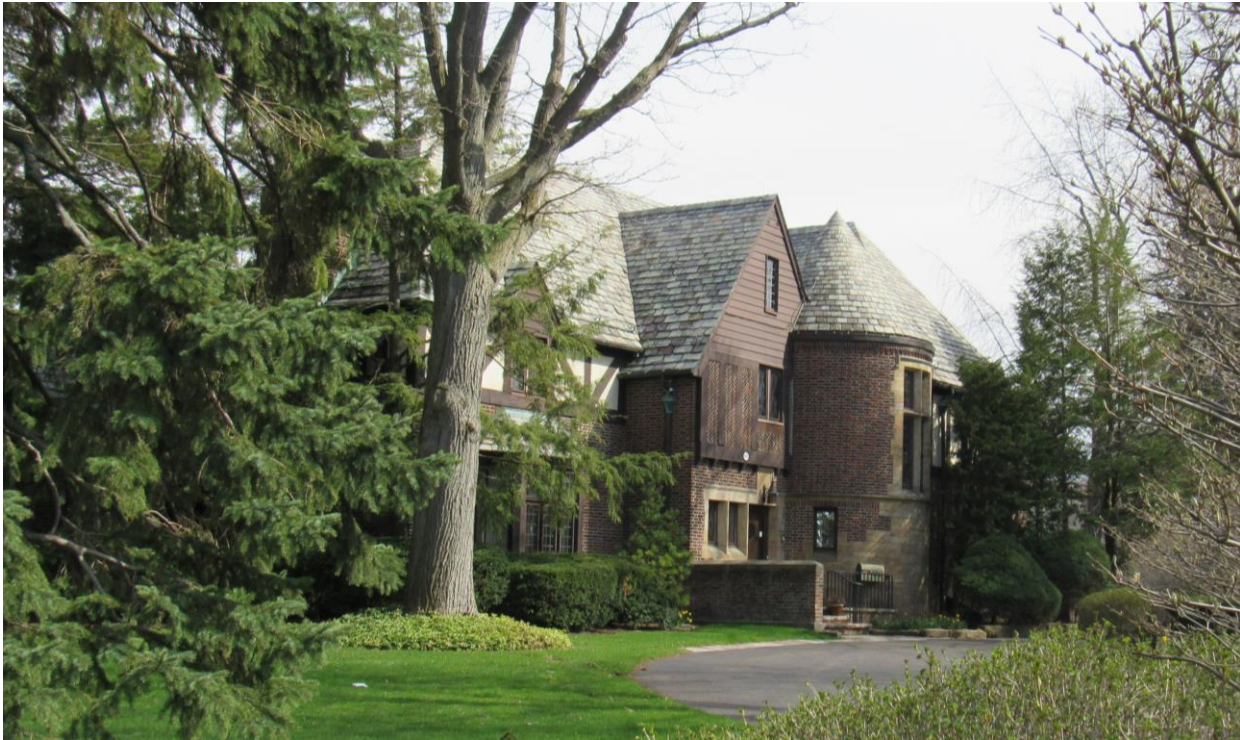
NY_Erie County_Town of Amherst_845 LeBrun Road_North and West Elevations