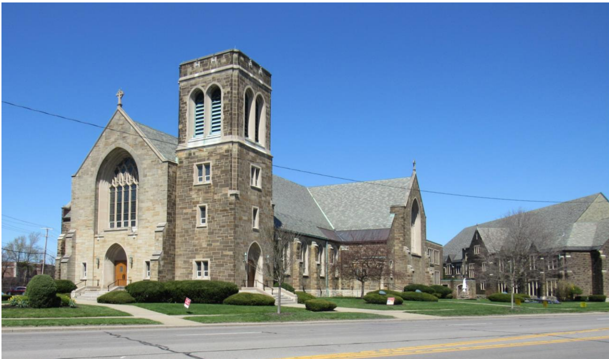
NY_Erie County_Town of Amherst_1317 Eggert Road_South and East Elevations