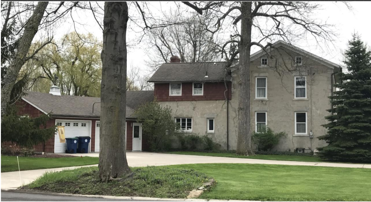
NY_Erie County_Town of Amherst_1841 North Forest Road_North and West Elevations