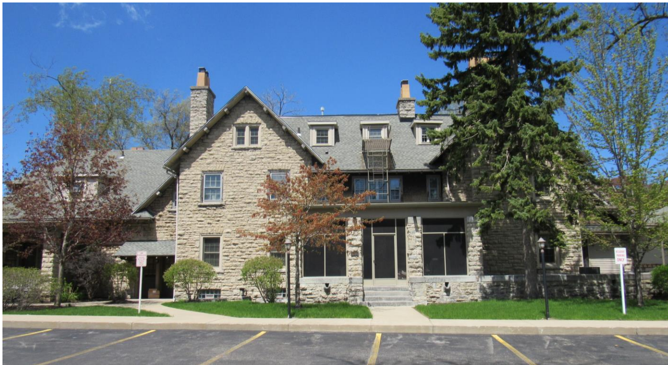
NY_Erie County_Town of Amherst_50 Getzville Road_South Elevation