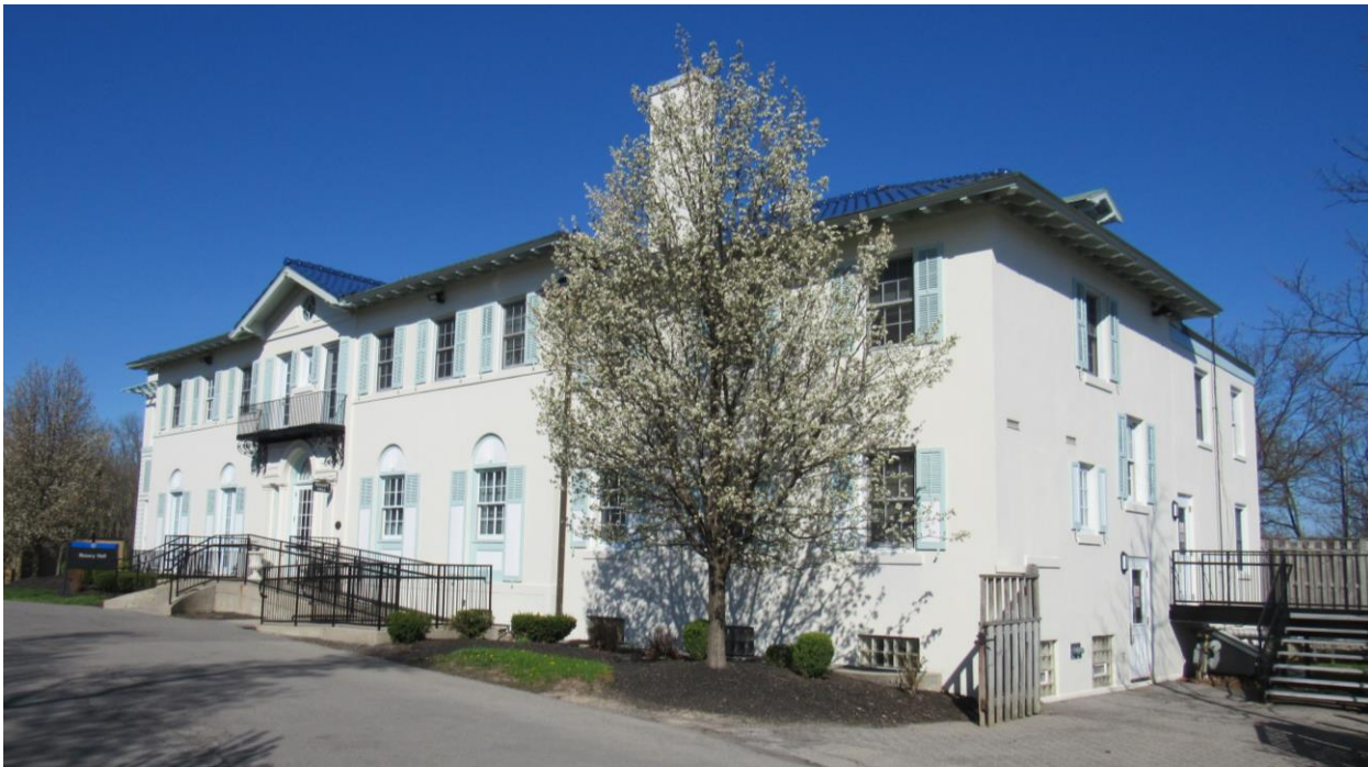
NY_Erie County_Town of Amherst_4380 Main Street_South and East Elevations