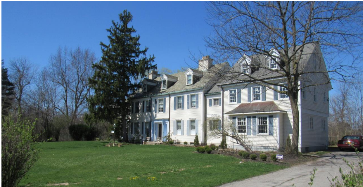
NY_Erie County_Town of Amherst_145 LeBrun Circle_North and East Elevation

20. HISTORICAL AND ARCHITECTURAL IMPORTANCE: Still meets Local Landmark Criterion despite vinyl siding and shutter replacement.