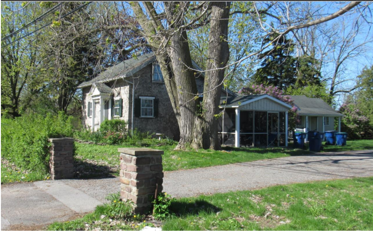
NY_Erie County_Town of Amherst_4030 Rensch Road_North and East Elevations