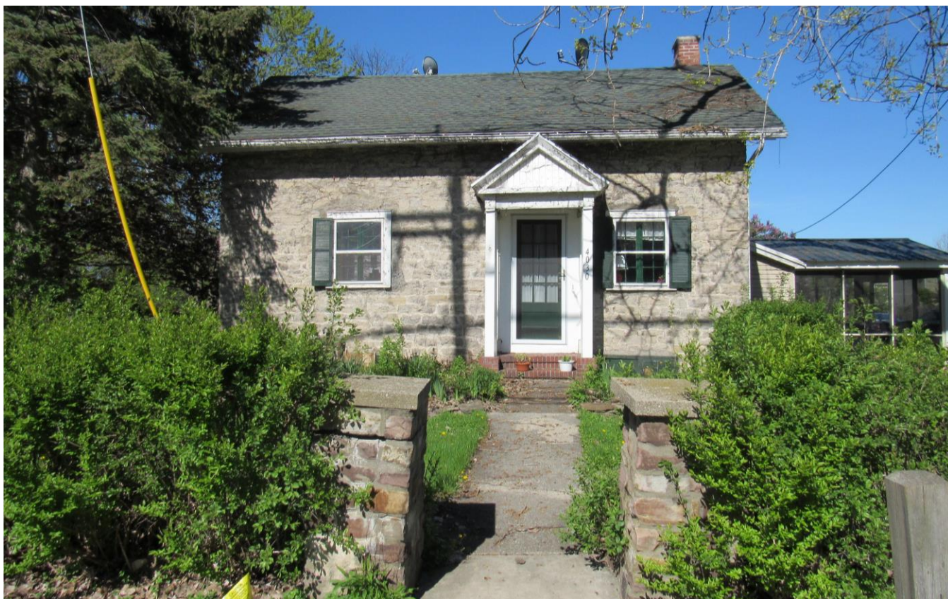
NY_Erie County_Town of Amherst_4030 Rensch Road_East Elevation

20. HISTORICAL AND ARCHITECTURAL IMPORTANCE: Remains Unchanged,