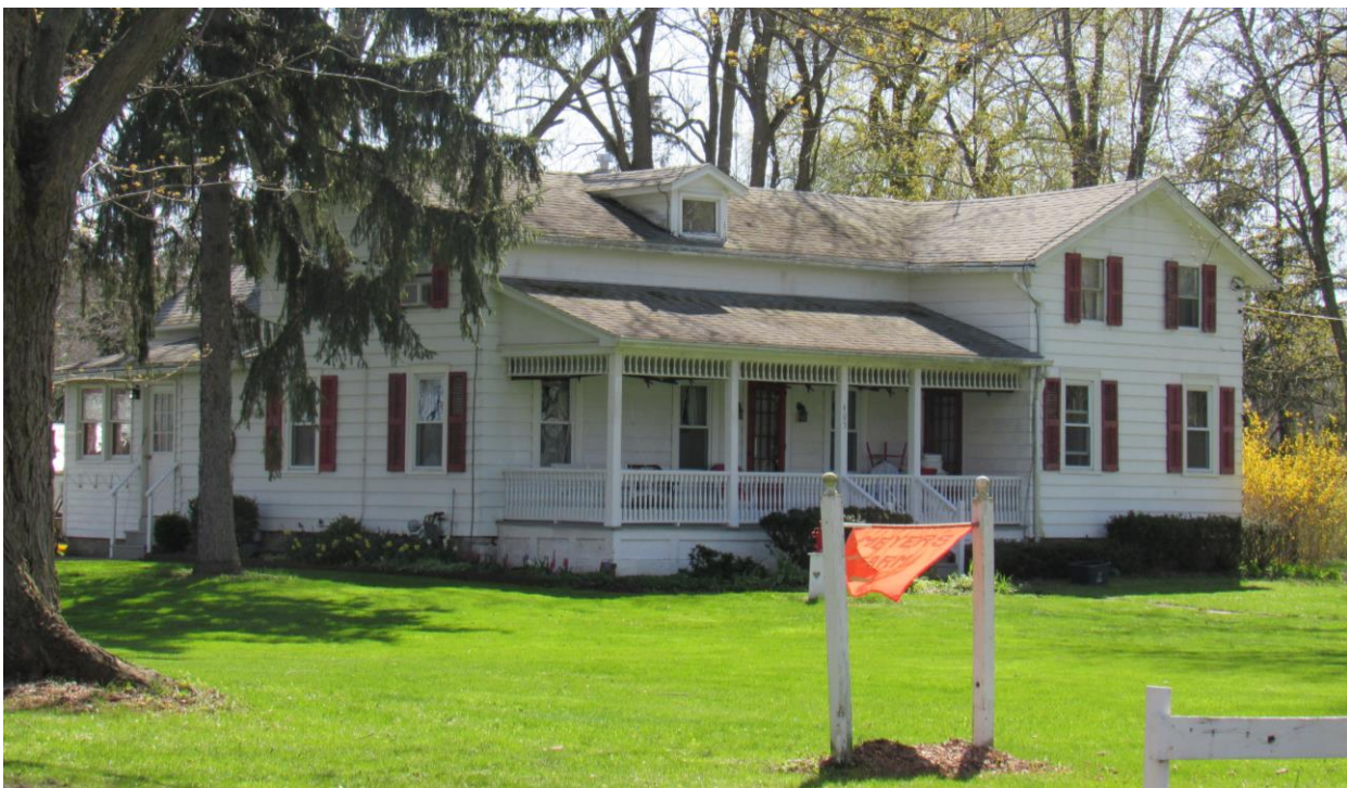
NY_Erie County_Town of Amherst_405 Schoelles Road_North and East Elevations