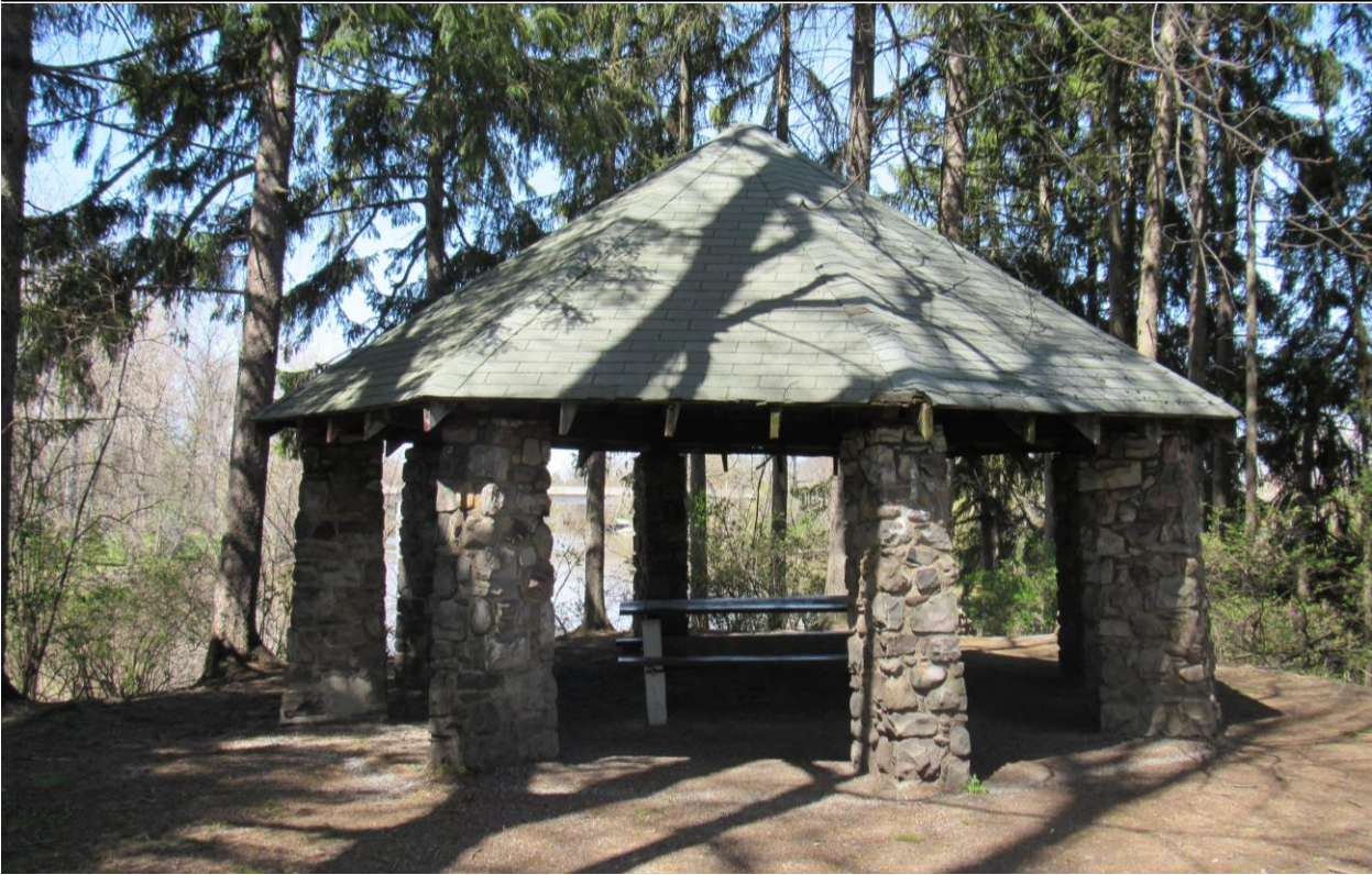
NY_Erie County_Town of Amherst_10 Creekside Drive_Shelter_I-35