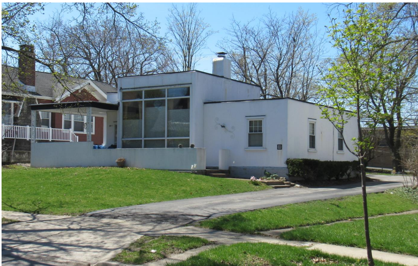
NY_Erie County_Town of Amherst_55 Washington Highway_North and East Elevations

20. HISTORICAL AND ARCHITECTURAL IMPORTANCE: Remains Unchanged