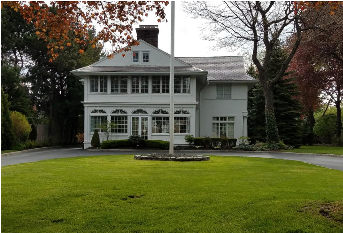
NY_Erie County_ Town of Amherst _23 Four Seasons Rd West_ West Elevation