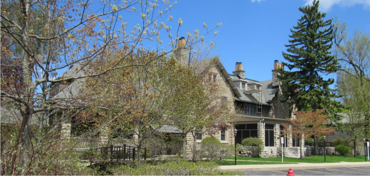
NY_Erie County_Town of Amherst_50 Getzville Road_South and West Elevations