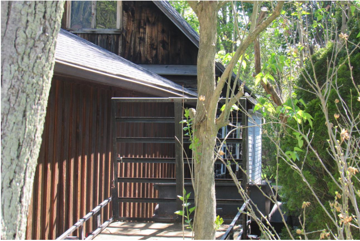
NY_Erie County_Town of Amherst_175 Stuewe Road_North and East Elevations