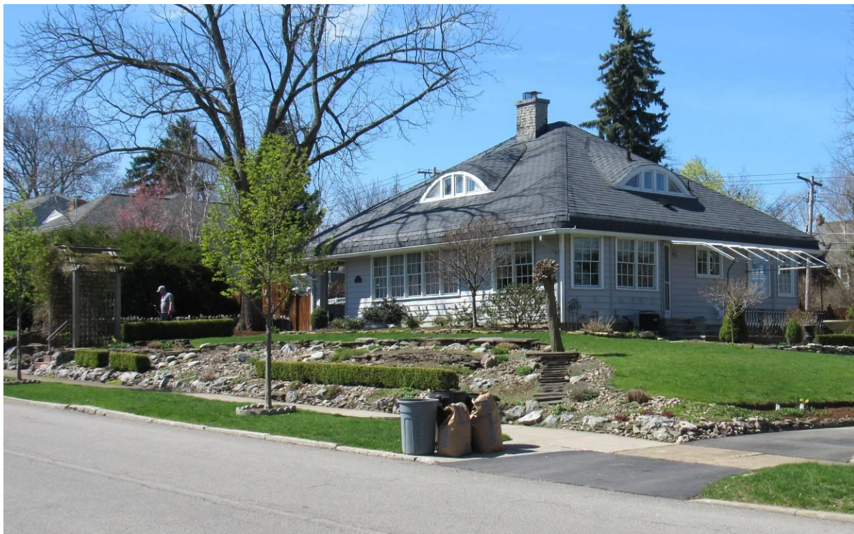
NY_Erie County_ Town of Amherst _89 Berryman Drive_ North and East Elevations