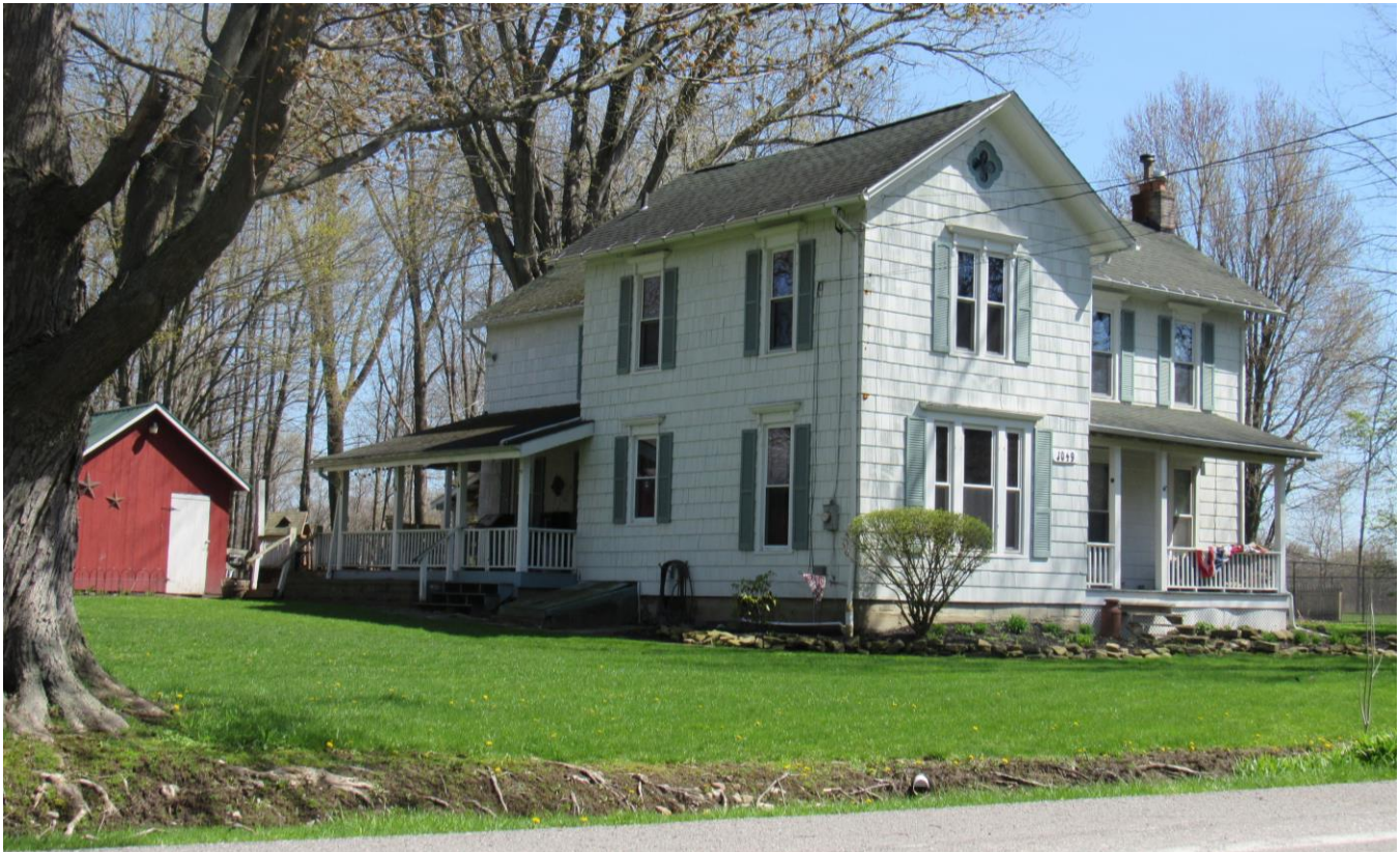
NY_Erie County_Town of Amherst_3049 Tonawanda Creek Road_North and East Elevations

20. HISTORICAL AND ARCHITECTURAL IMPORTANCE: Remains Unchanged.