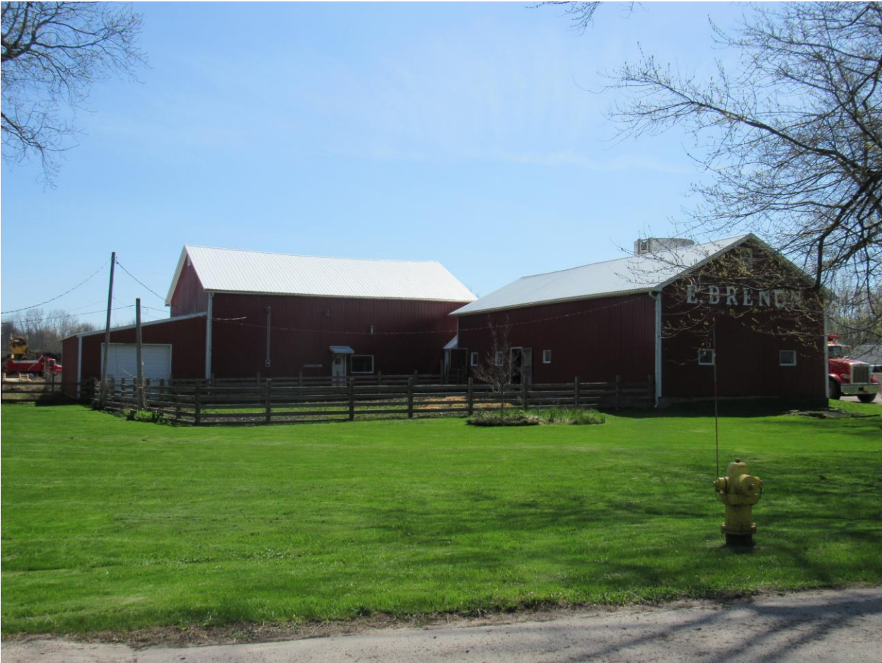
NY_Erie County_Town of Amherst_215 Brenon Road_Barns East of 215 Brenon_North and East Elevations

20. HISTORICAL AND ARCHITECTURAL IMPORTANCE: Still meets Local Landmark Criterion despite vinyl siding and eave modifications.