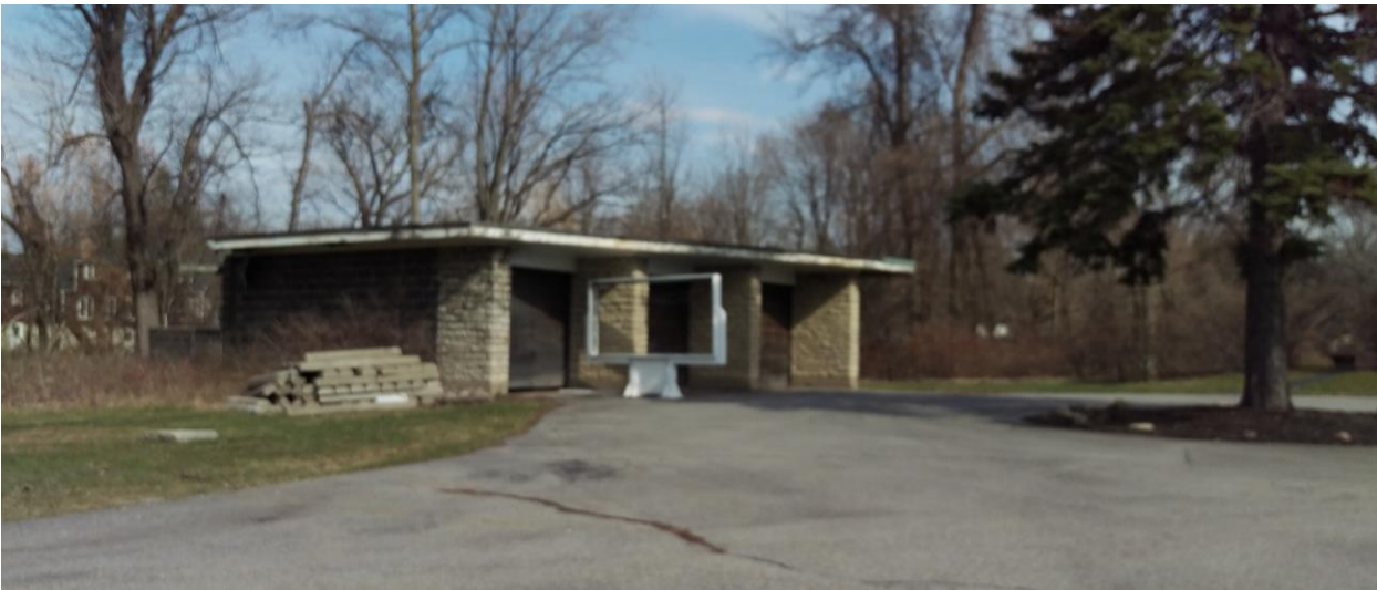
NY_Erie County_Town of Amherst_895 North Forest Road_South and West Elevations_Detached Garage