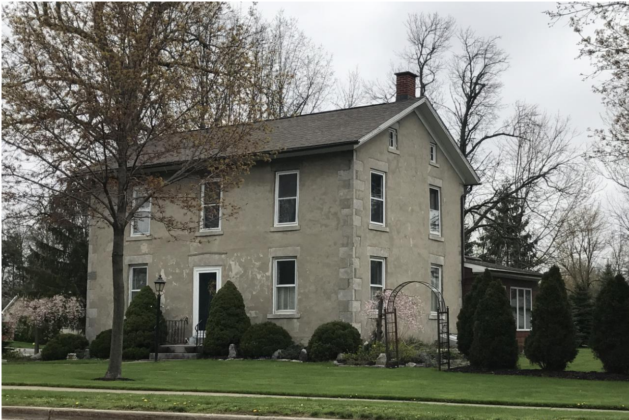
NY_Erie County_Town of Amherst_1841 North Forest Road_South and West Elevations