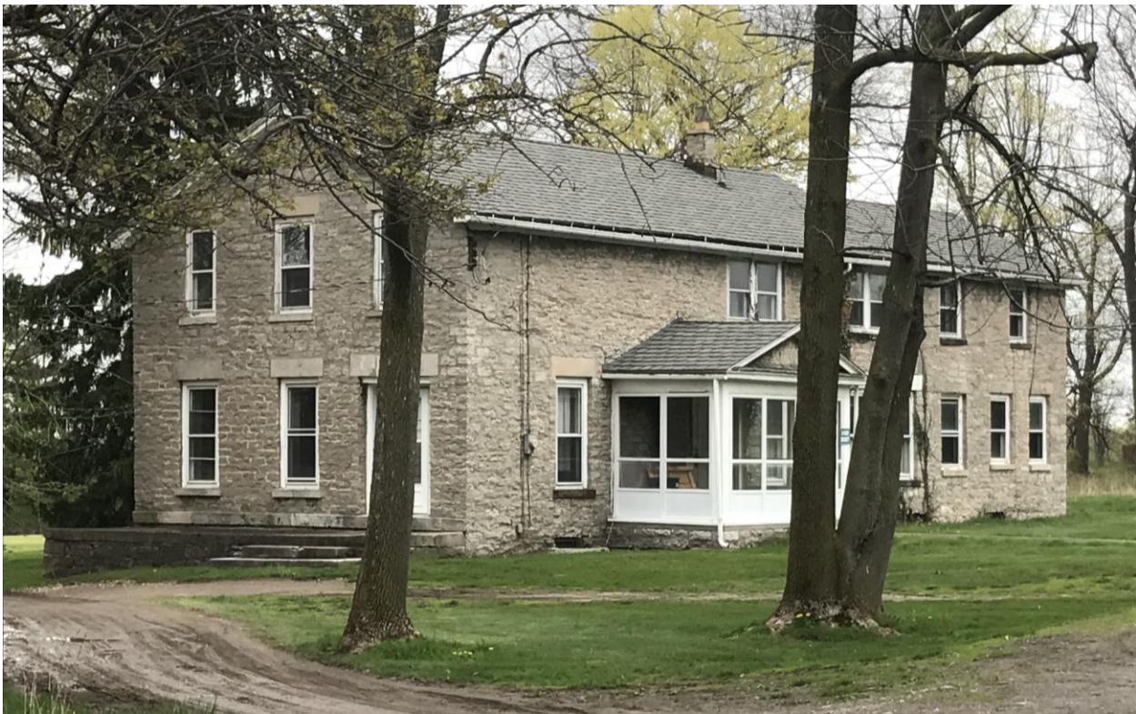
NY_Erie County_Town of Amherst_250 Youngs Road_South and West Elevations

20. HISTORICAL AND ARCHITECTURAL IMPORTANCE: Remains Unchanged.