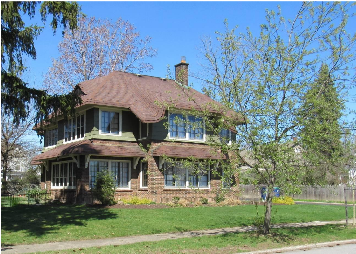
NY_Erie County_ Town of Amherst_ 5 Berryman Drive_ South and West Elevations

20. HISTORICAL AND ARCHITECTURAL IMPORTANCE: Remains unchanged.