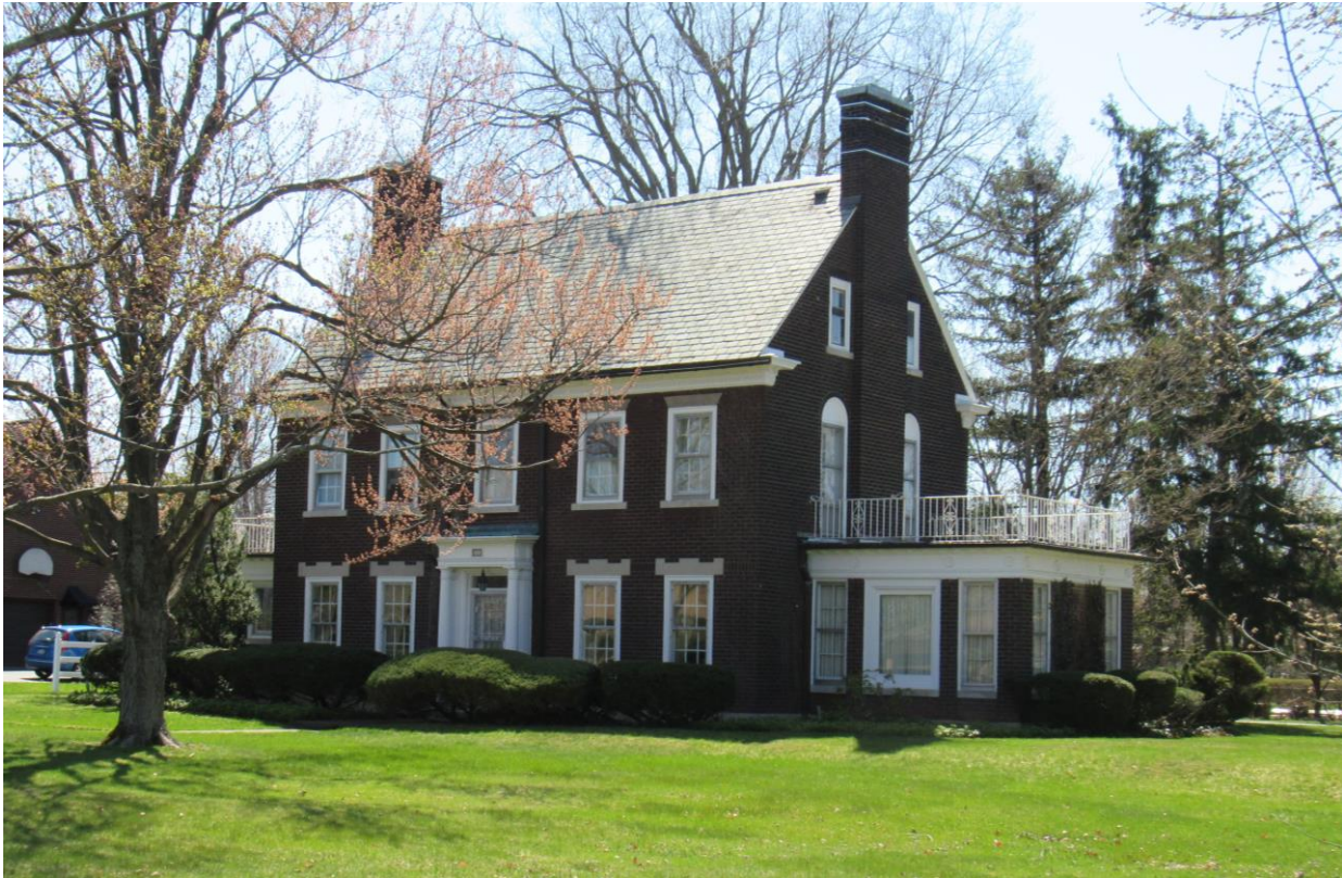
NY_Erie County_Town of Amherst_381 LeBrun Road_North and West Elevation