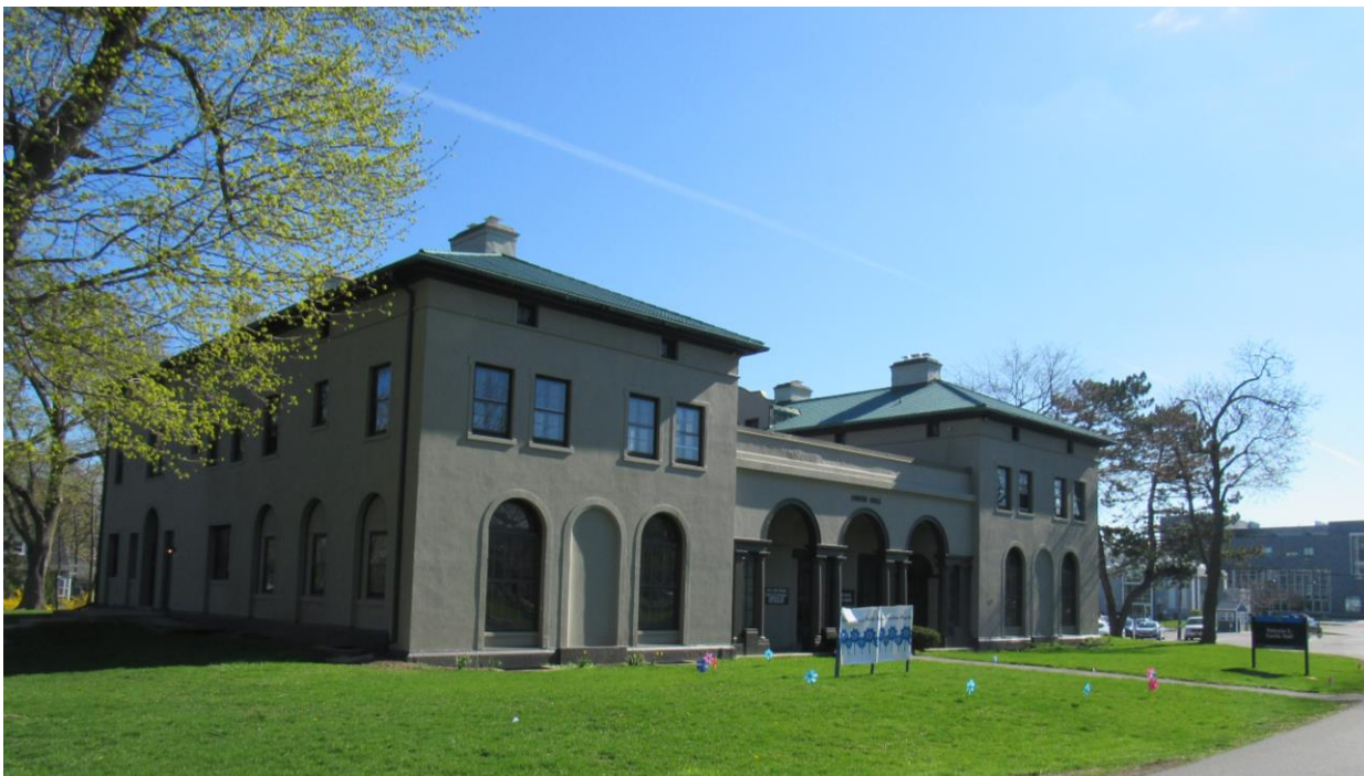
NY_Erie County_Town of Amherst_4380 Main Street_South and West Elevations