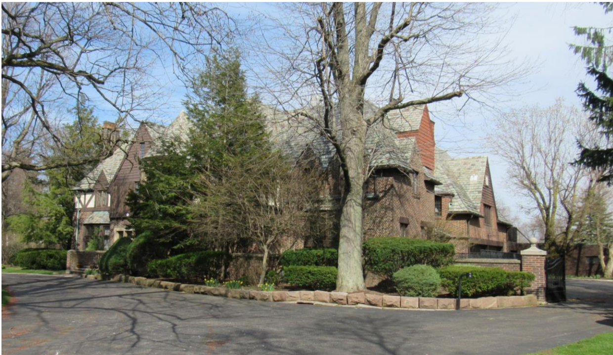
NY_Erie County_Town of Amherst_845 LeBrun Road_South and West Elevations