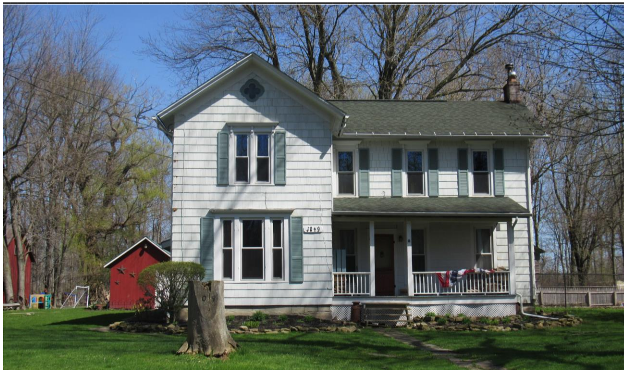
NY_Erie County_Town of Amherst_3049 Tonawanda Creek Road_North Elevation