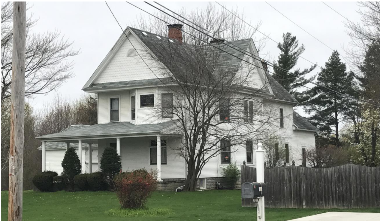
NY_Erie County_Town of Amherst_954 North Forest Road_North and East Elevations

20. HISTORICAL AND ARCHITECTURAL IMPORTANCE: Still meets Local Landmark Criterion despite loss of some material integrity with vinyl siding and other modifications.