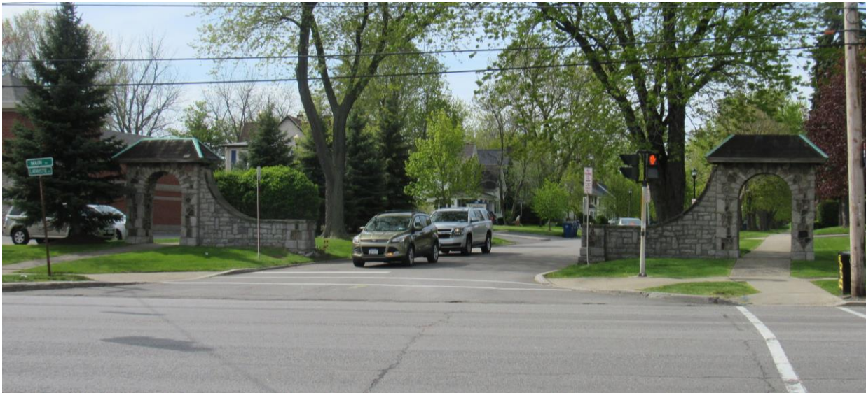
Stone walls at Lafayette Boulevard and Main Street