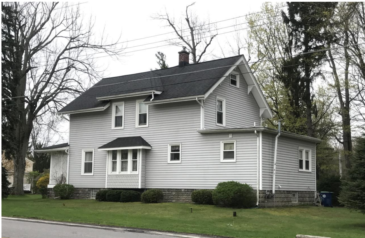
NY_Erie County_Town of Amherst_1990 Dodge Road_North and West Elevations