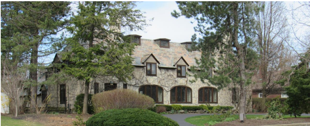
NY_Erie County_Town of Amherst_74 Keswick Road_South and West Elevations