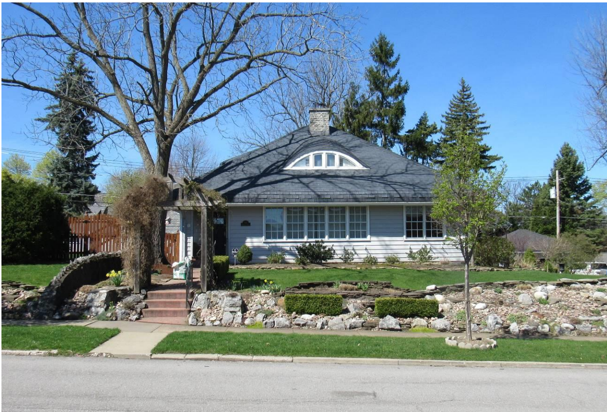
NY_Erie County_ Town of Amherst _89 Berryman Drive_East Elevation

20. HISTORICAL AND ARCHITECTURAL IMPORTANCE: Still meets Local Landmark Criterion despite vinyl siding and window modifications.