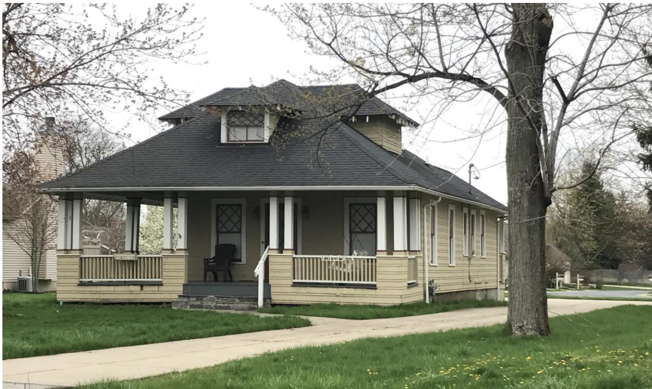
NY_Erie County_Town of Amherst_1000 North Forest Road_North and East Elevations

20. HISTORICAL AND ARCHITECTURAL IMPORTANCE: Still meets Local Landmark Criterion despite loss of contributing garage.