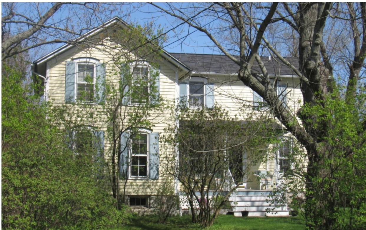
NY_Erie County_Town of Amherst_1025 New Road_West Elevation

20. HISTORICAL AND ARCHITECTURAL IMPORTANCE: Remains unchanged.