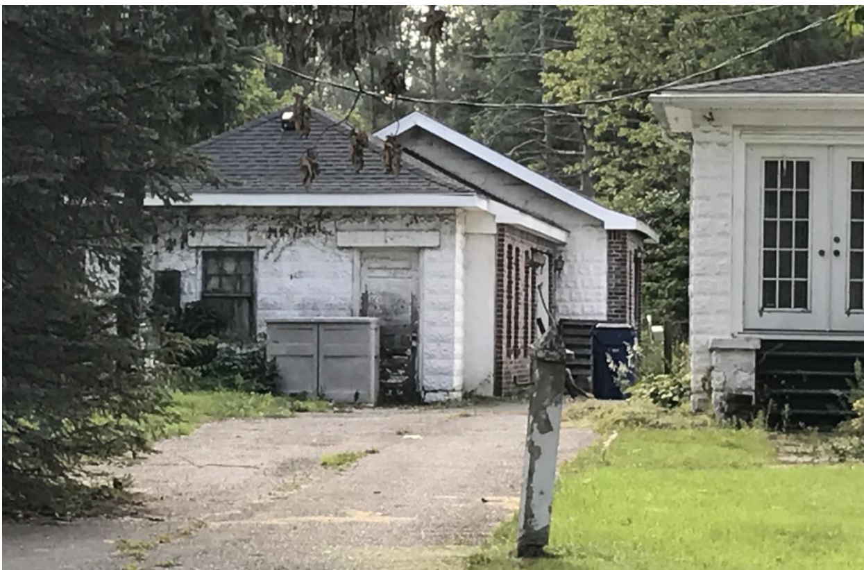
NY_Erie County_Town of Amherst_9980 Transit Road_Detached Garage