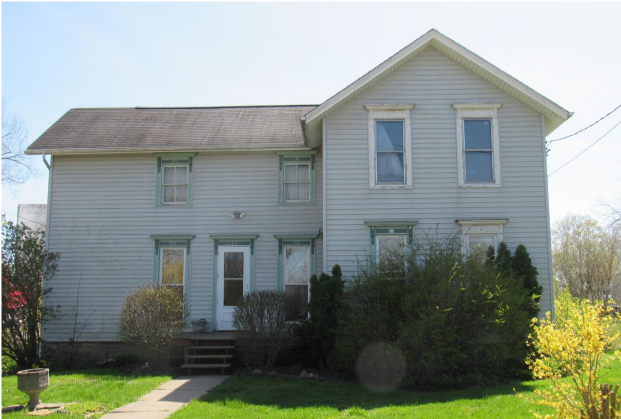
NY_Erie County_Town of Amherst_215 Brenon Road_North Elevation