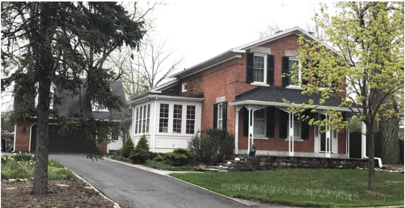
NY_Erie County_Town of Amherst_829 North Forest Road_North and West Elevations

20. HISTORICAL AND ARCHITECTURAL IMPORTANCE: Remains Unchanged.