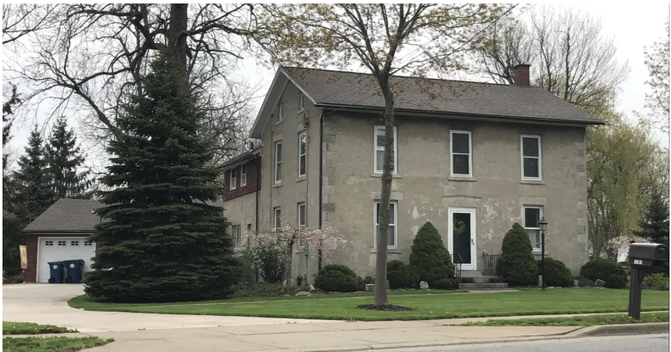
NY_Erie County_Town of Amherst_1841 North Forest Road_North and West Elevations

20. HISTORICAL AND ARCHITECTURAL IMPORTANCE: Remains unchanged.