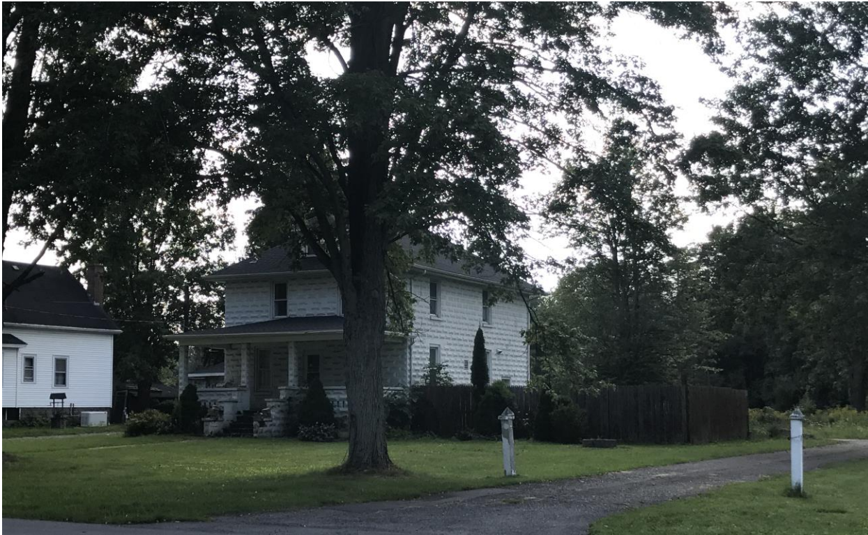
NY_Erie County_Town of Amherst_9980 Transit Road_View Southwest