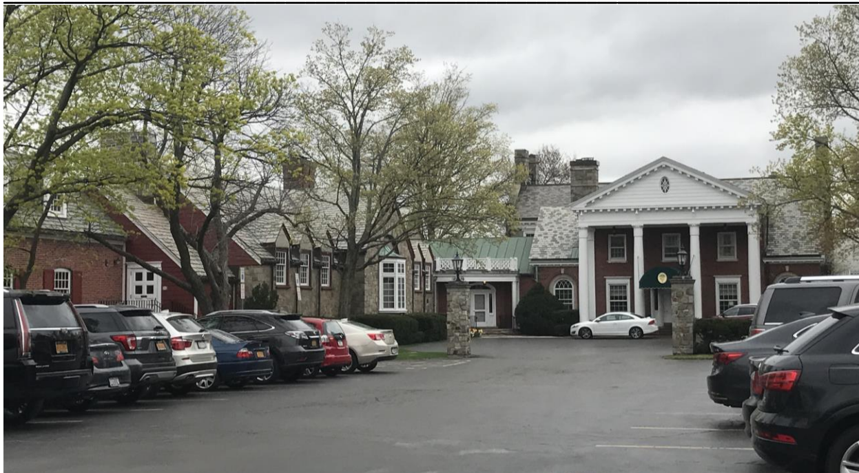
NY_Erie County_Town of Amherst_250 Youngs Road_South and West Elevations