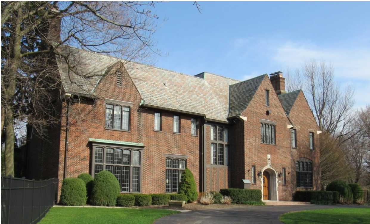
NY_Erie County_Town of Amherst_889 LeBrun Road_North and West Elevations

20. HISTORICAL AND ARCHITECTURAL IMPORTANCE: Remains Unchanged.