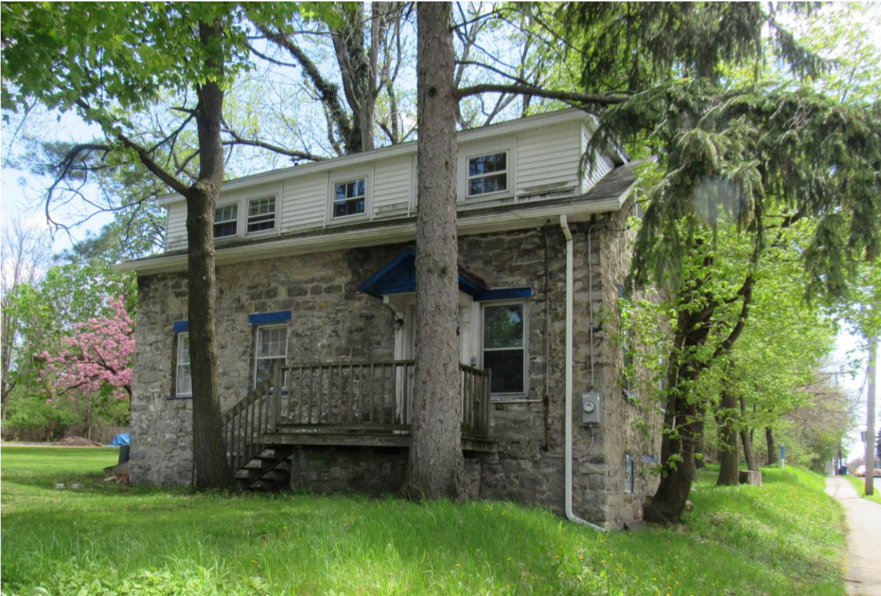
NY_Erie County_Town of Amherst_4625 Harlem Road_North and West Elevations

20. HISTORICAL AND ARCHITECTURAL IMPORTANCE: Remains unchanged.