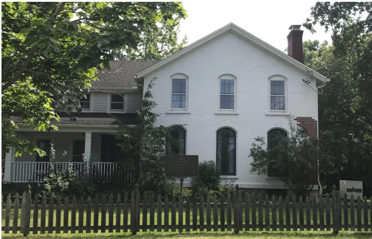
NY_Erie County_Town of Amherst_459 South Ellicott Creek Road_North Elevation