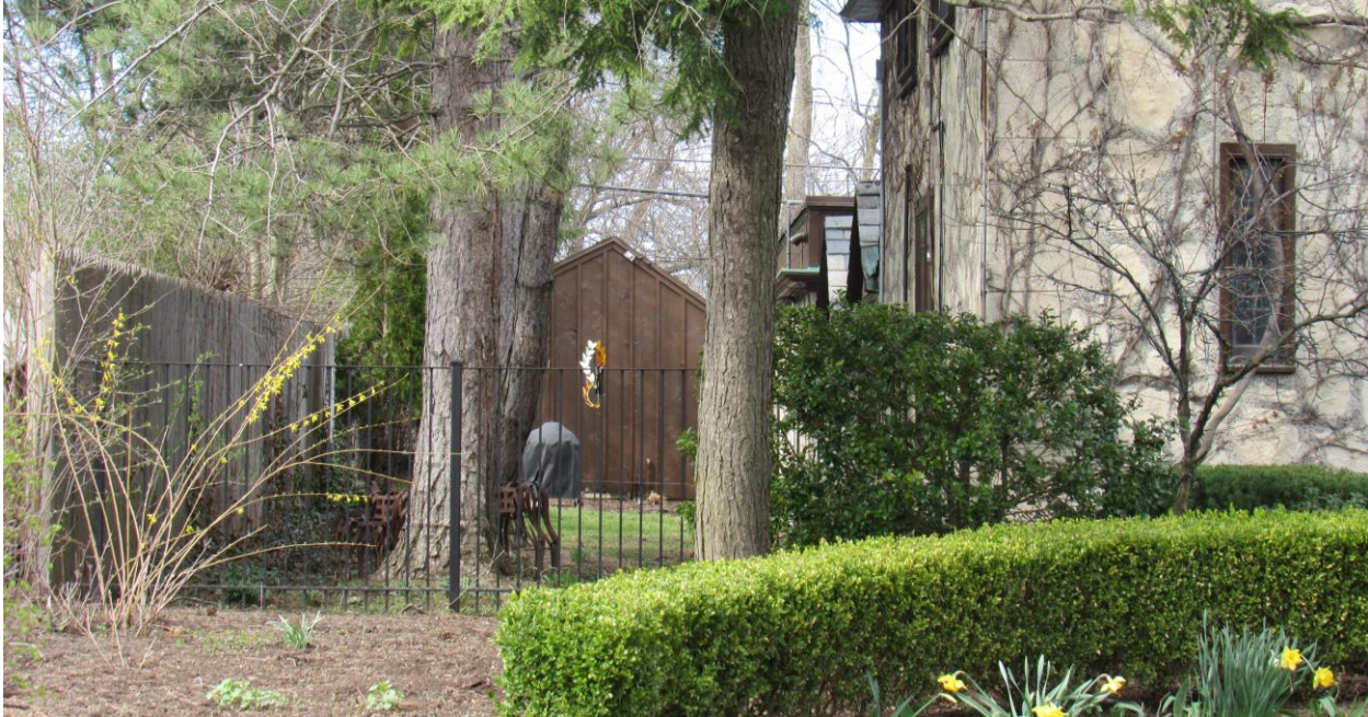
NY_Erie County_Town of Amherst_74 Keswick Road_Detached Shed