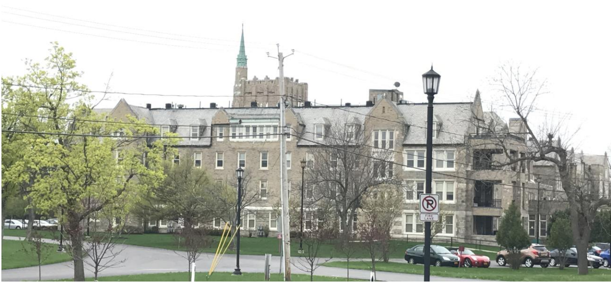
NY_Erie County_Town of Amherst_508 Mill Street_West Elevation