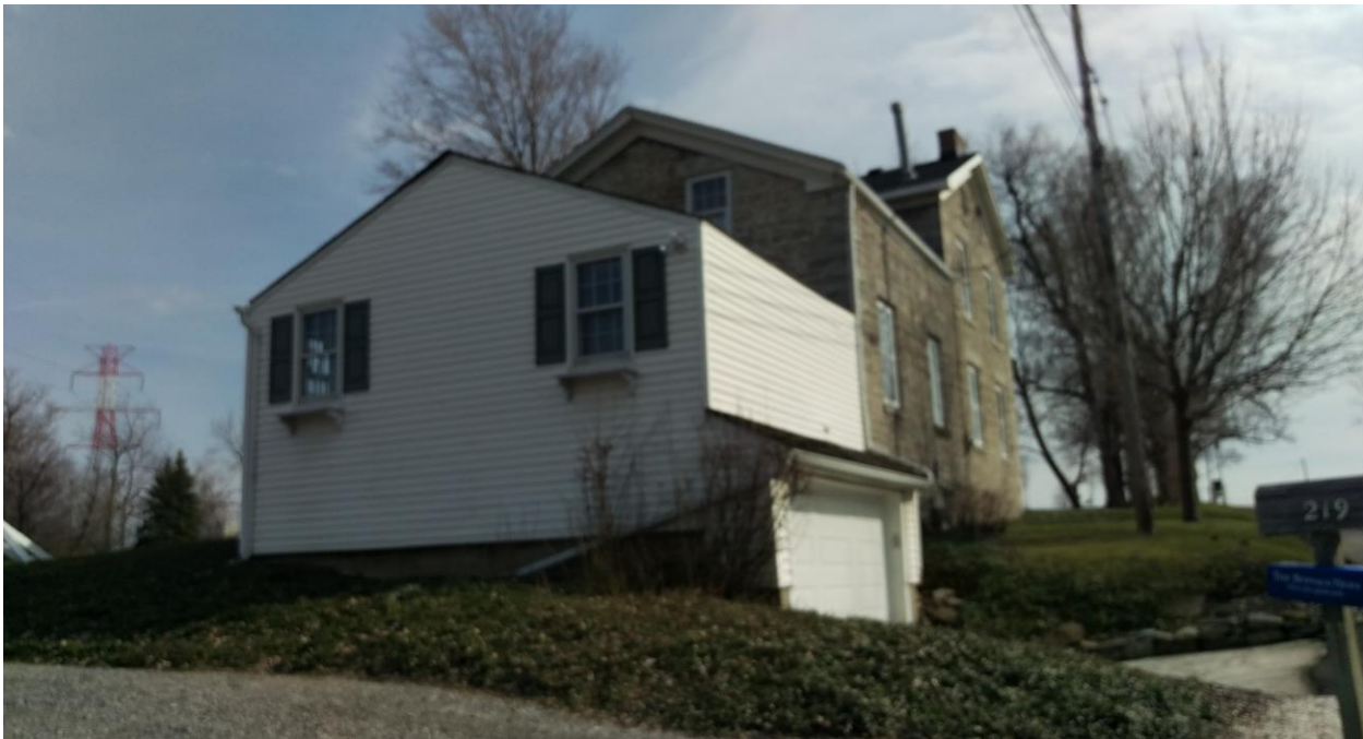
NY_Erie County_Town of Amherst_219 Park Club Lane_North and West Elevations