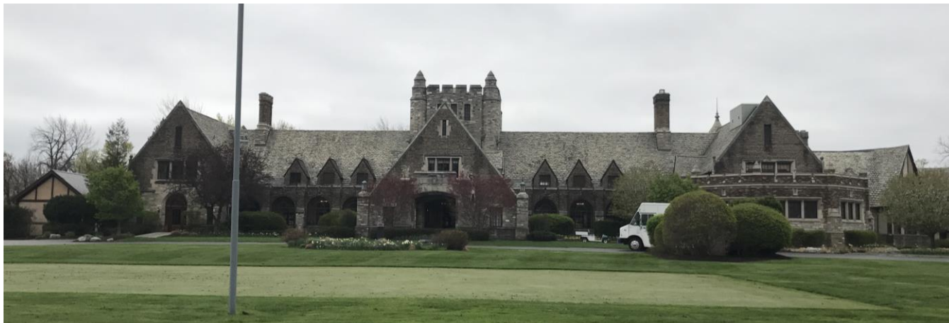
NY_Erie County_Town of Amherst_4949 Sheridan Drive_North Elevation

20. HISTORICAL AND ARCHITECTURAL IMPORTANCE: Remains unchanged.