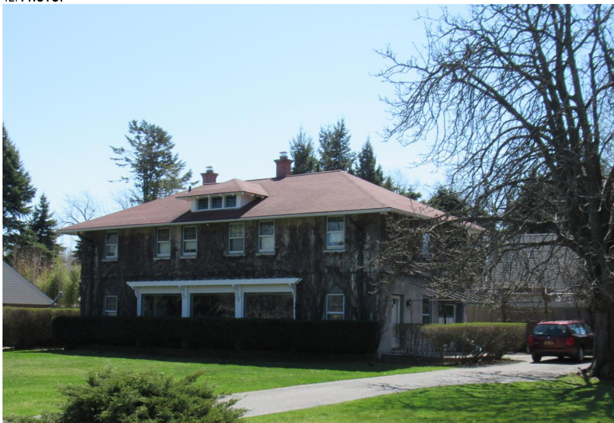
NY_Erie County_Town of Amherst_9 Cloister Court_North and West Elevation

20. HISTORICAL AND ARCHITECTURAL IMPORTANCE: Remains unchanged.