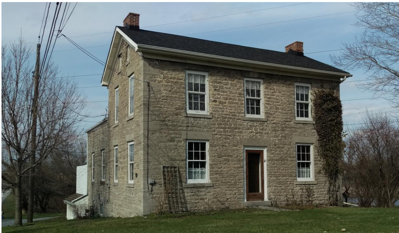
NY_Erie County_Town of Amherst_219 Park Club Lane_South and West Elevations

20. HISTORICAL AND ARCHITECTURAL IMPORTANCE: Remains Unchanged.