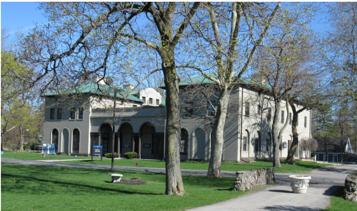
NY_Erie County_Town of Amherst_4380 Main Street_South and East Elevations

20. HISTORICAL AND ARCHITECTURAL IMPORTANCE: Remains Unchanged.