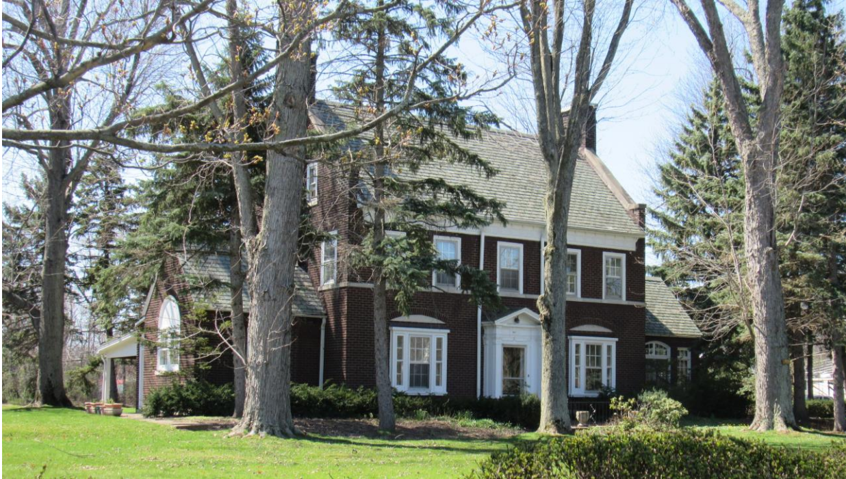
NY_Erie County_Town of Amherst_367 LeBrun Road_East and North Elevations