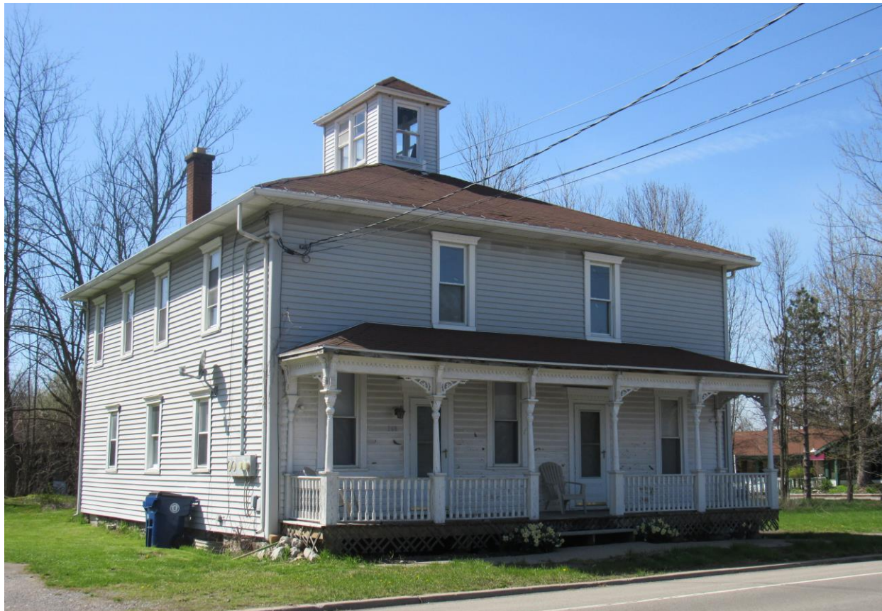
NY_Erie County_Town of Amherst_260 Campbell Boulevard_South and East Elevations