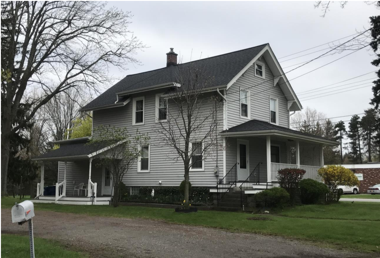
NY_Erie County_Town of Amherst_1990 Dodge Road_South and East Elevations