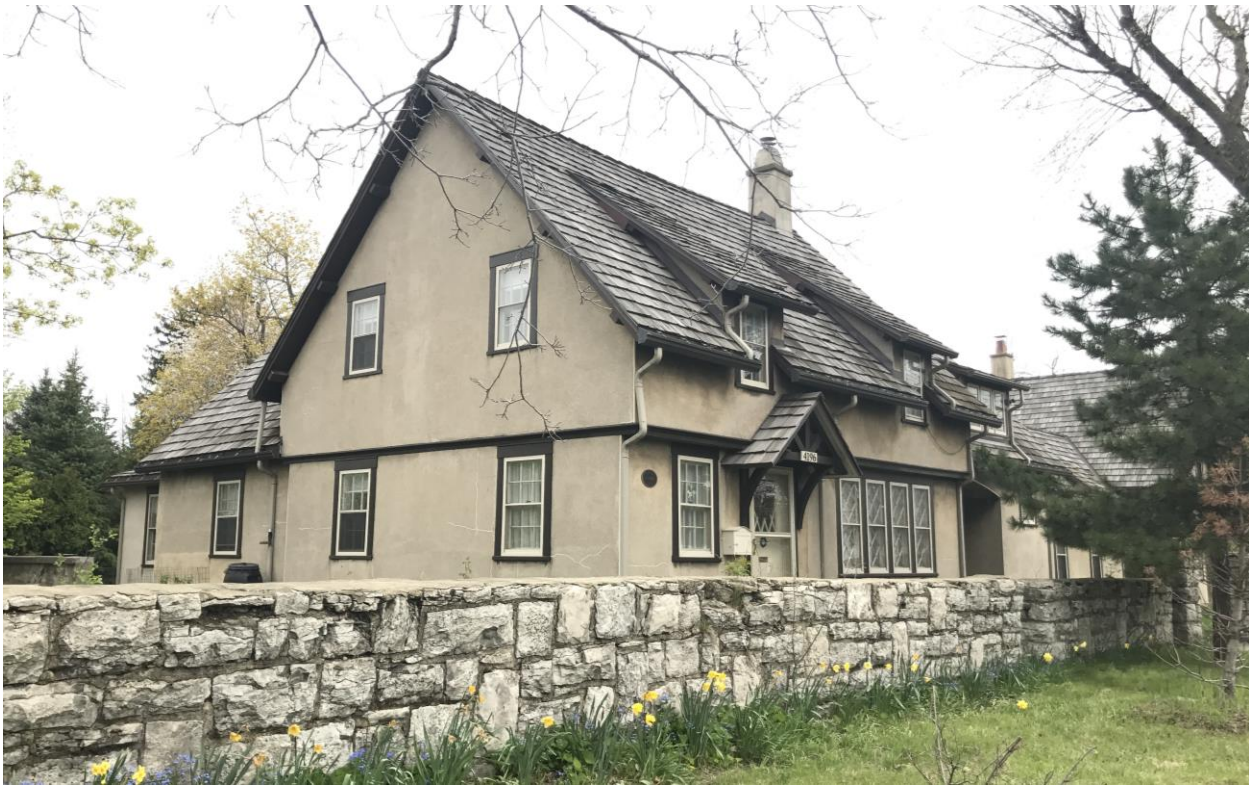
NY_Erie County_Town of Amherst_4230 Main Street_South and West Elevations