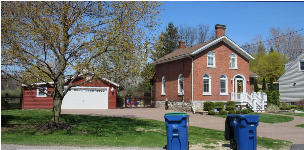
NY_Erie County_Town of Amherst_110 North Ellicott Creek Road_South and West Elevations