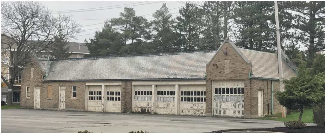
NY_Erie County_Town of Amherst_508 Mill Street_Garage_South and West Elevations