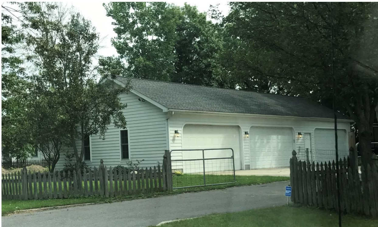
NY_Erie County_Town of Amherst_459 South Ellicott Creek Road_Detached Garage