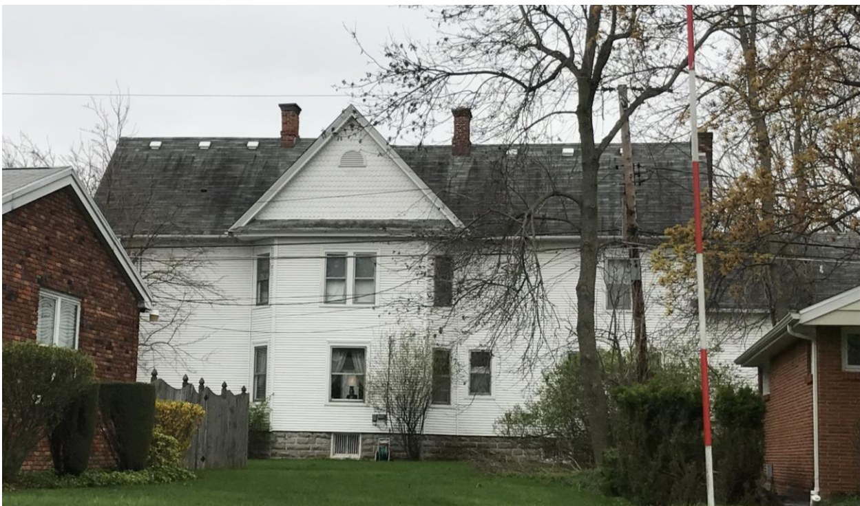
NY_Erie County_Town of Amherst_954 North Forest Road_North Elevation