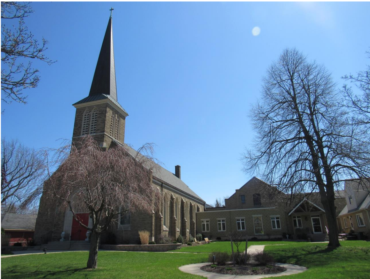
NY_Erie County_Town of Amherst_4001 Main Street_North and West Elevations

20. HISTORICAL AND ARCHITECTURAL IMPORTANCE: Remains Unchanged