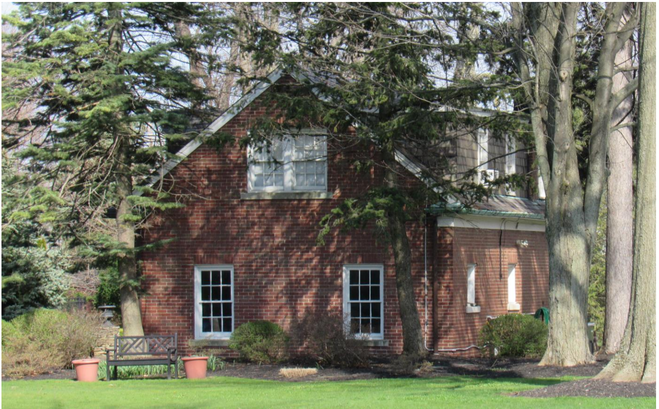
NY_Erie County_Town of Amherst_725 LeBrun Road_Detached Garage