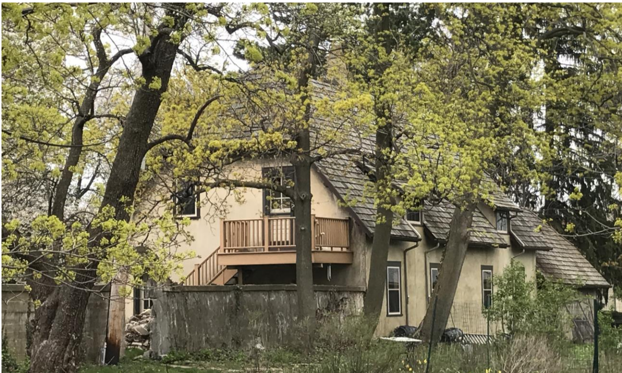
NY_Erie County_Town of Amherst_4230 Main Street_South and East Elevations