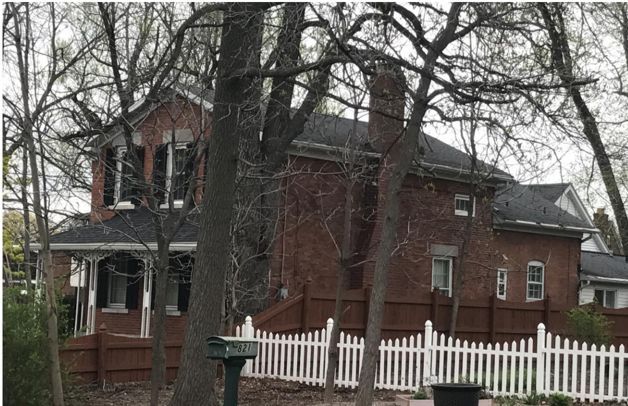
NY_Erie County_Town of Amherst_829 North Forest Road_South and West Elevations