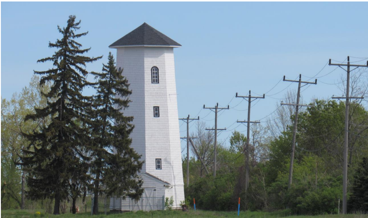
NY_Erie County_Town of Amherst_6380 Main Street_North Elevation

20. HISTORICAL AND ARCHITECTURAL IMPORTANCE: Remains Unchanged.