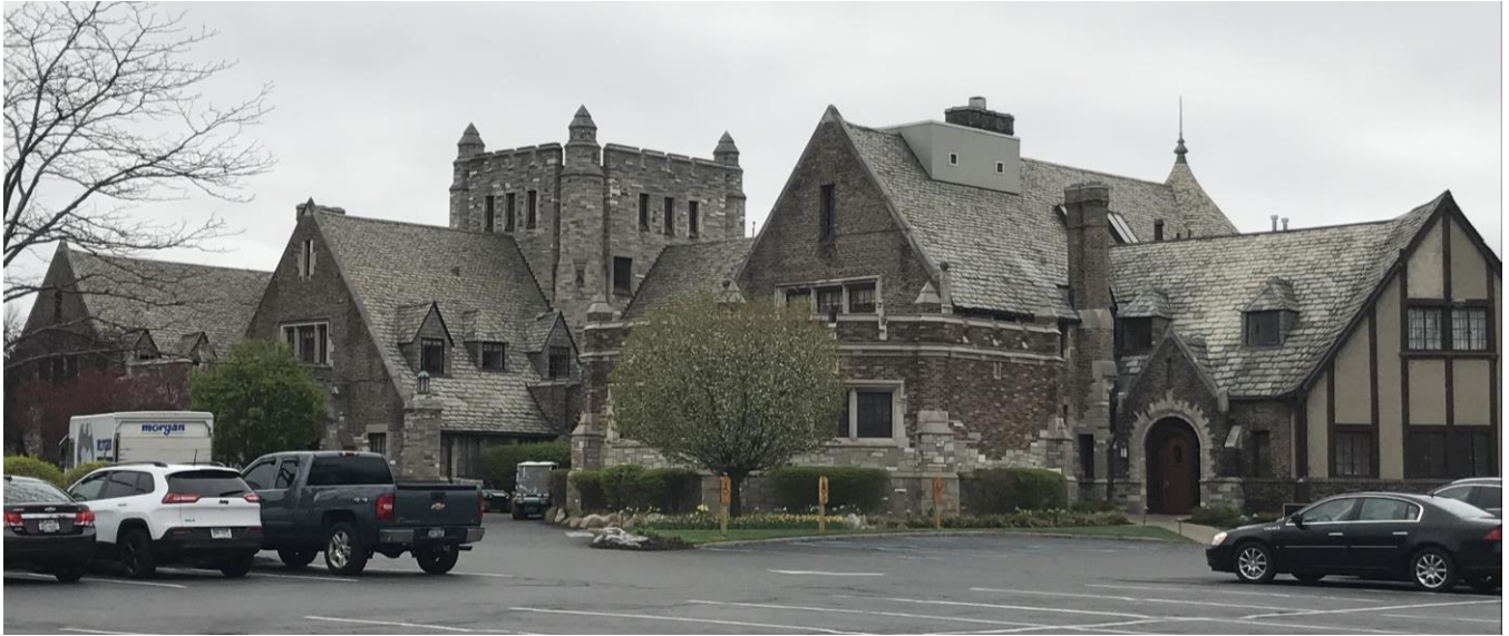
NY_Erie County_Town of Amherst_4949 Sheridan Drive_North and East Elevations