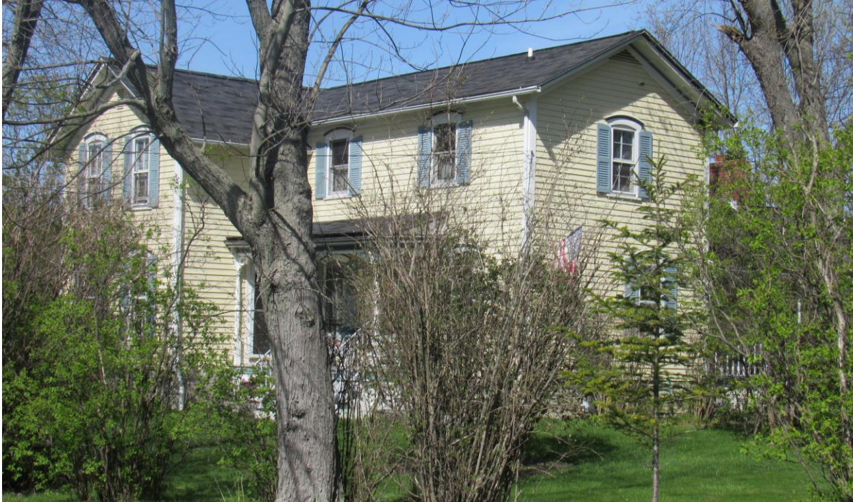
NY_Erie County_Town of Amherst_1025 New Road_South and West Elevations