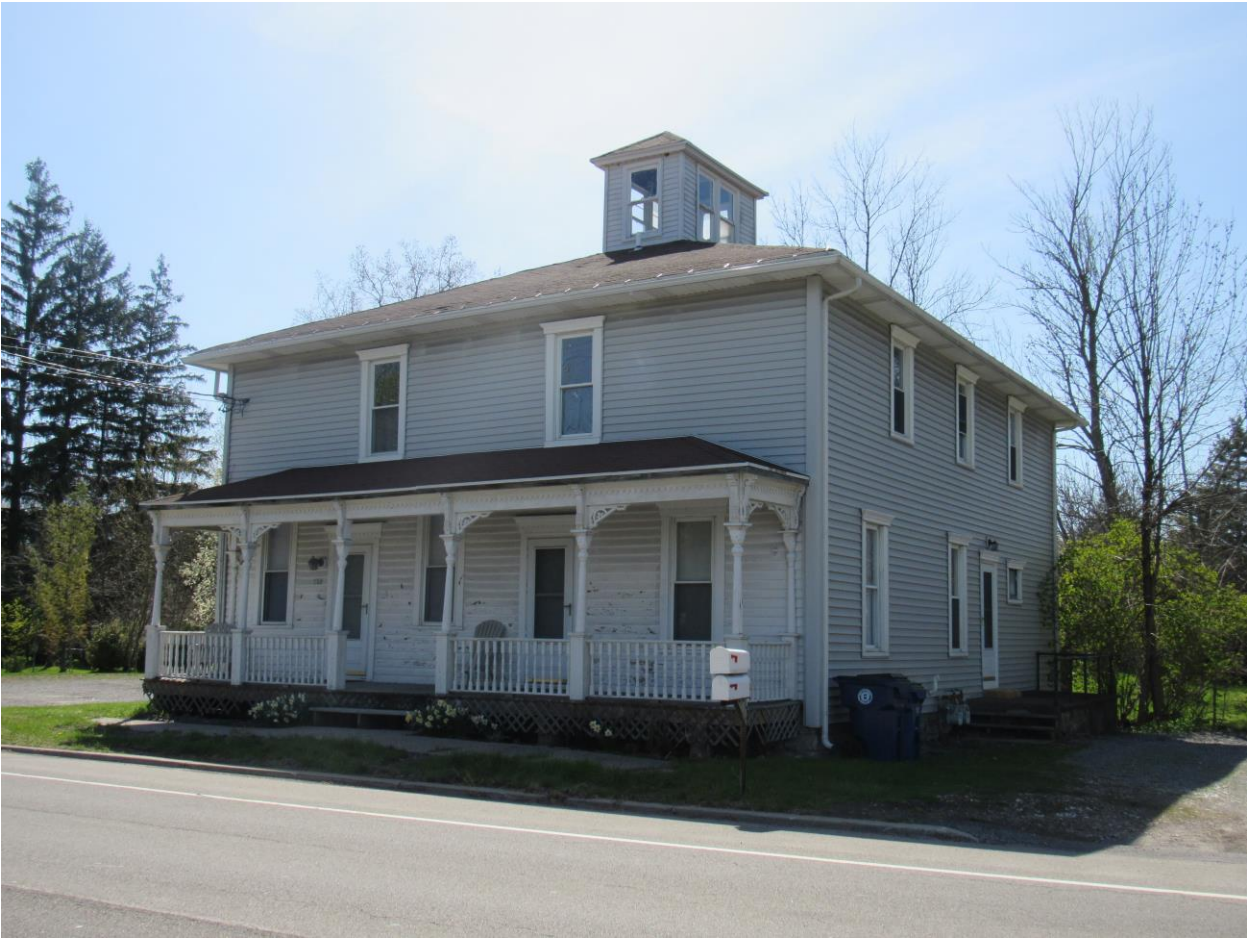
NY_Erie County_Town of Amherst_260 Campbell Boulevard_North and East Elevations

20. HISTORICAL AND ARCHITECTURAL IMPORTANCE: Still meets Local Landmark Criterion despite vinyl siding and removal of eave brackets.