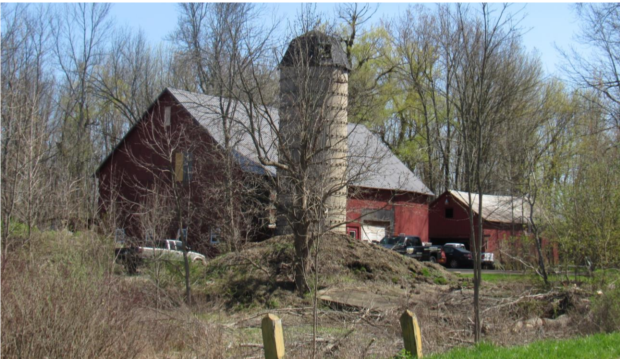
NY_Erie County_Town of Amherst_3049 Tonawanda Creek Road_North and East Elevations_Barn Complex