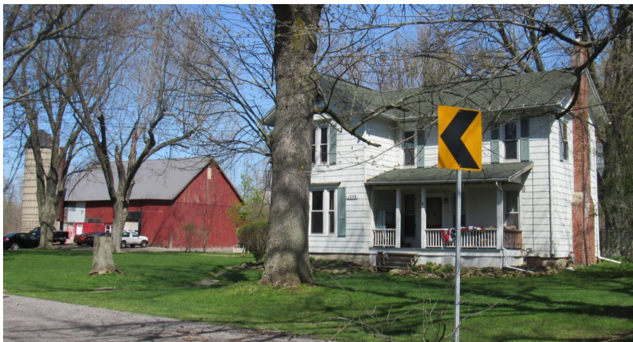
NY_Erie County_Town of Amherst_3049 Tonawanda Creek Road_North and West Elevations