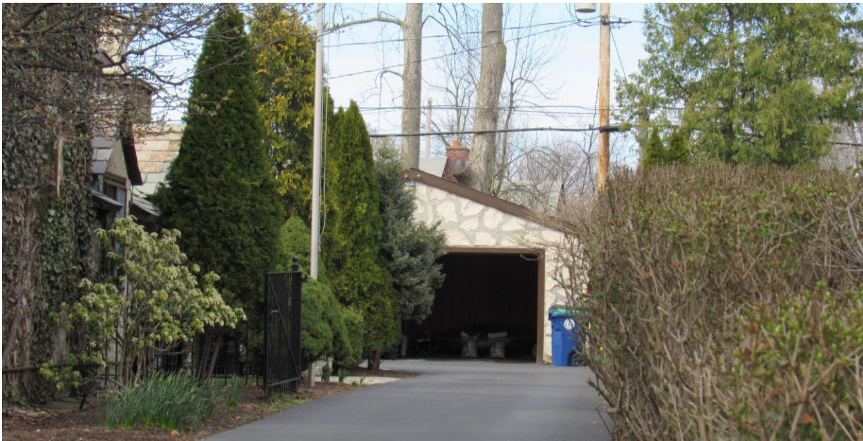
NY_Erie County_Town of Amherst_74 Keswick Road_Garage