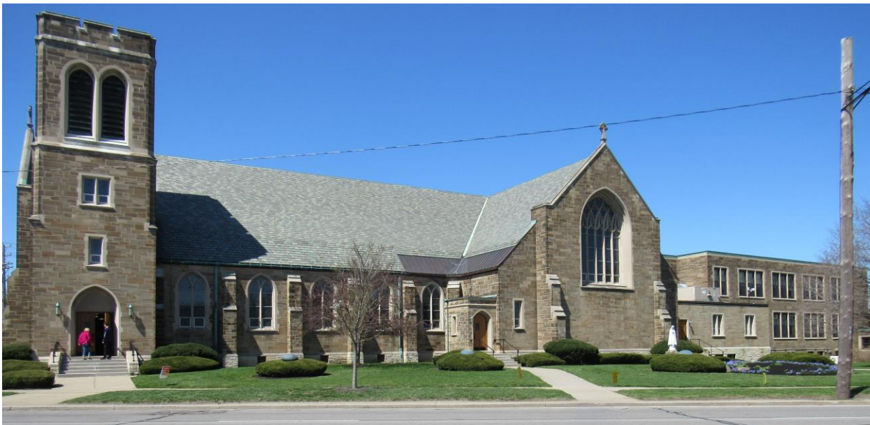
NY_Erie County_Town of Amherst_1317 Eggert Road_East Elevation