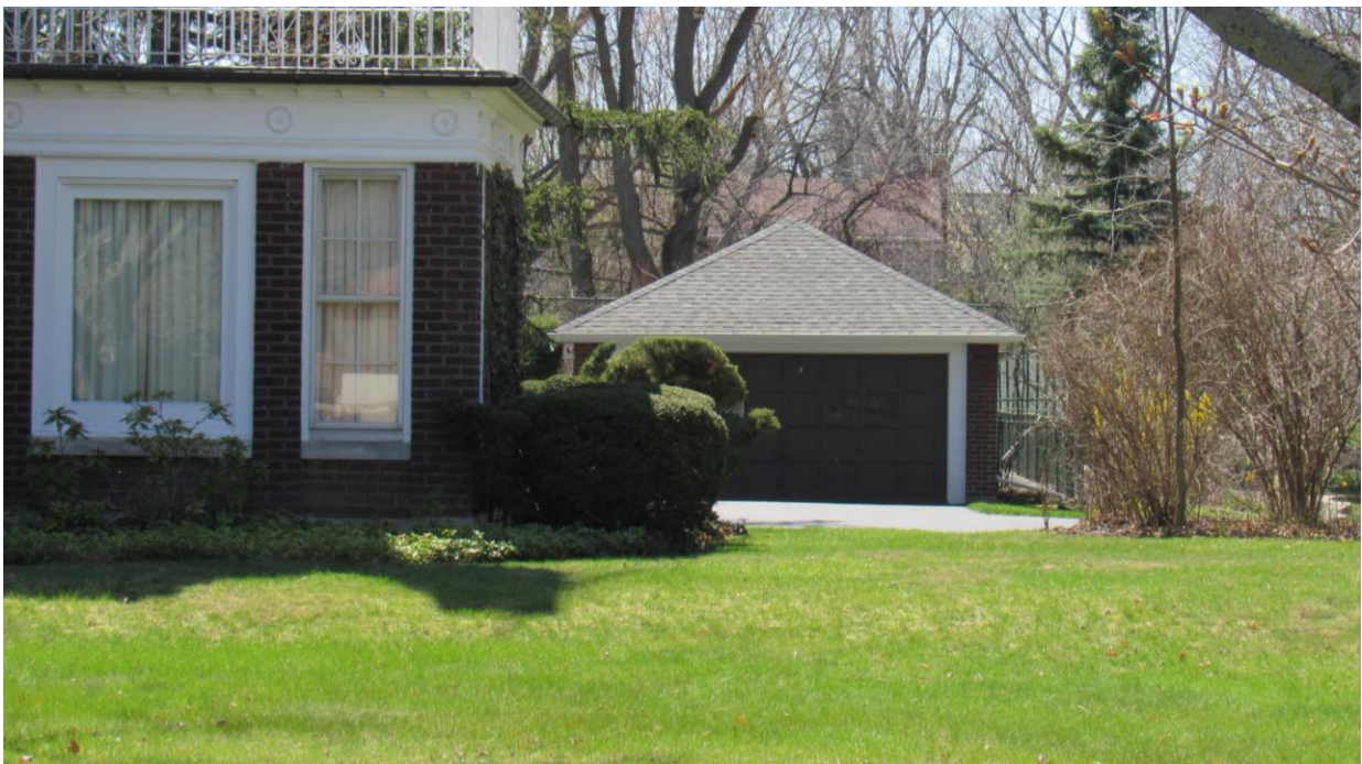
NY_Erie County_Town of Amherst_381 LeBrun Road_Detached Garage