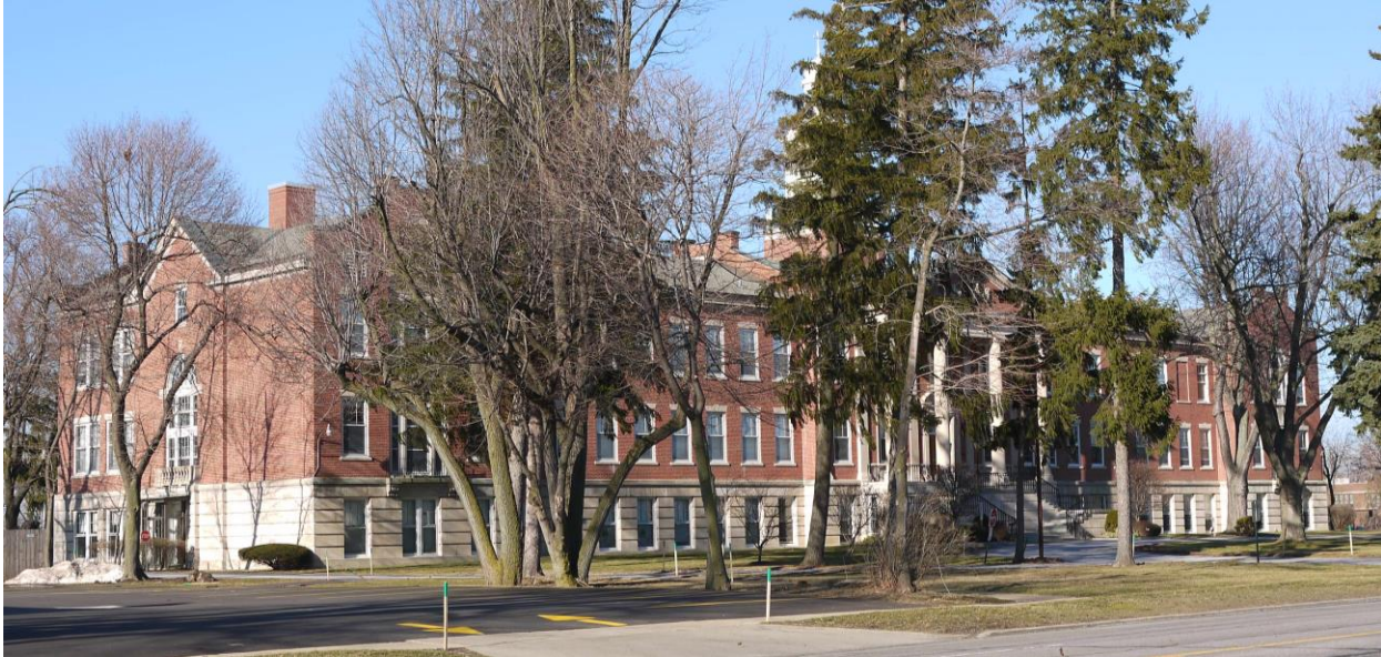
NY_Erie County_Town of Amherst_3860 Main Street_South and West Elevations