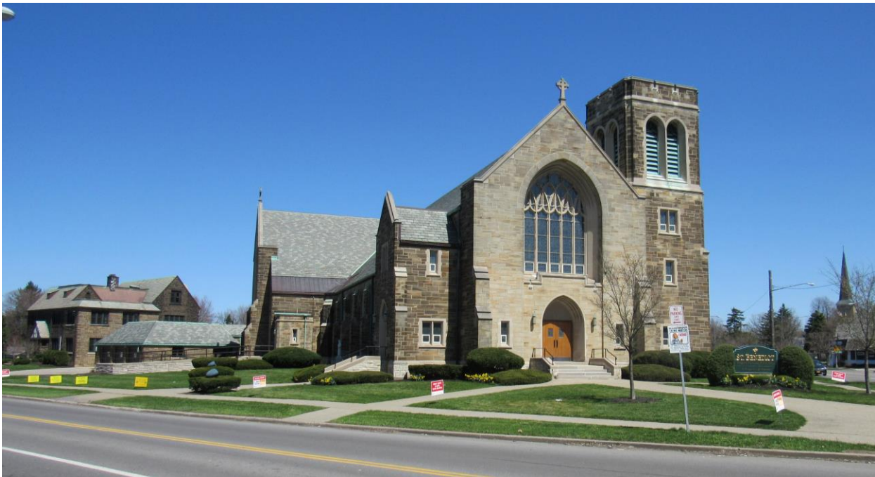
NY_Erie County_Town of Amherst_1317 Eggert Road_South and West Elevations