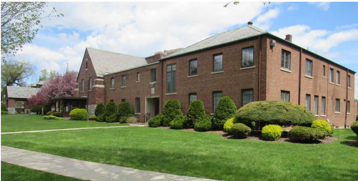
NY_Erie County_Town of Amherst_30 Lamarck Drive_South and West Elevations