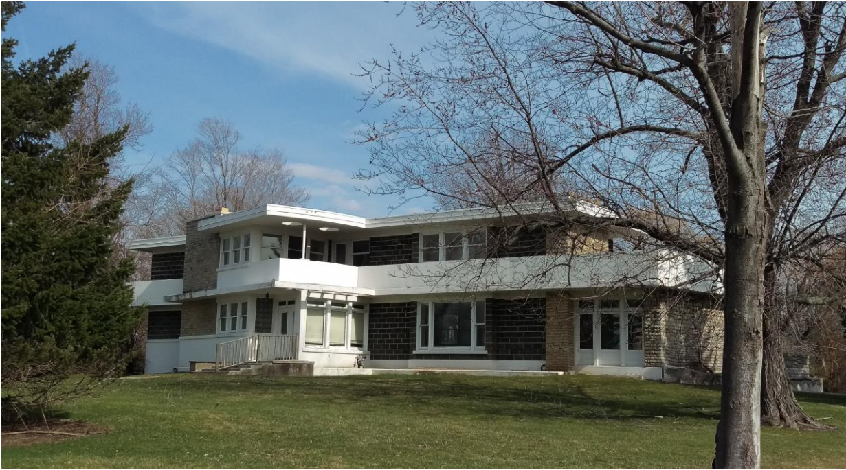
NY_Erie County_Town of Amherst_895 North Forest Road_South and West Elevations