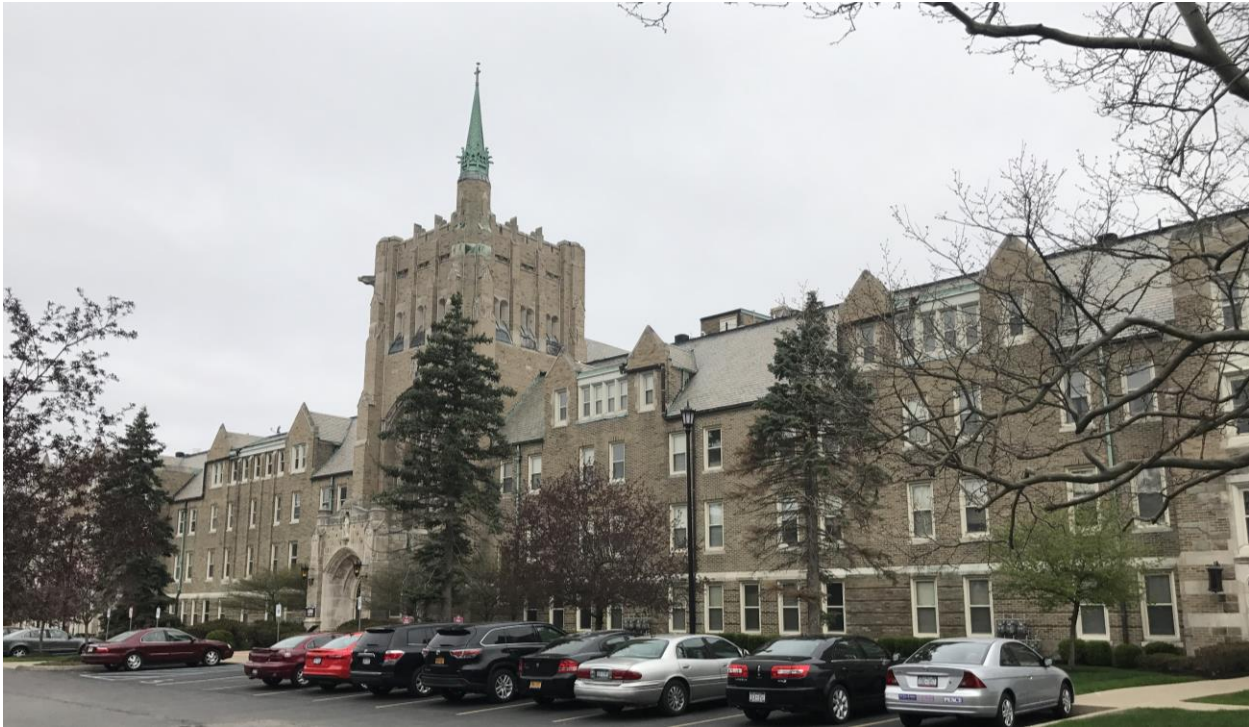
NY_Erie County_Town of Amherst_508 Mill Street_South and East Elevations