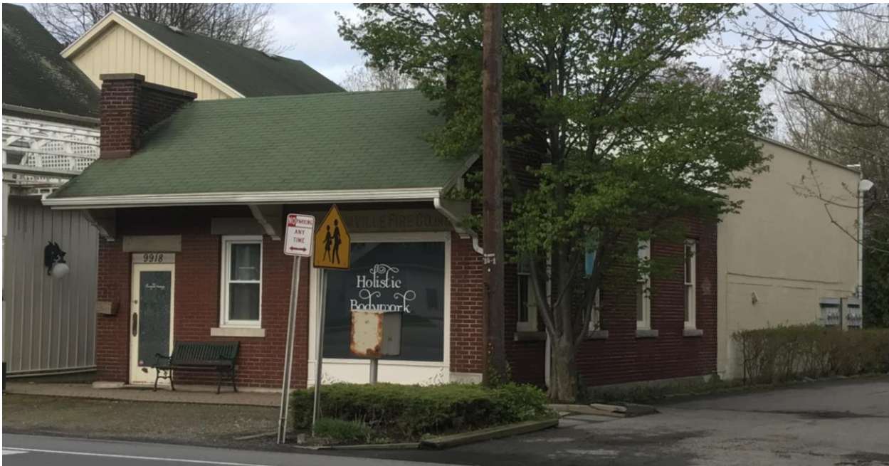
NY_Erie County_Town of Amherst_9918 Transit Road_North and East Elevations