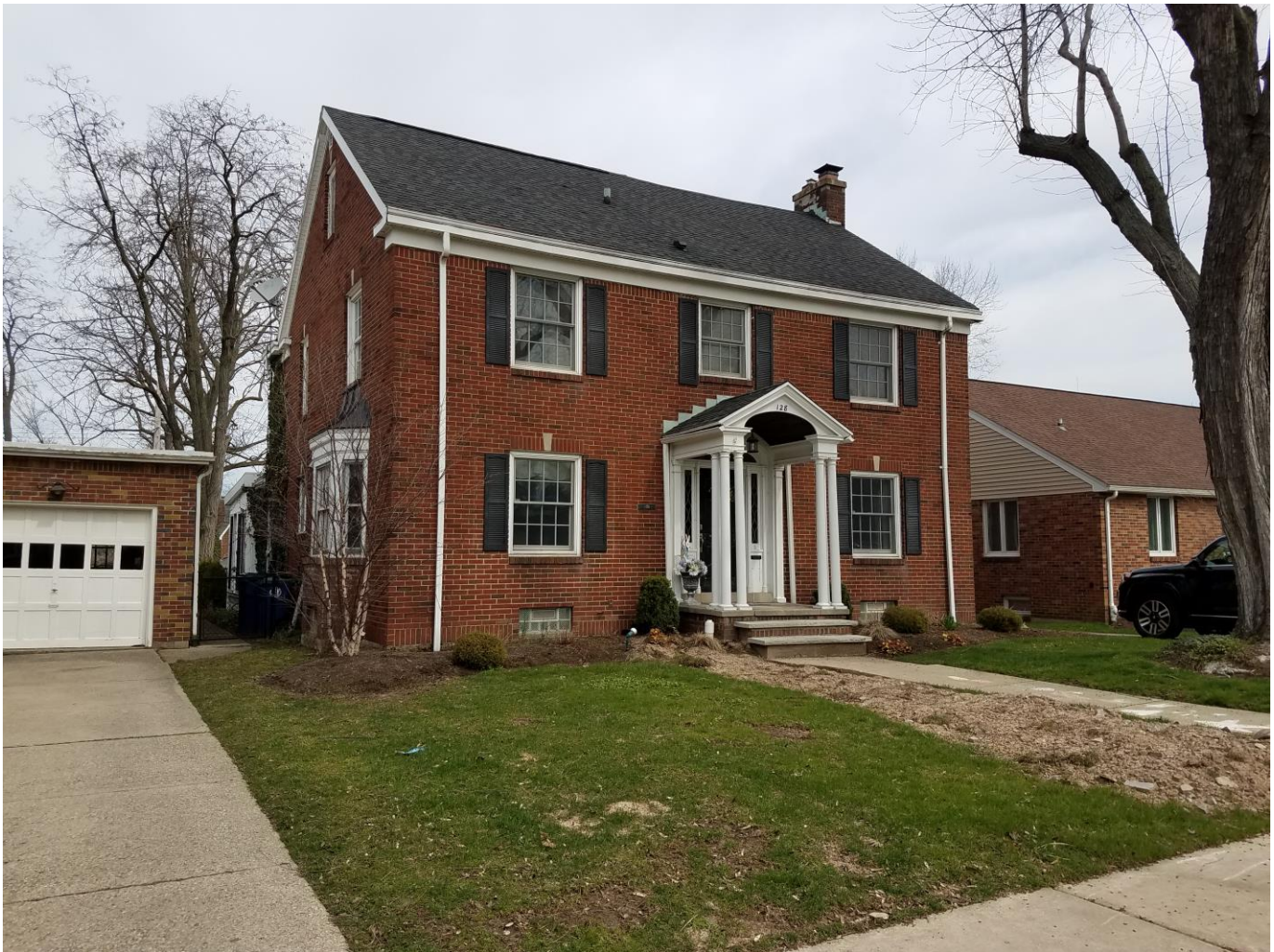
NY_Erie County_Town of Amherst_128 Crosby Boulevard_South and West Elevations

20. HISTORICAL AND ARCHITECTURAL IMPORTANCE: Remains unchanged.