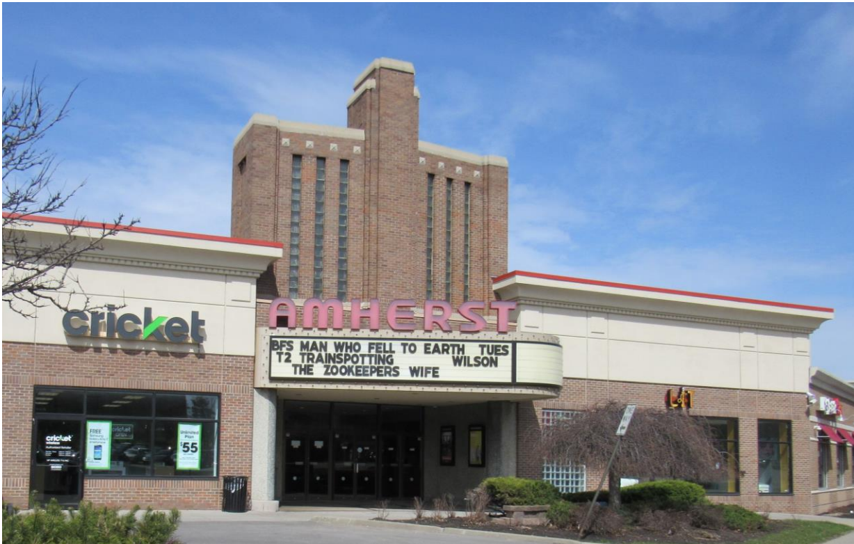
NY_Erie County_Town of Amherst_3500 Main Street_South Elevation

20. HISTORICAL AND ARCHITECTURAL IMPORTANCE: Theater portion itself still meets local landmarking criterion despite alterations.