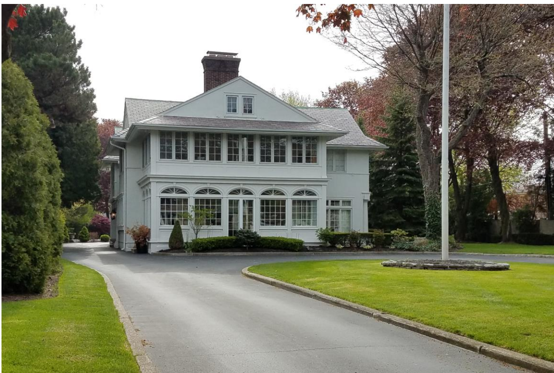
NY_Erie County_ Town of Amherst _23 Four Seasons Rd West_ West and North Elevations

20. HISTORICAL AND ARCHITECTURAL IMPORTANCE: Remains unchanged.