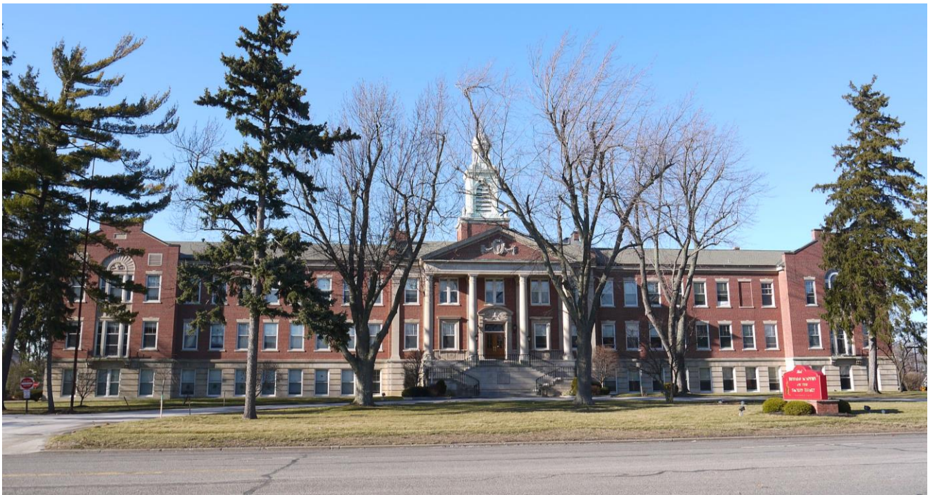
NY_Erie County_Town of Amherst_3860 Main Street_South Elevation

20. HISTORICAL AND ARCHITECTURAL IMPORTANCE: Remains unchanged.