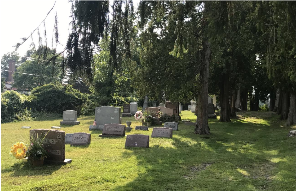
NY_Erie County_ Town of Amherst _8950 Transit_View West