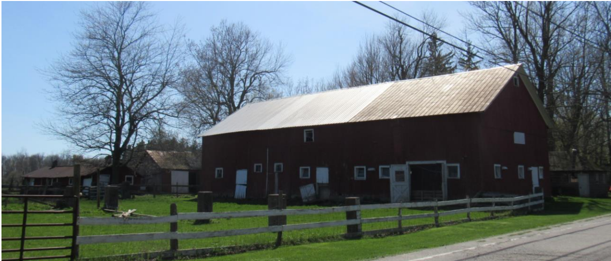
NY_Erie County_Town of Amherst_405 Schoelles Road_North and East Elevations_Outbuilding East of House