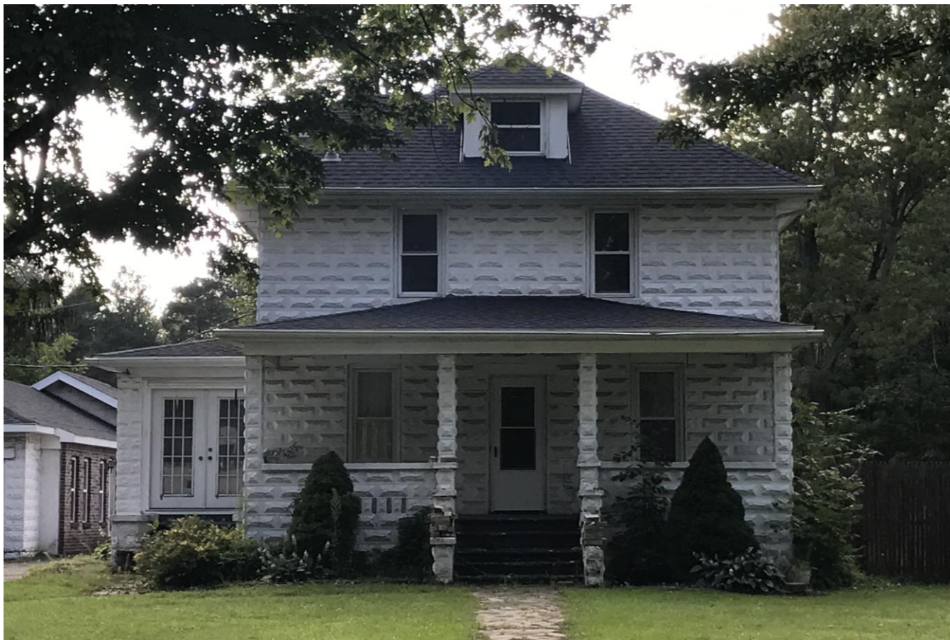
NY_Erie County_Town of Amherst_9980 Transit Road_View West

20. HISTORICAL AND ARCHITECTURAL IMPORTANCE: Remains Unchanged.