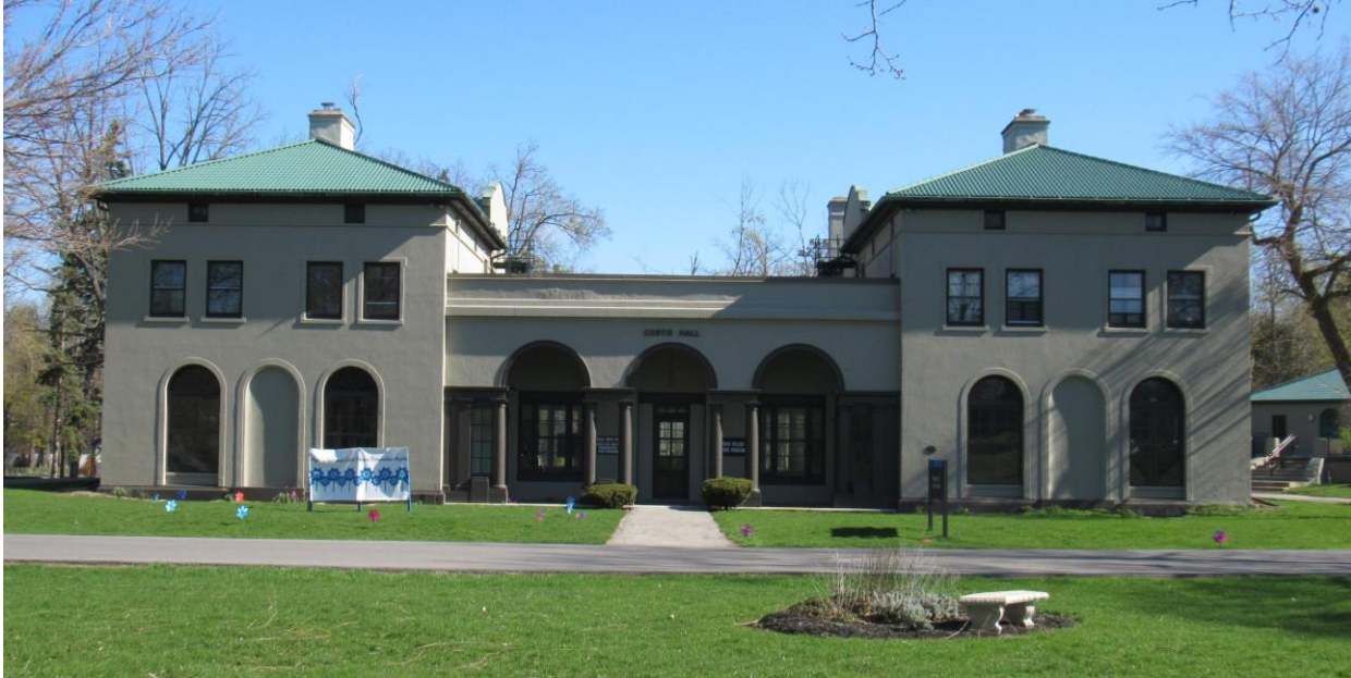
NY_Erie County_Town of Amherst_4380 Main Street_South Elevation