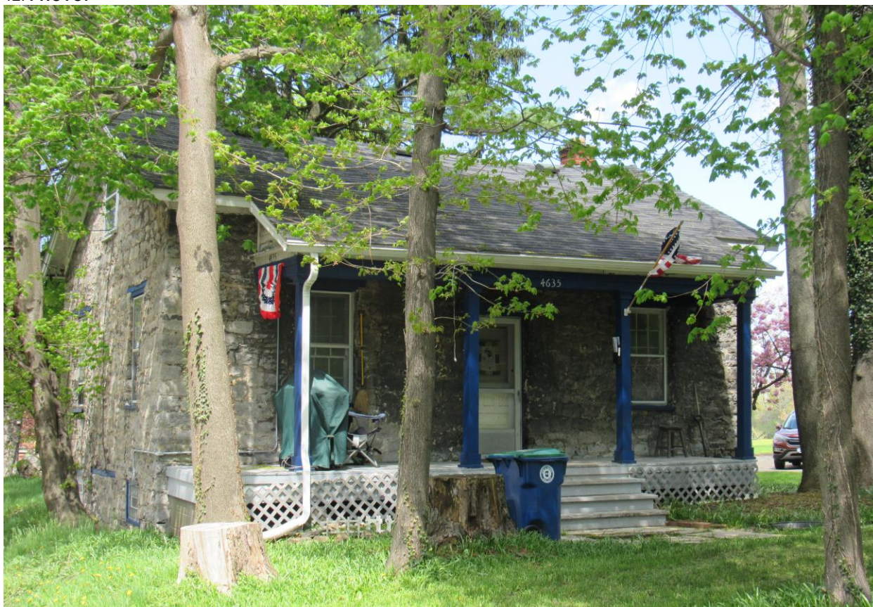
NY_Erie County_Town of Amherst_4625 Harlem Road_South and West Elevations