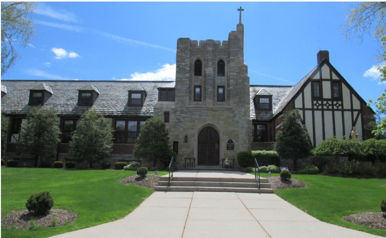
NY_Erie County_Town of Amherst_30 Lamarck Drive_North Elevation

20. HISTORICAL AND ARCHITECTURAL IMPORTANCE: Remains Unchanged