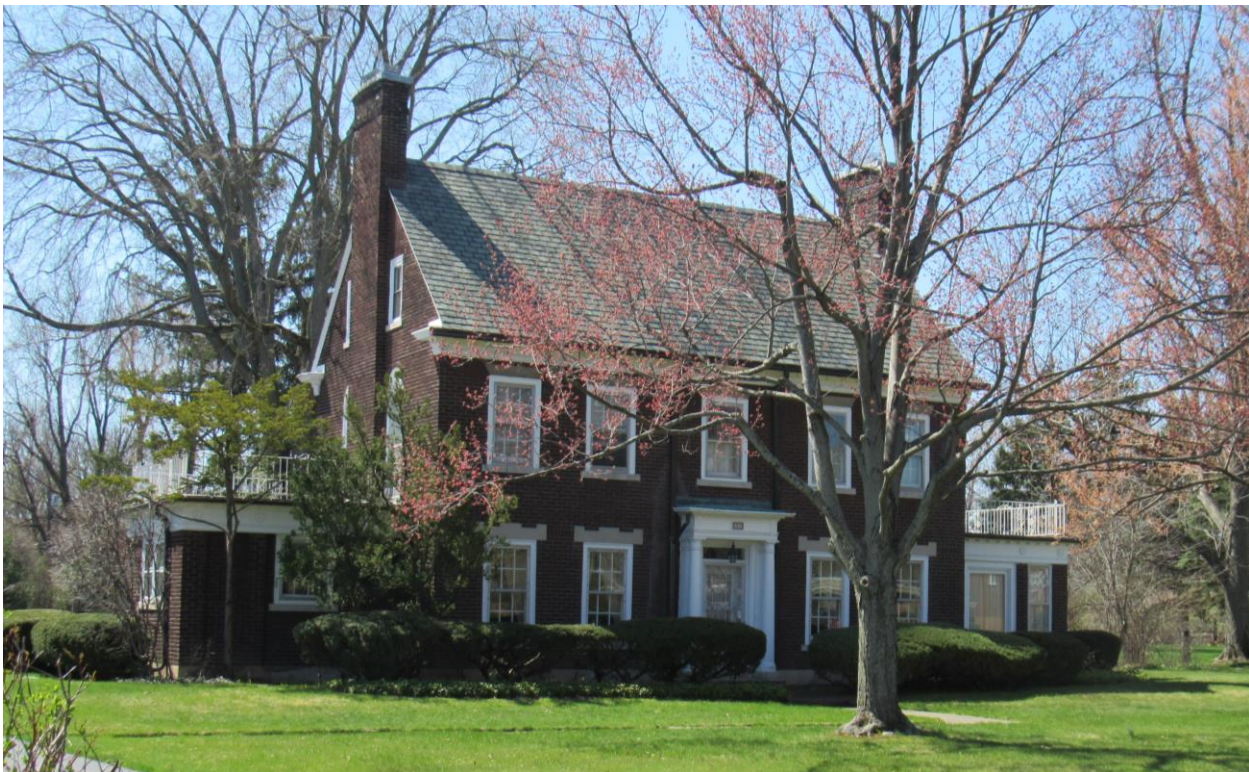
NY_Erie County_Town of Amherst_381 LeBrun Road_North and East Elevation

20. HISTORICAL AND ARCHITECTURAL IMPORTANCE: Remains unchanged