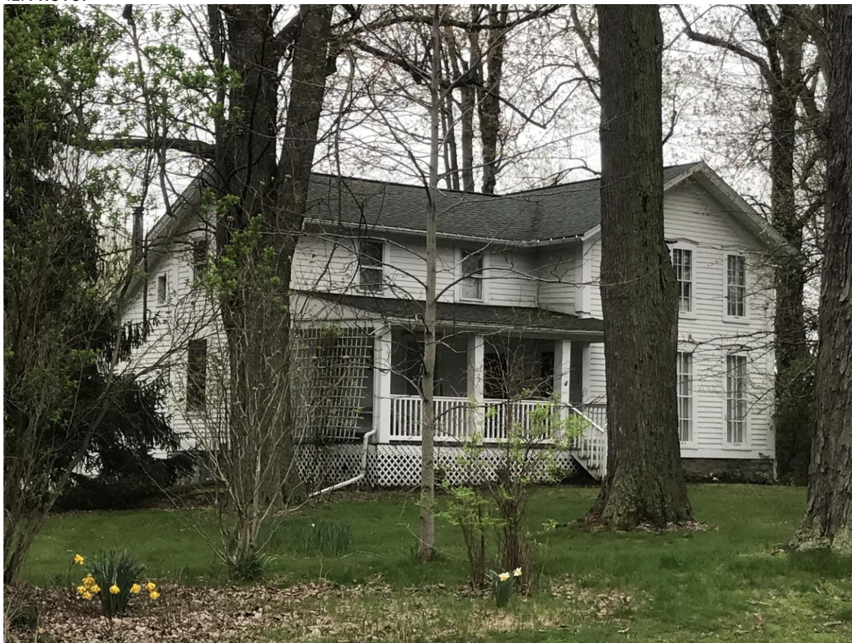
NY_Erie County_Town of Amherst_1645 Dodge Road_North and East Elevations