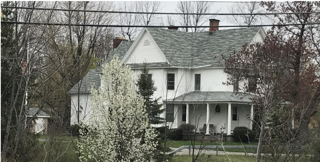
NY_Erie County_Town of Amherst_954 North Forest Road_South and East Elevations