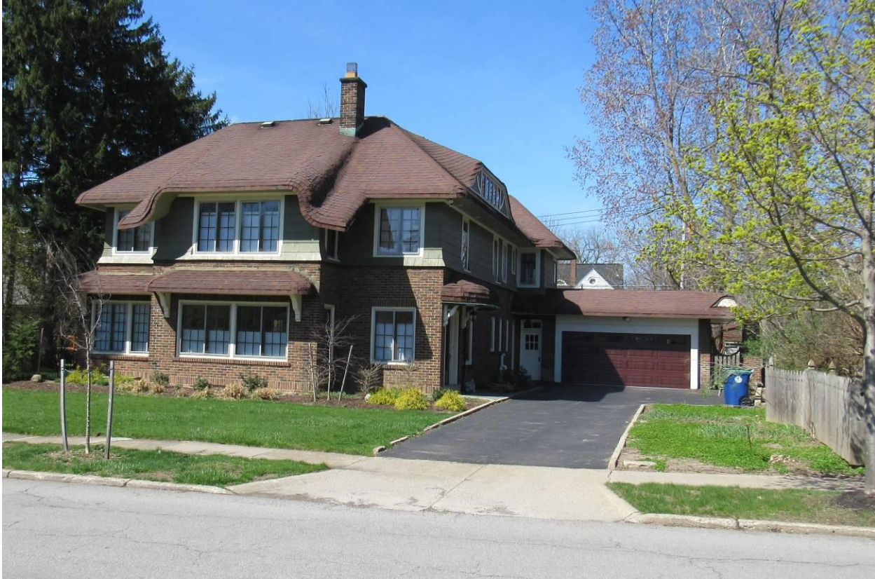
NY_Erie County_ Town of Amherst _5 Berryman Drive_ West and North Elevations