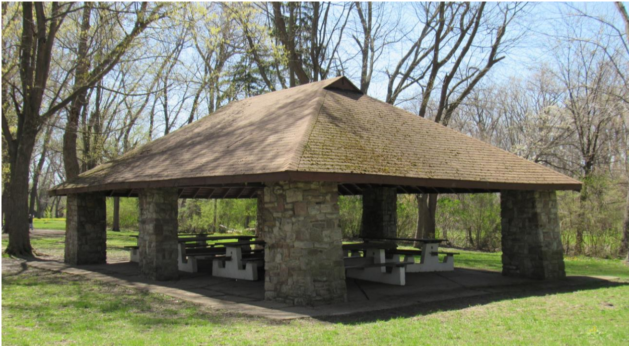
NY_Erie County_Town of Amherst_10 Creekside Drive_Shelter I-34