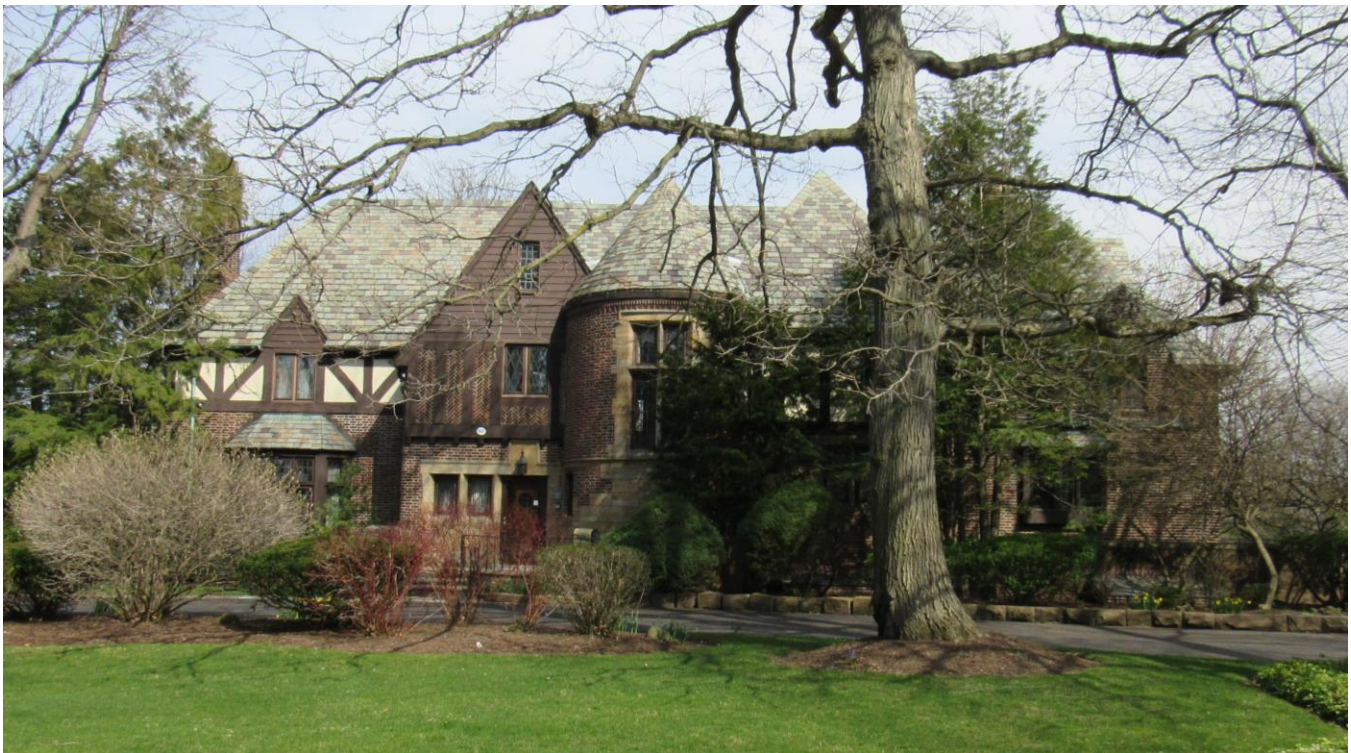
NY_Erie County_Town of Amherst_845 LeBrun Road_West Elevation

20. HISTORICAL AND ARCHITECTURAL IMPORTANCE: Remains Unchanged.