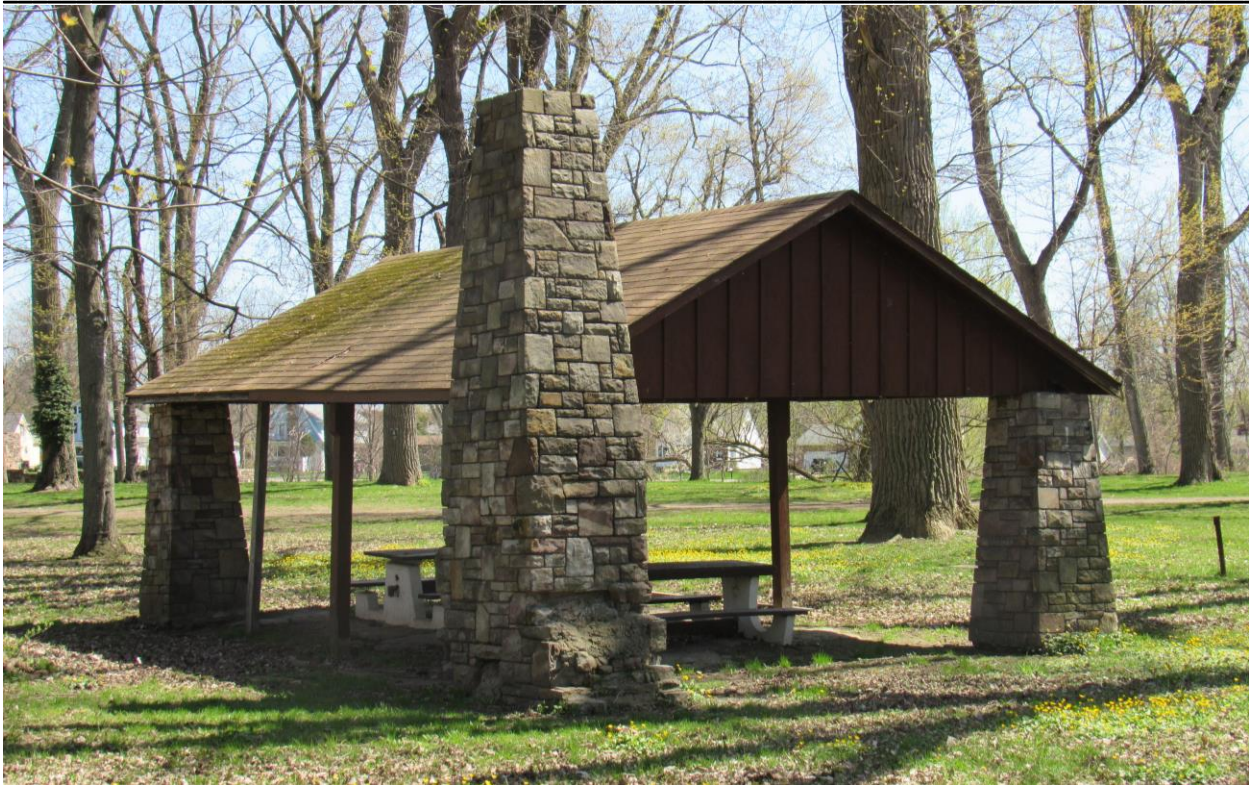
NY_Erie County_Town of Amherst_10 Creekside Drive_I-33