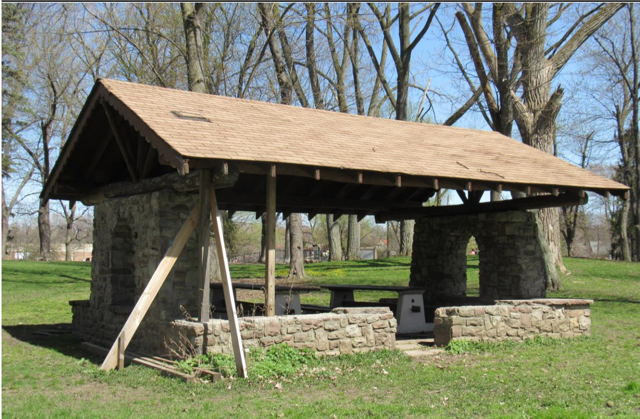
NY_Erie County_Town of Amherst_10 Creekside Drive_Shelter I-28