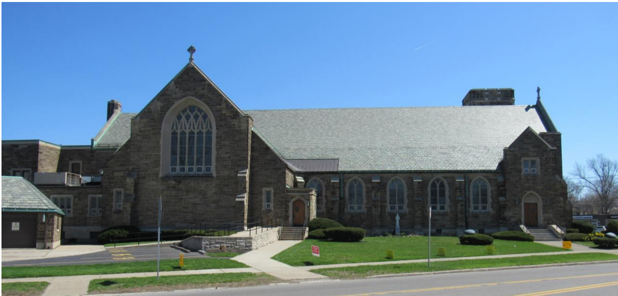
NY_Erie County_Town of Amherst_1317 Eggert Road_West Elevation