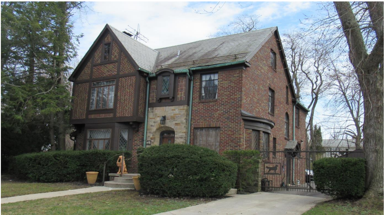
NY_Erie County_Town of Amherst_91 Crosby Boulevard_North and West Elevations