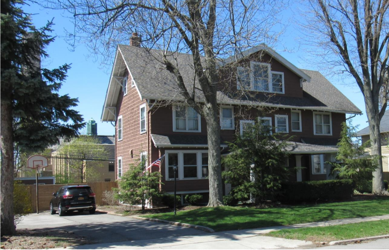
NY_Erie County_Town of Amherst_33 Washington Highway_South and East Elevations