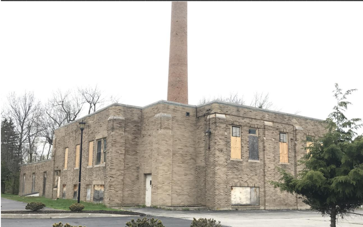
NY_Erie County_Town of Amherst_508 Mill Street_Boiler House_South and East Elevations