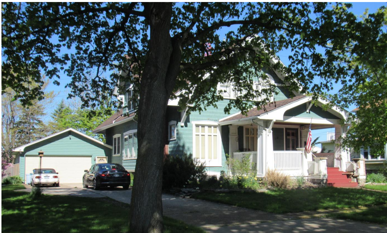
NY_Erie County_Town of Amherst_89 Royal Parkway_South and East Elevations

20. HISTORICAL AND ARCHITECTURAL IMPORTANCE: Remains Unchanged