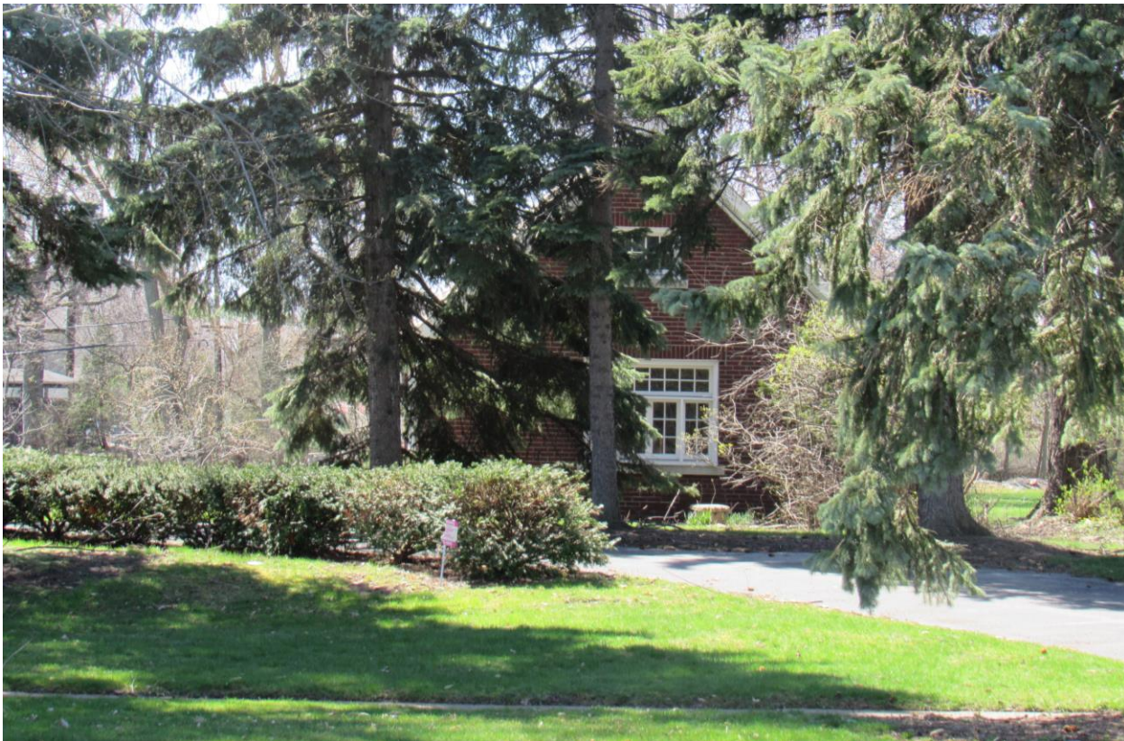
NY_Erie County_Town of Amherst_367 LeBrun Road_Detached Garage