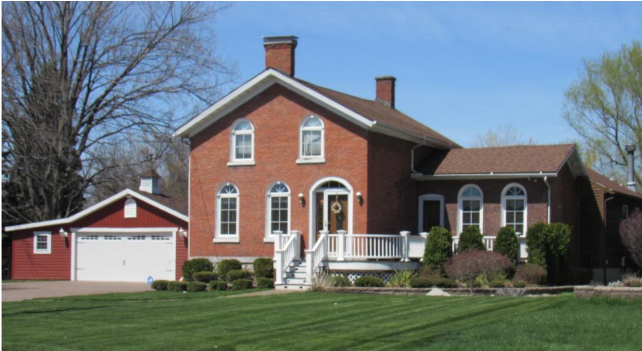
NY_Erie County_Town of Amherst_110 North Ellicott Creek Road_South and East Elevations