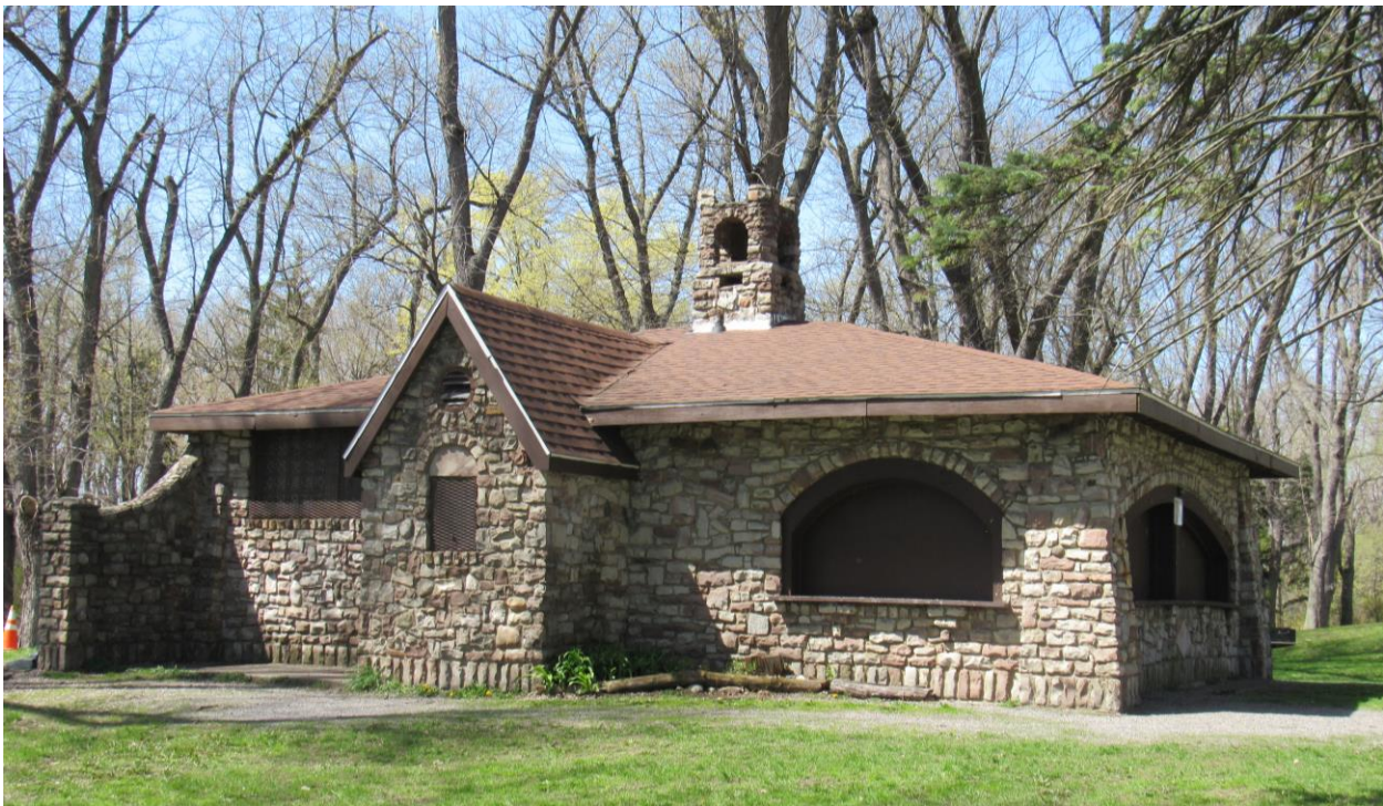
NY_Erie County_Town of Amherst_10 Creekside Drive_Casino (Concession Stand)