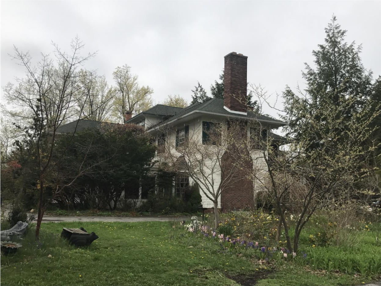
NY_Erie County_Town of Amherst_305 Brompton Road_North and East Elevations

20. HISTORICAL AND ARCHITECTURAL IMPORTANCE: Remains unchanged.