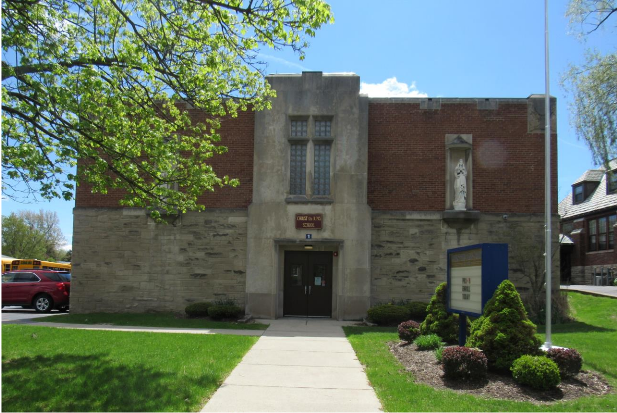
NY_Erie County_Town of Amherst_30 Lamarck Drive_School_North Elevation