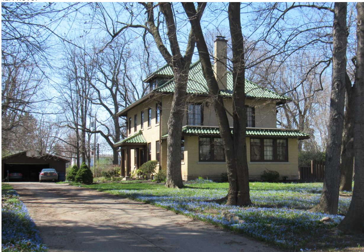
NY_Erie County_Town of Amherst_32 Ivyhurst Road_South and East Elevations