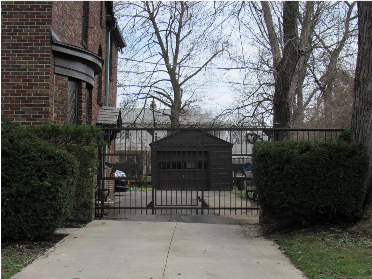
NY_Erie County_Town of Amherst_91 Crosby Boulevard_Detached Garage

20. HISTORICAL AND ARCHITECTURAL IMPORTANCE: Remains unchanged.