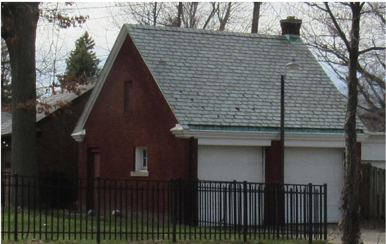
NY_Erie County_Town of Amherst_48 Park Circle_Detached Garage