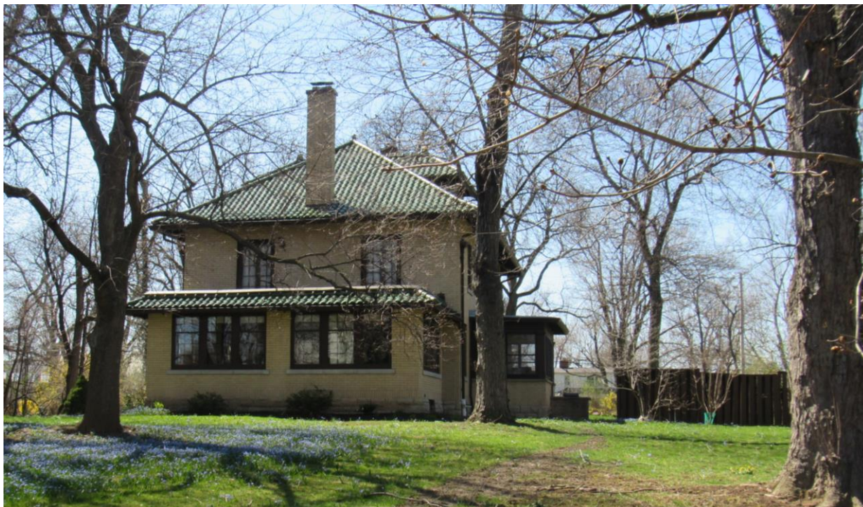
NY_Erie County_Town of Amherst_32 Ivyhurst Road_North and East Elevations