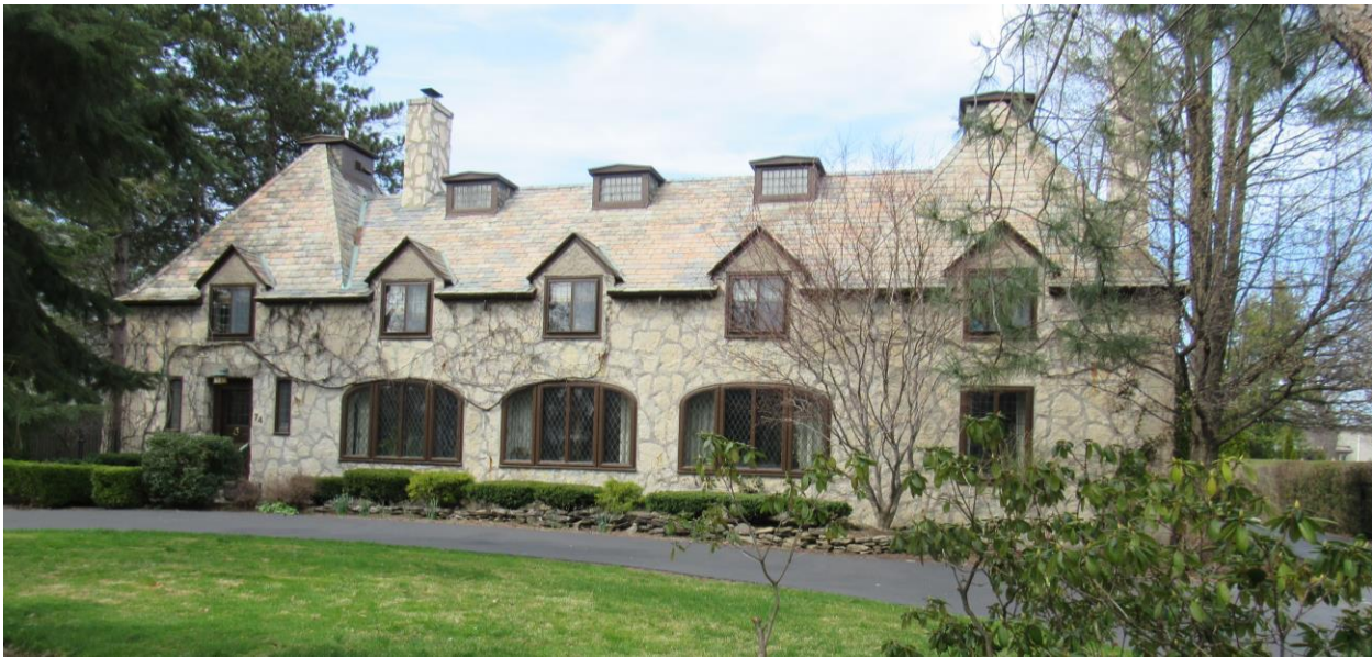
NY_Erie County_Town of Amherst_74 Keswick Road_South Elevation