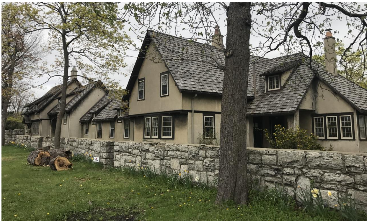
NY_Erie County_Town of Amherst_4230 Main Street_South and East Elevations

20. HISTORICAL AND ARCHITECTURAL IMPORTANCE: Remains unchanged.