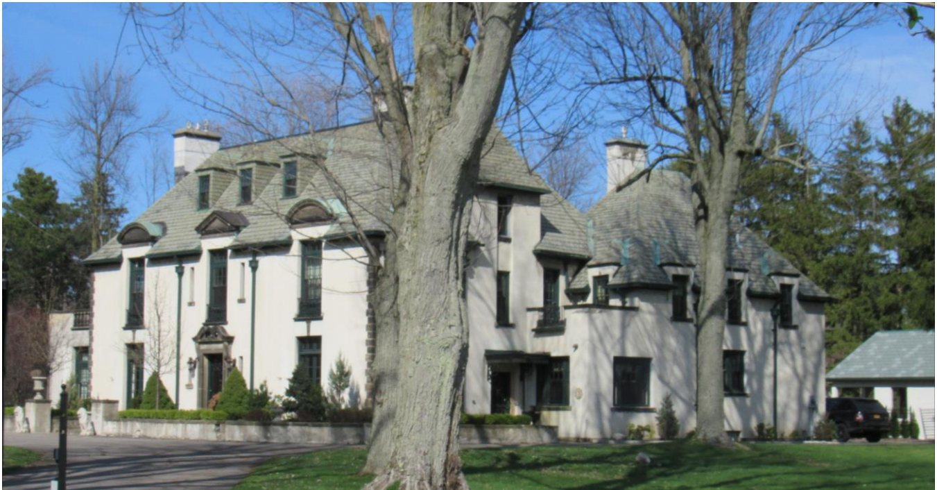
NY_Erie County_Town of Amherst_697 LeBrun Road_West and South Elevation

20. HISTORICAL AND ARCHITECTURAL IMPORTANCE: Remains Unchanged