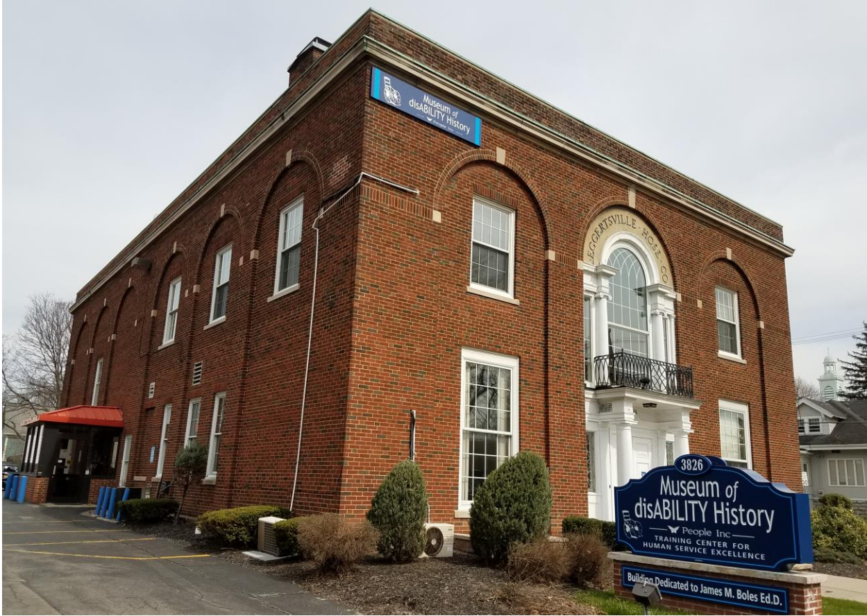
NY_Erie County_Town of Amherst_3826 Main Street_South and West Elevations