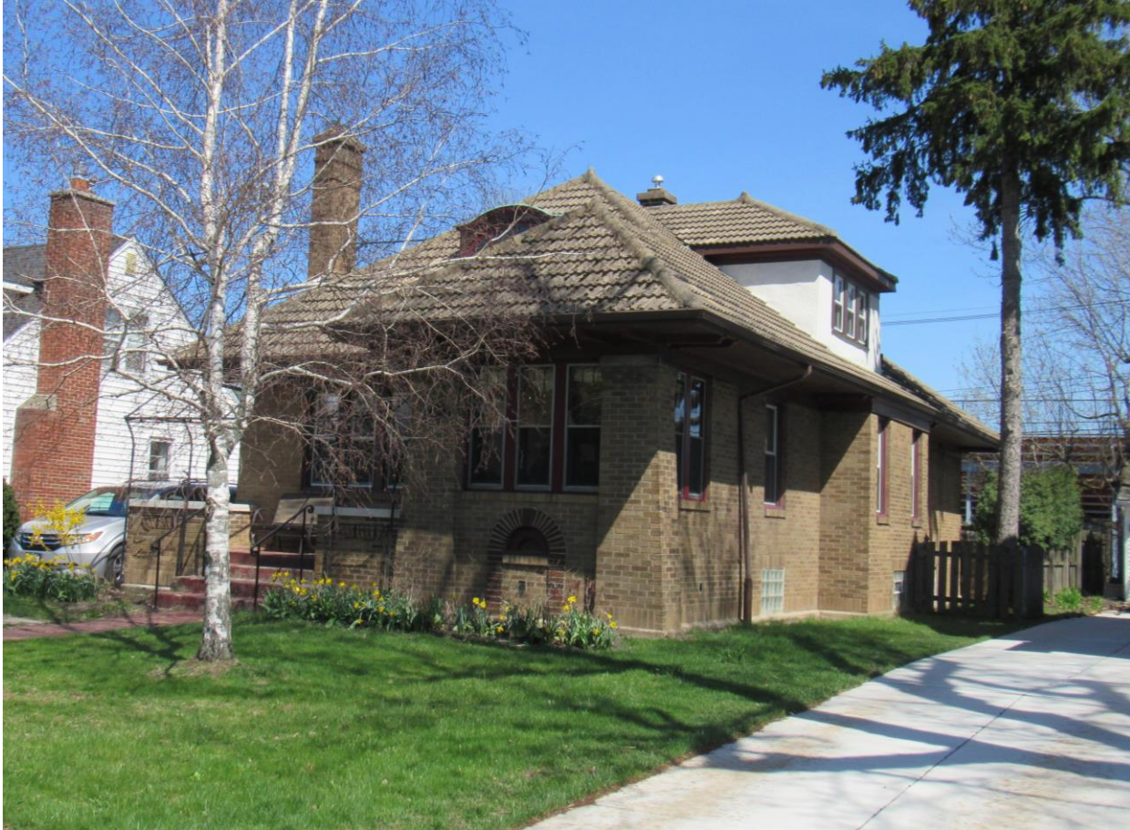
NY_Erie County_Town of Amherst_130 Berryman Drive_South and West Elevations