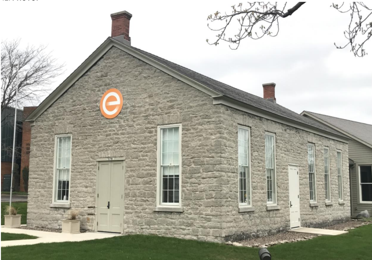
NY_Erie County_Town of Amherst_5178 Main Street_South and East Elevations

20. HISTORICAL AND ARCHITECTURAL IMPORTANCE: Still meets Local Landmark Criterion despite large addition.