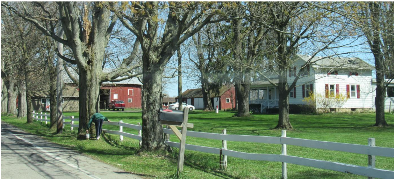
NY_Erie County_Town of Amherst_405 Schoelles Road_North and West Elevation

20. HISTORICAL AND ARCHITECTURAL IMPORTANCE: Remains Unchanged