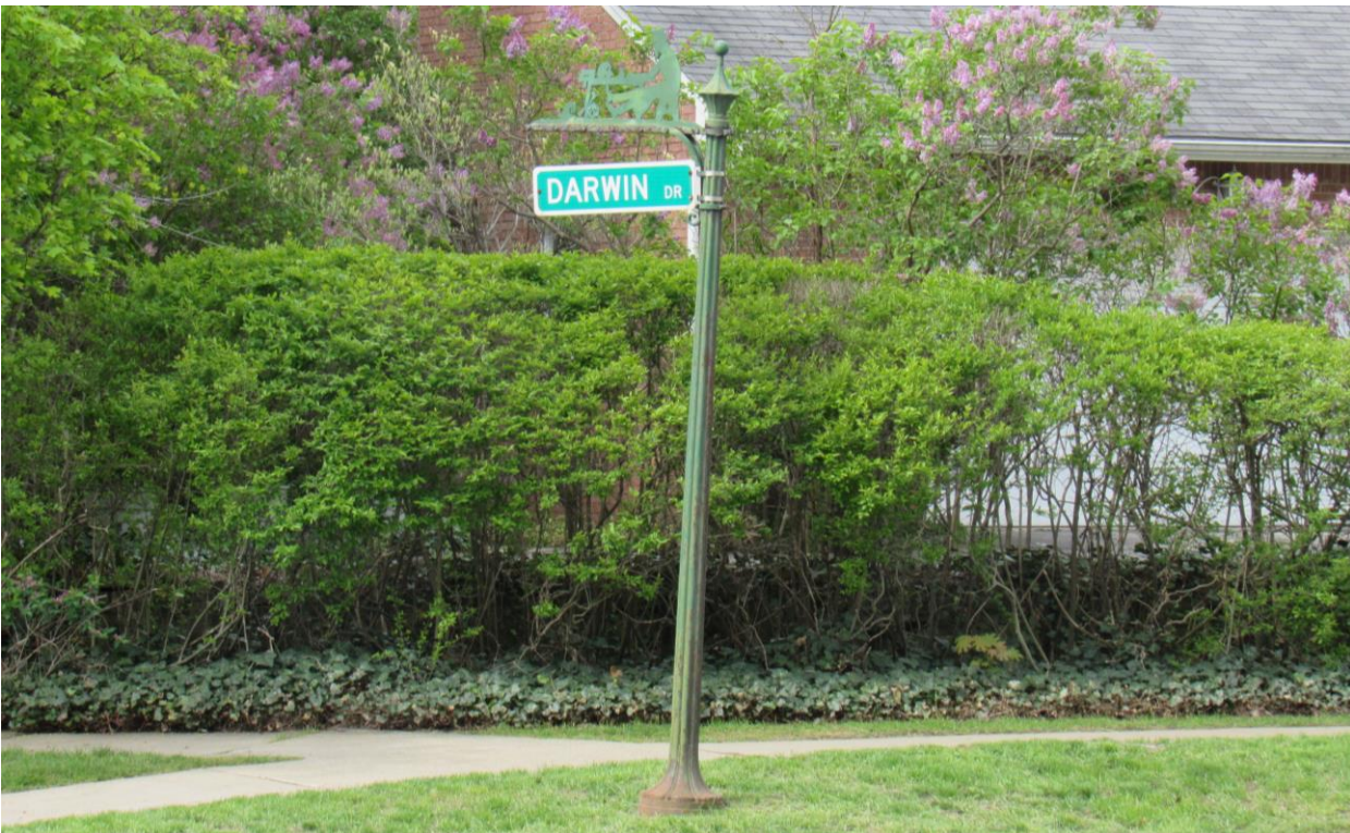
Street sign at Darwin drive and Main Street