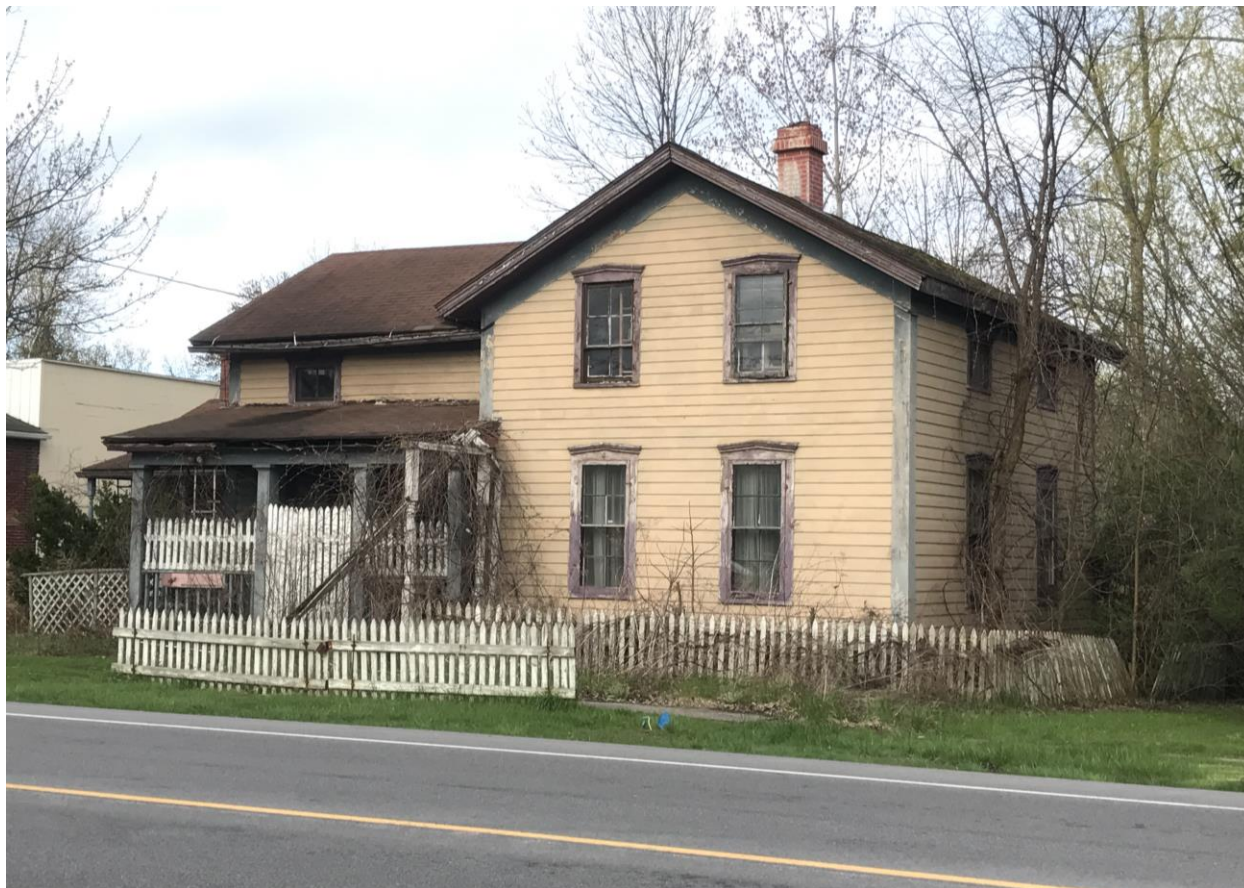
NY_Erie County_Town of Amherst_9920 Transit Road_North and East Elevations

20. HISTORICAL AND ARCHITECTURAL IMPORTANCE: Remains Unchanged.