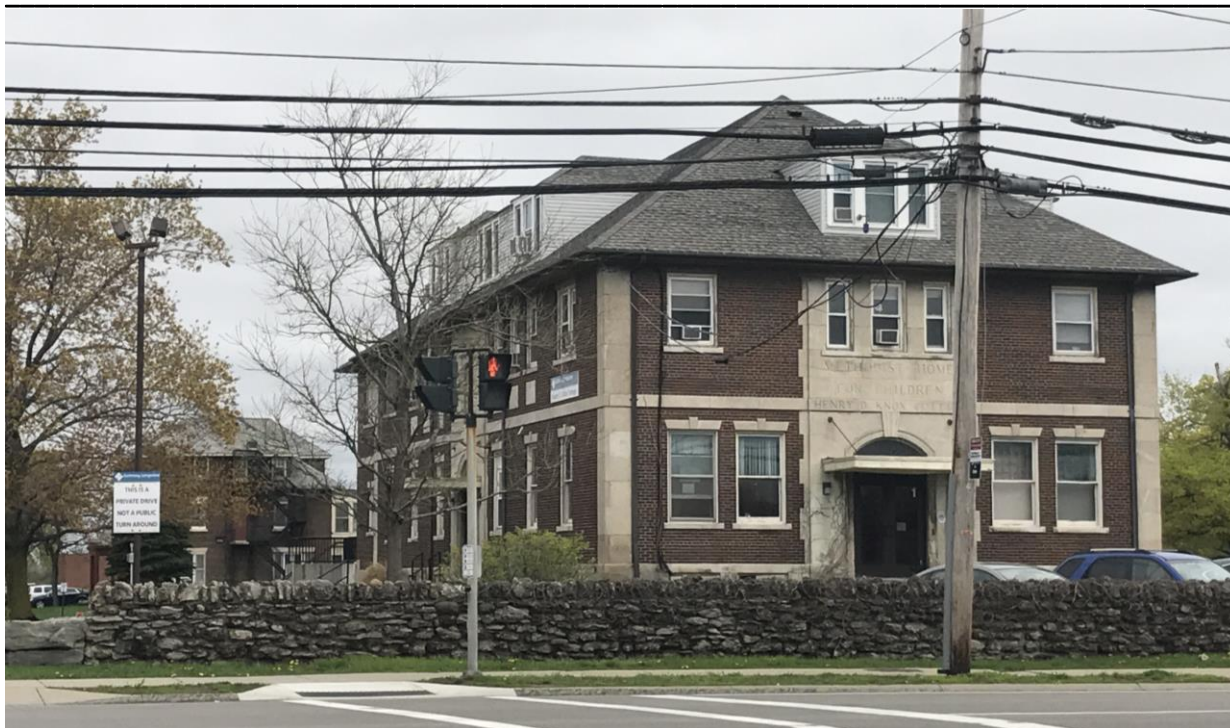
Stone wall in front of 6350 Main Street