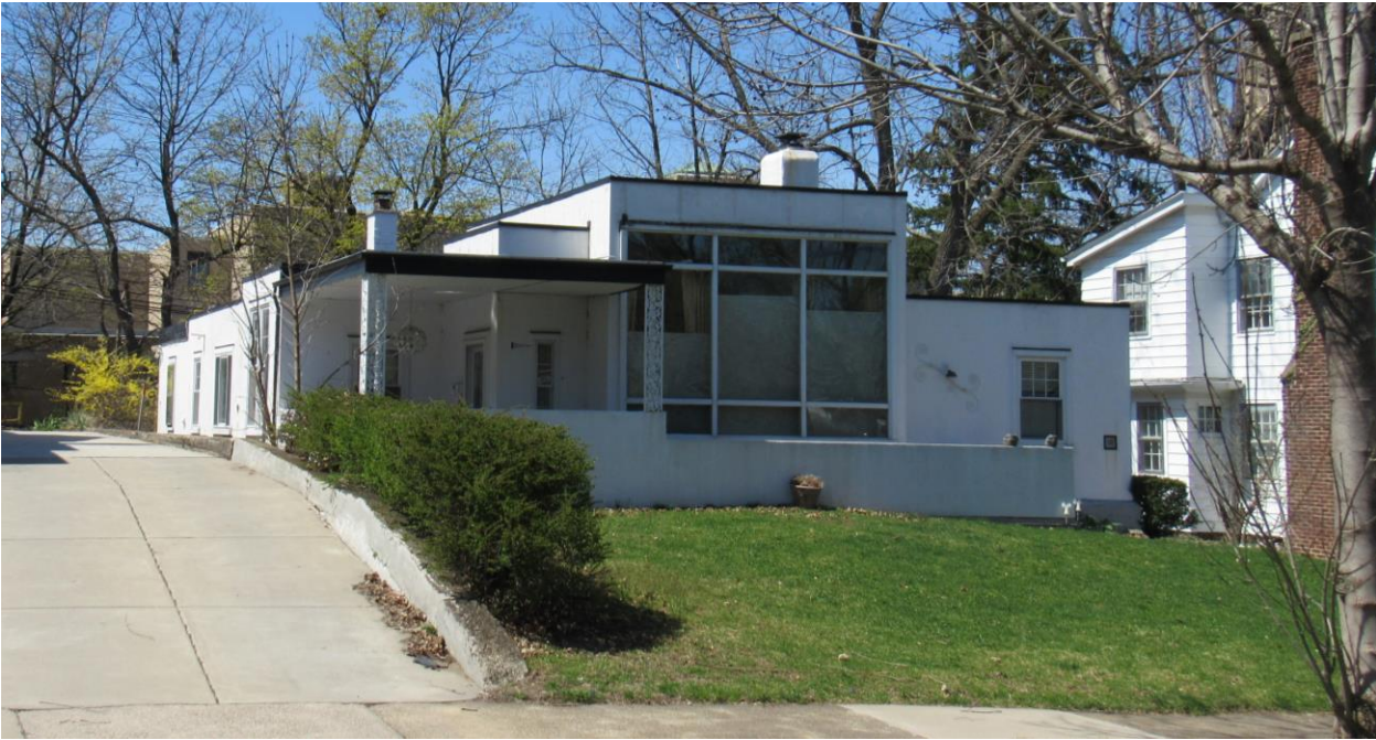
NY_Erie County_Town of Amherst_55 Washington Highway_South and East Elevations