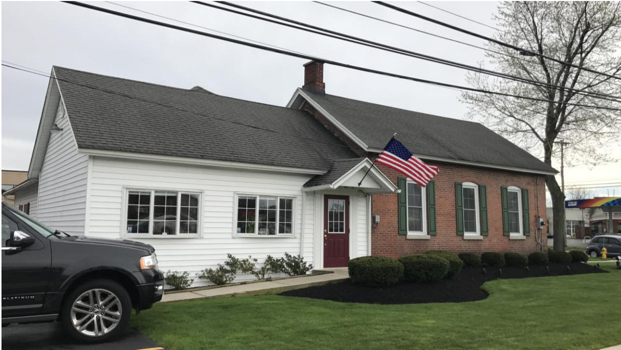
NY_Erie County_Town of Amherst_1323 North Forest Road_North and East Elevations