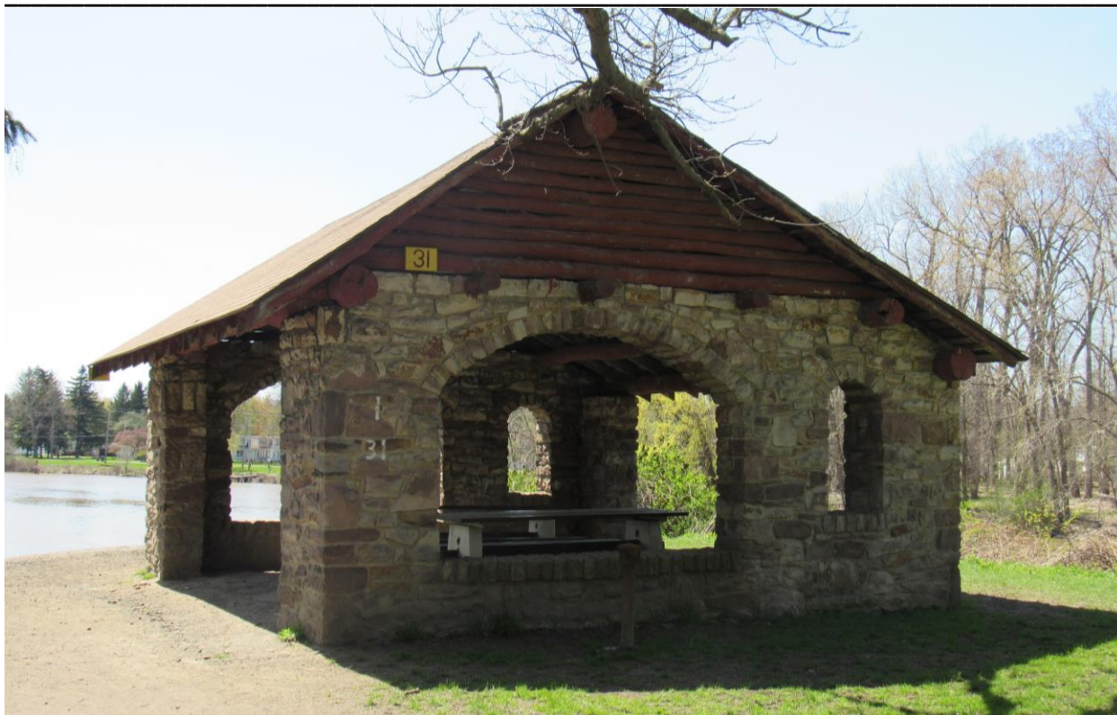
NY_Erie County_Town of Amherst_10 Creekside Drive_Shelter I-31