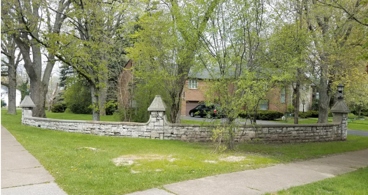
Stone wall at Ivyhurst Road and Main Street