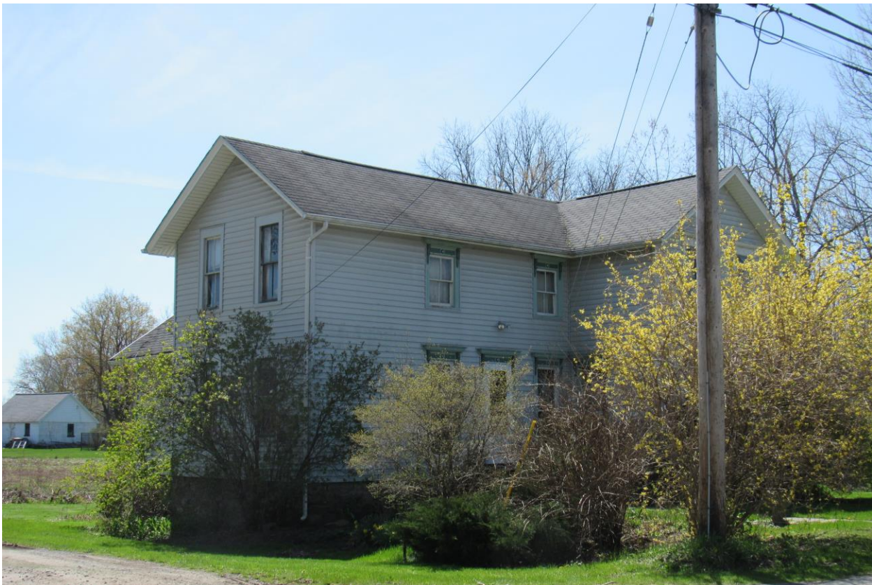
NY_Erie County_Town of Amherst_215 Brenon Road_North and East Elevations