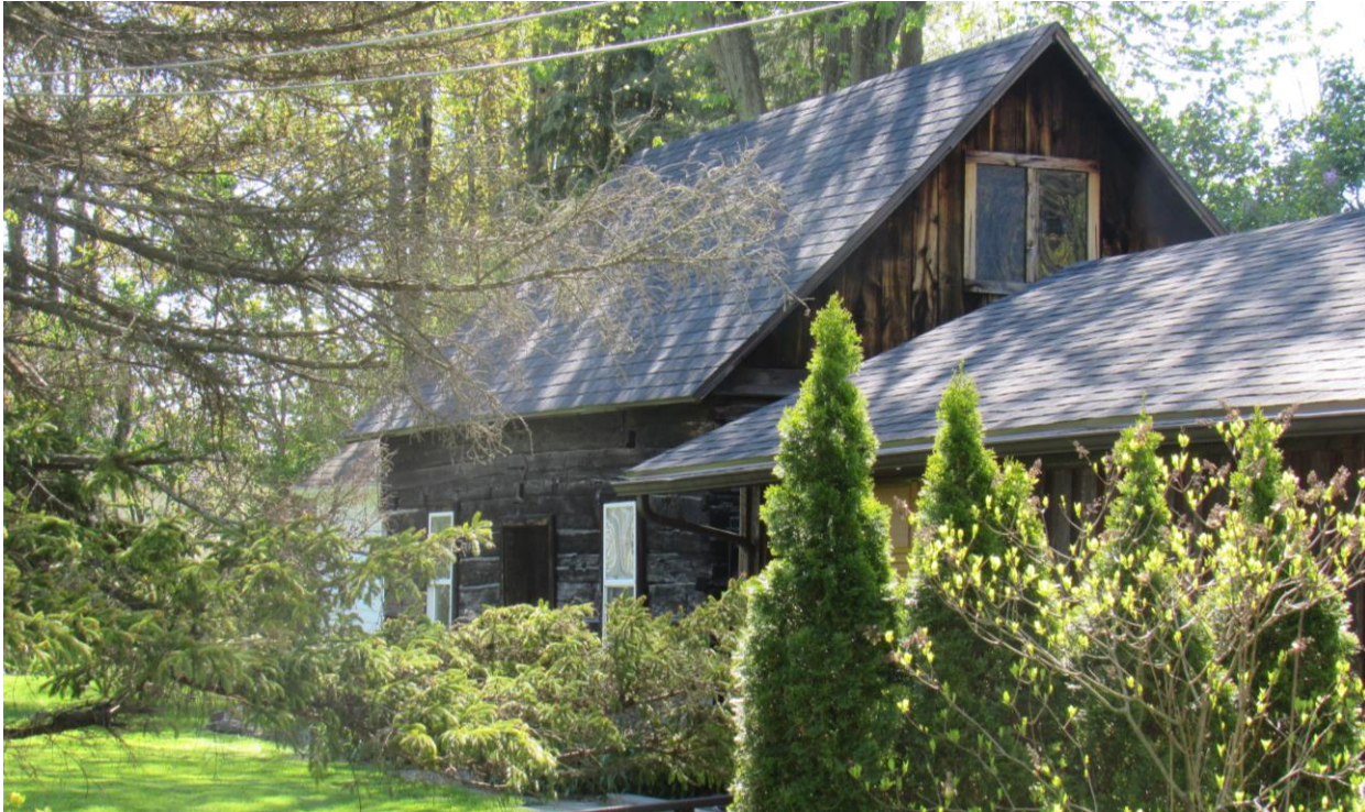
NY_Erie County_Town of Amherst_175 Stuewe Road_North and West Elevations

20. HISTORICAL AND ARCHITECTURAL IMPORTANCE: Still meets Local Landmark Criterion due to the log cabin being a rare and remaining resource in the Town of Amherst.