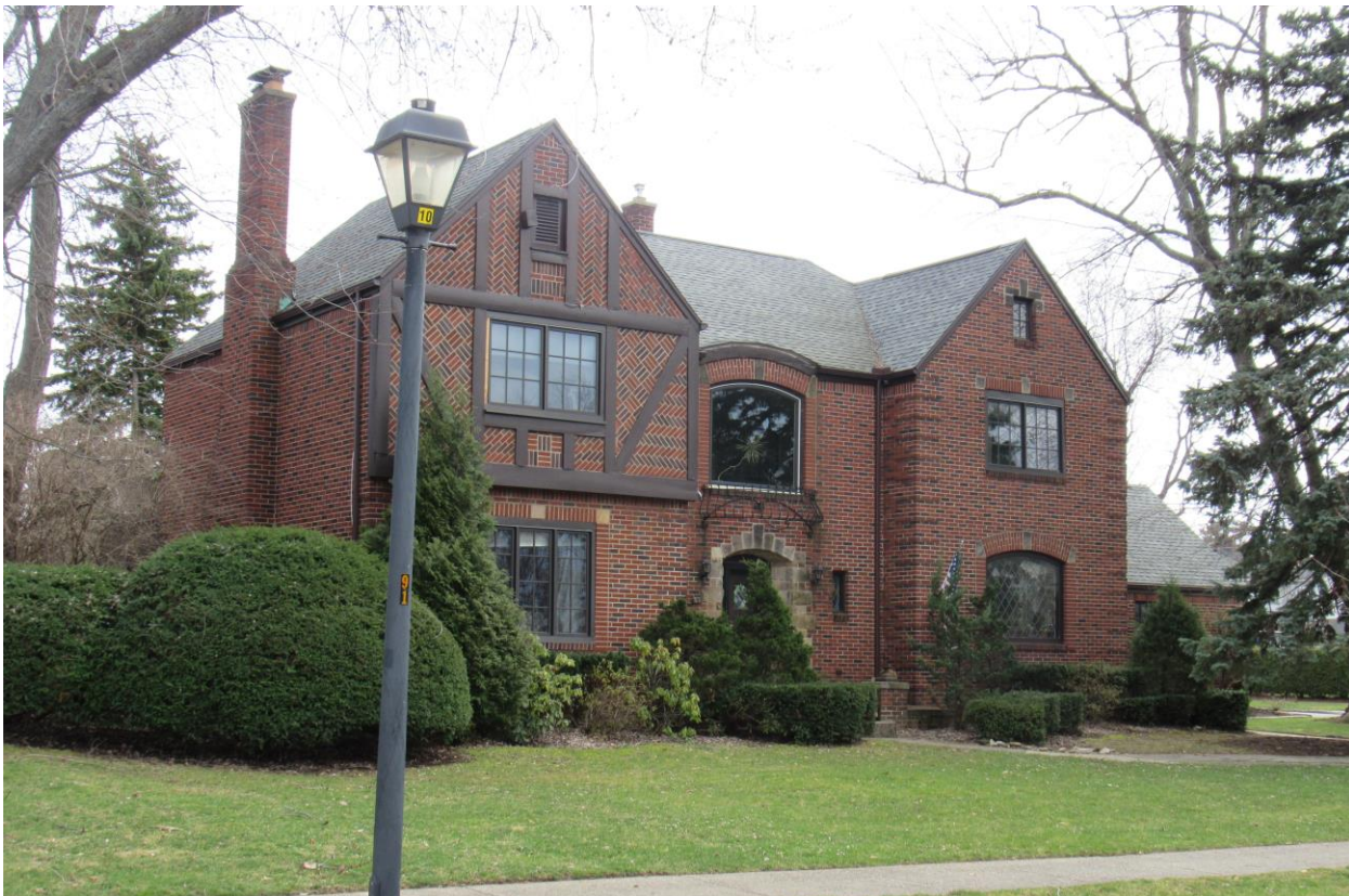
NY_Erie County_Town of Amherst_85 Crosby Boulevard_North and East Elevations