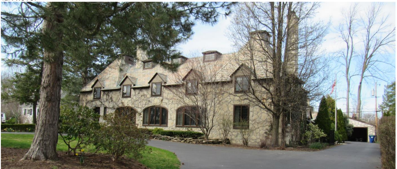
NY_Erie County_Town of Amherst_74 Keswick Road_South and East Elevations

20. HISTORICAL AND ARCHITECTURAL IMPORTANCE: Remains Unchanged