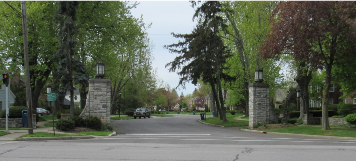
Stone walls at Darwin Drive and Main Street