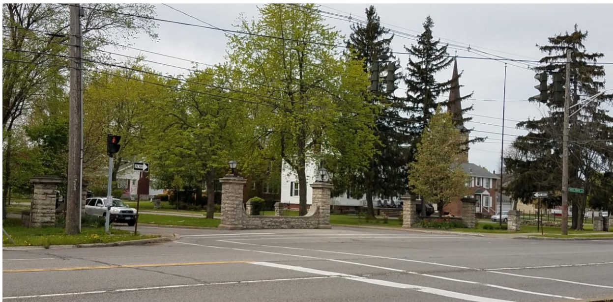
Stone Wall at High Park and Main Street

20. HISTORICAL AND ARCHITECTURAL IMPORTANCE: Remain Unchanged.