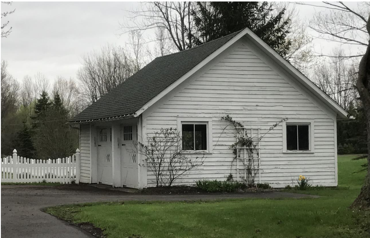
NY_Erie County_Town of Amherst_1645 Dodge Road_Detached Garage

20. HISTORICAL AND ARCHITECTURAL IMPORTANCE: Remains unchanged.