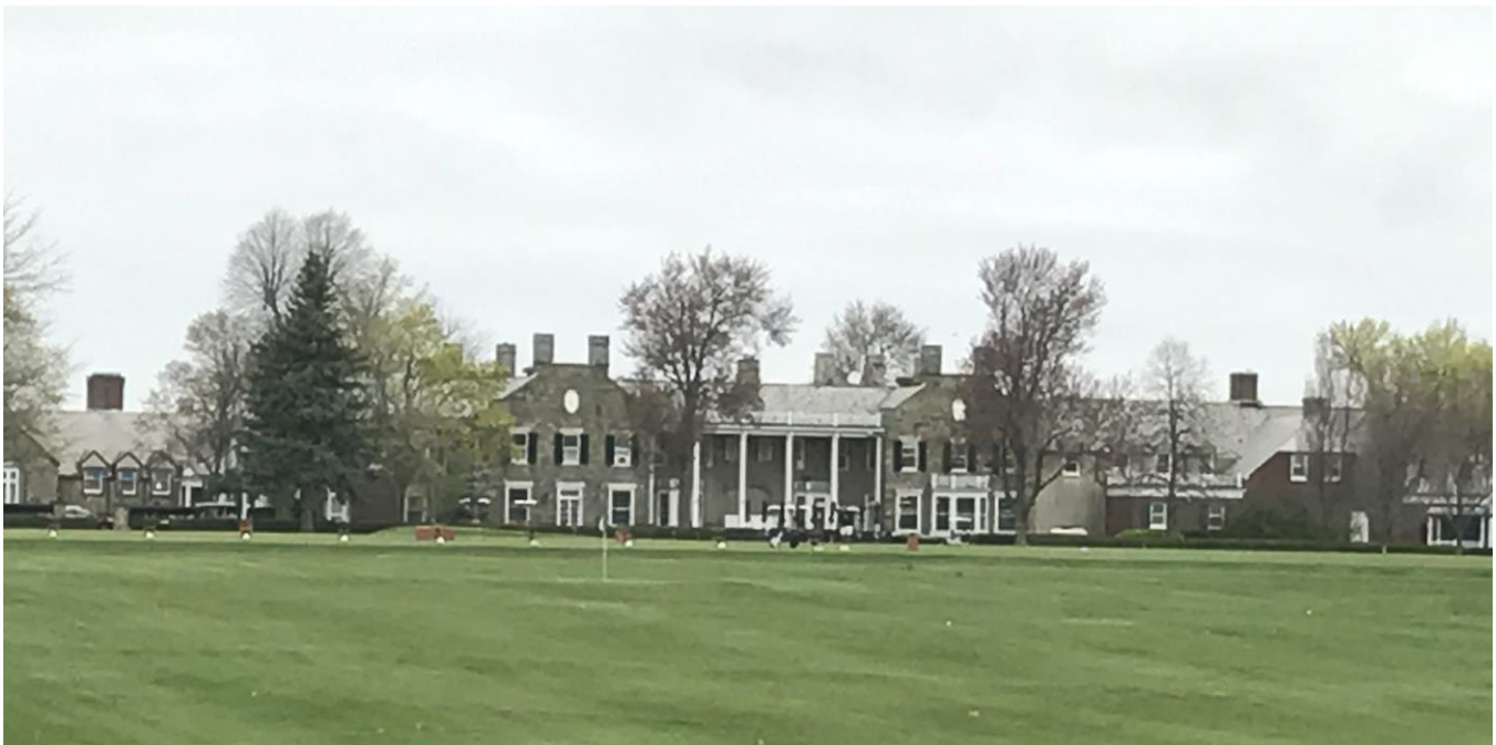
NY_Erie County_Town of Amherst_250 Youngs Road_South Elevation

20. HISTORICAL AND ARCHITECTURAL IMPORTANCE: Remains Unchanged.