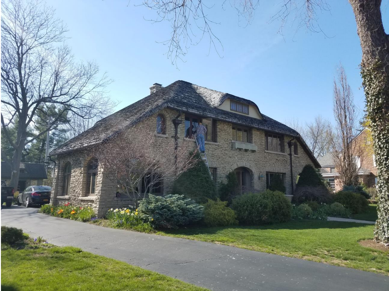
NY_Erie County_Town of Amherst_31 Darwin Drive_South and East Elevations

20. HISTORICAL AND ARCHITECTURAL IMPORTANCE: Remains unchanged.