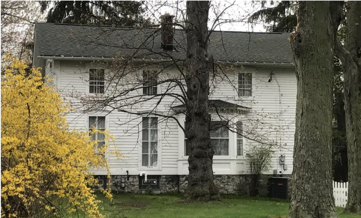
NY_Erie County_Town of Amherst_1645 Dodge Road_West Elevation