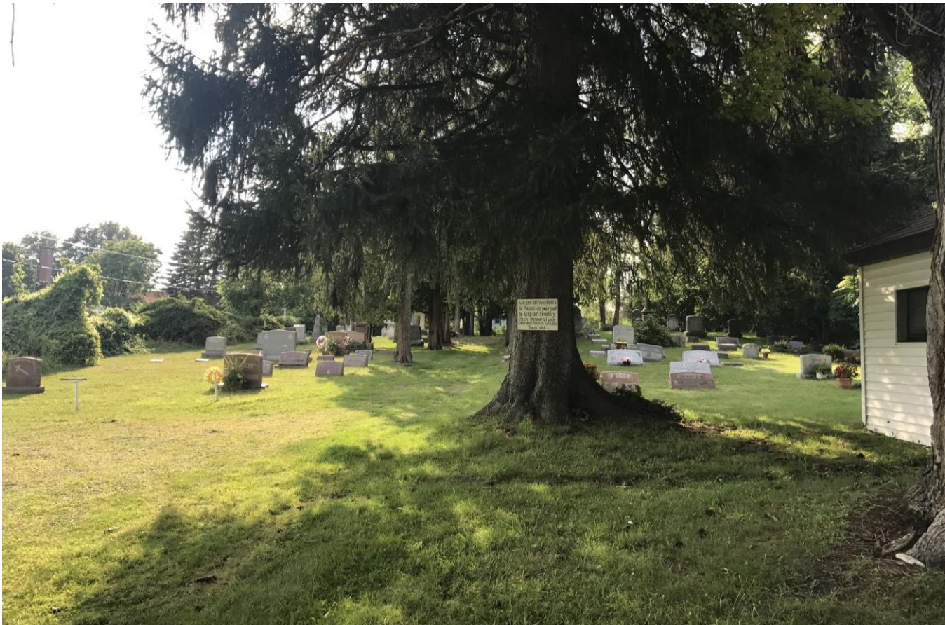
NY_Erie County_ Town of Amherst _8950 Transit_View West

20. HISTORICAL AND ARCHITECTURAL IMPORTANCE: Remains Unchanged.