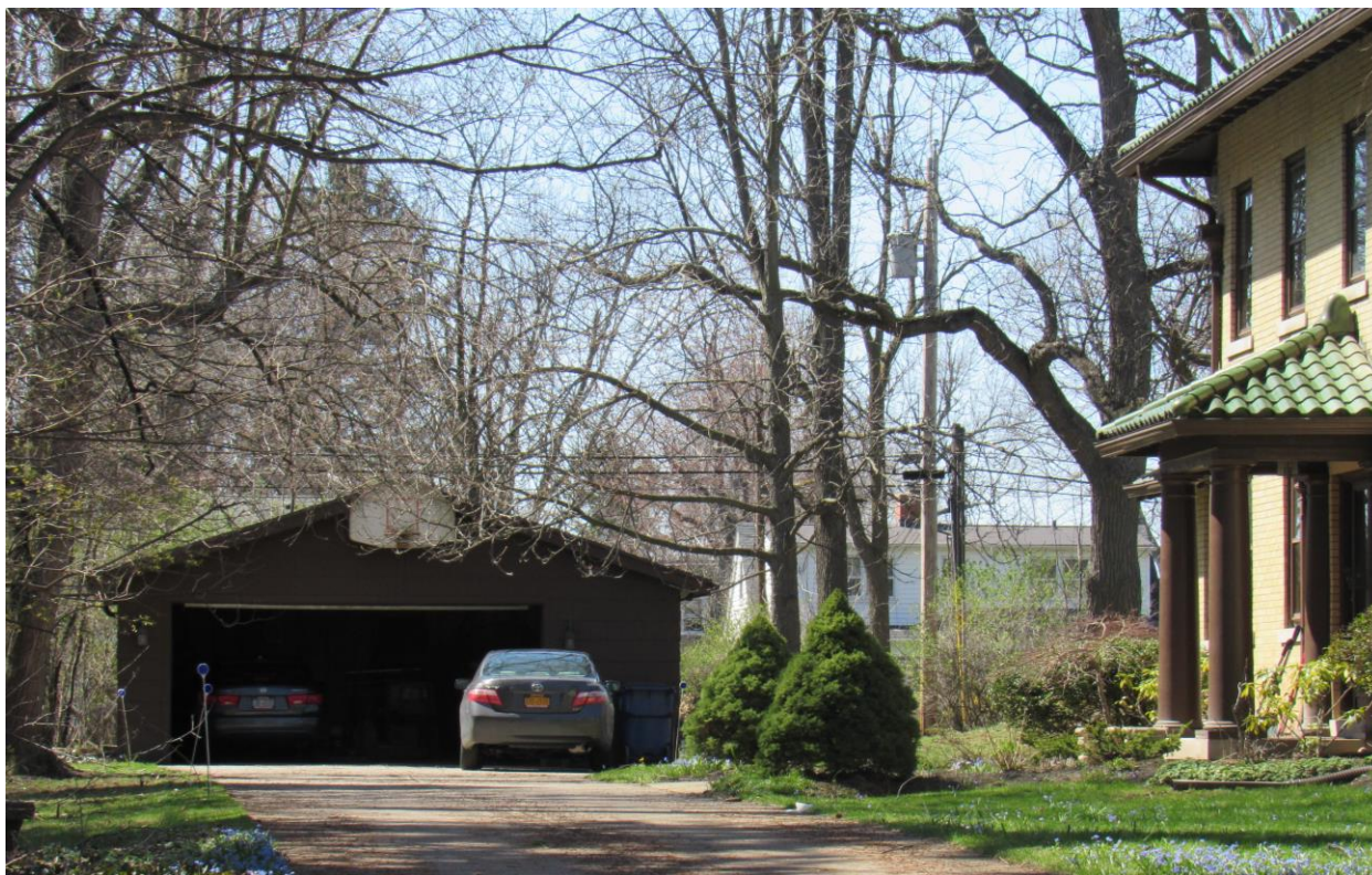
NY_Erie County_Town of Amherst_32 Ivyhurst Road_Detached Garage

20. HISTORICAL AND ARCHITECTURAL IMPORTANCE: Remains Unchanged.