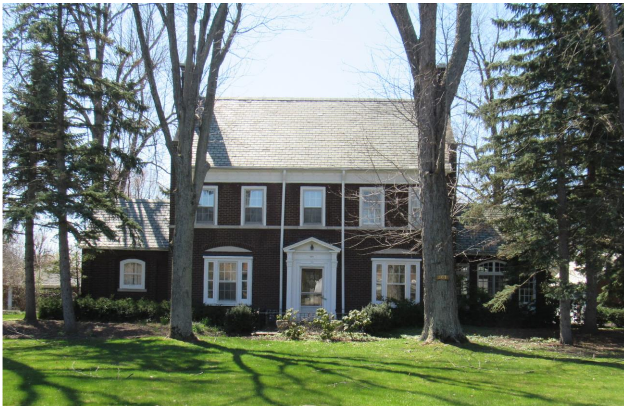
NY_Erie County_Town of Amherst_367 LeBrun Road_North Elevation

20. HISTORICAL AND ARCHITECTURAL IMPORTANCE: Remains unchanged.