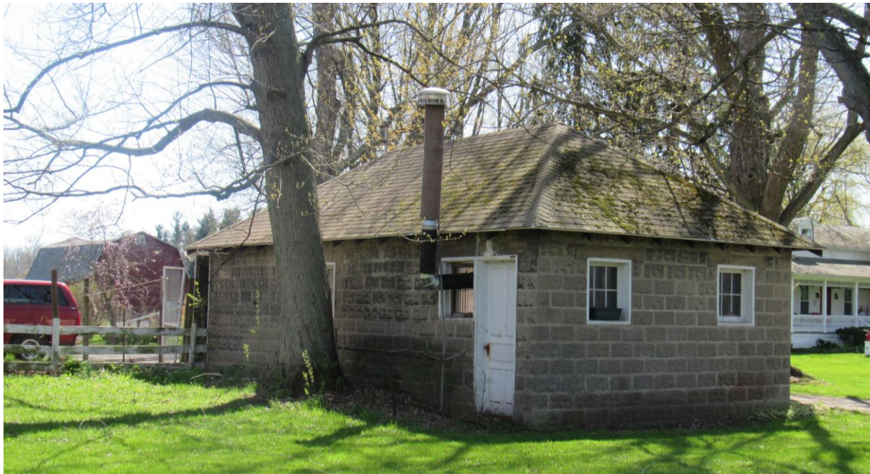
NY_Erie County_Town of Amherst_405 Schoelles Road_North and East Elevations_Outbuilding East of House