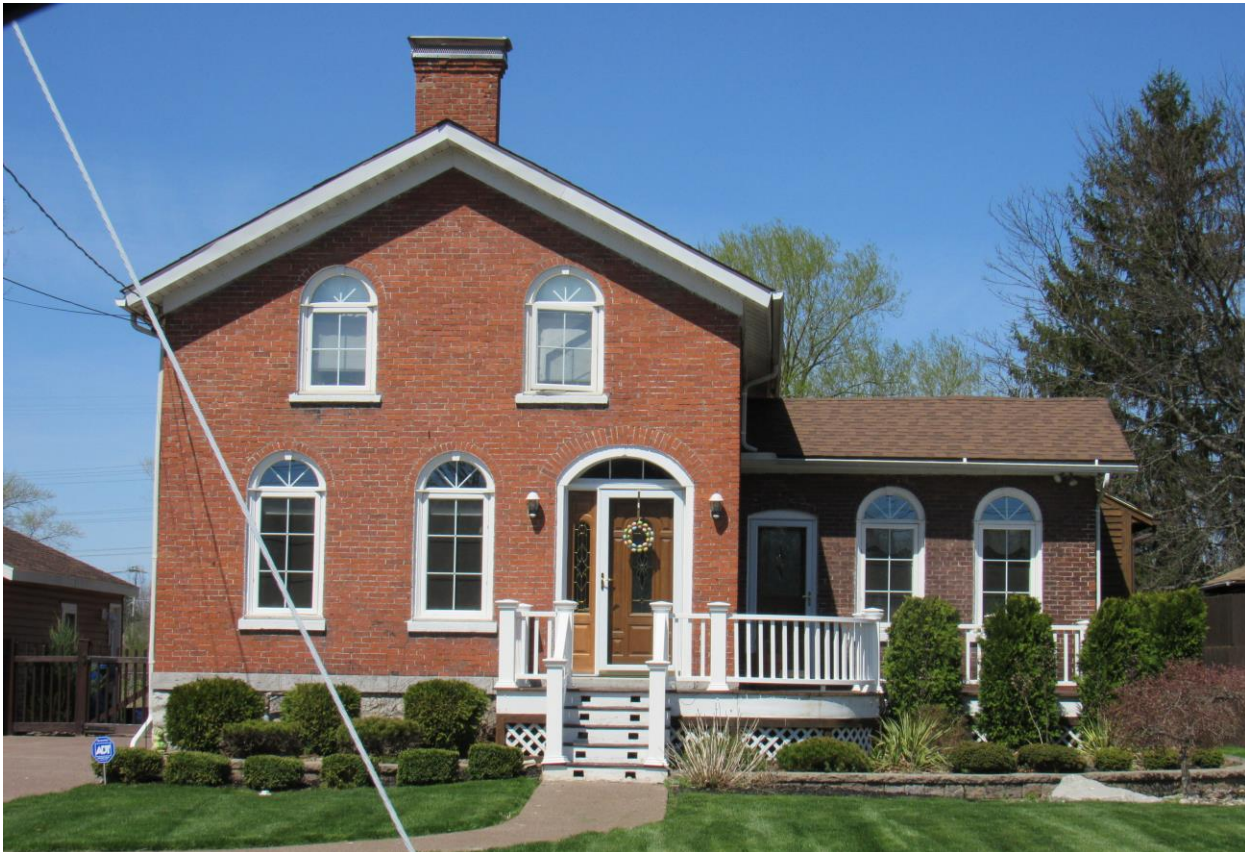
NY_Erie County_Town of Amherst_110 North Ellicott Creek Road_South Elevation

20. HISTORICAL AND ARCHITECTURAL IMPORTANCE: Still meets Local Landmark Criterion despite window and entrance door replacements.