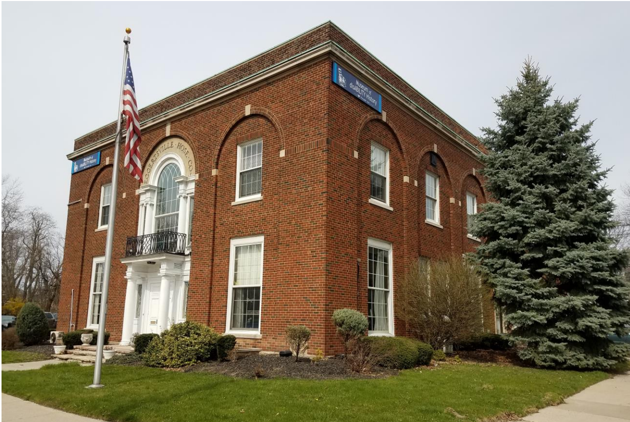
NY_Erie County_Town of Amherst_3826 Main Street_South and East Elevations

20. HISTORICAL AND ARCHITECTURAL IMPORTANCE: Remains Unchanged.