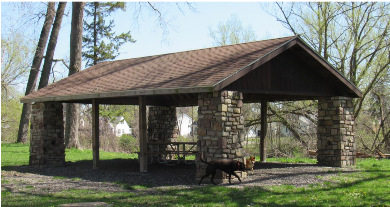
NY_Erie County_Town of Amherst_10 Creekside Drive_Shelter I-30