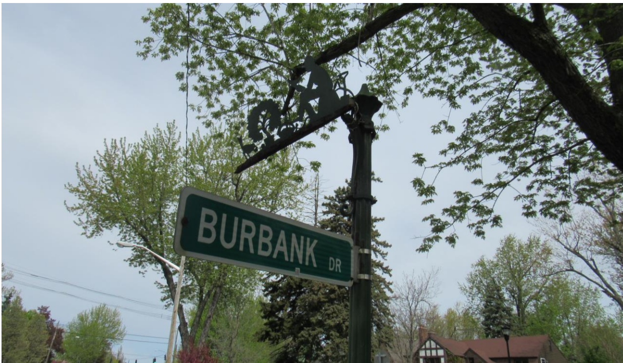
Street sign for Burbank Drive and Main Street