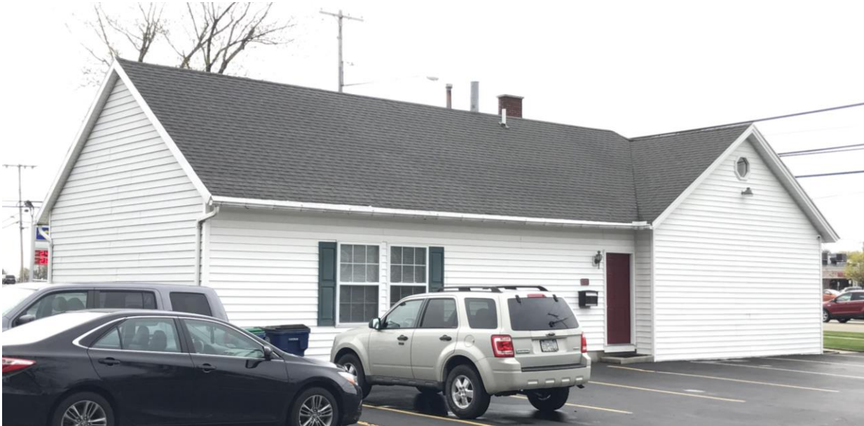
NY_Erie County_Town of Amherst_1323 North Forest Road_East Elevation