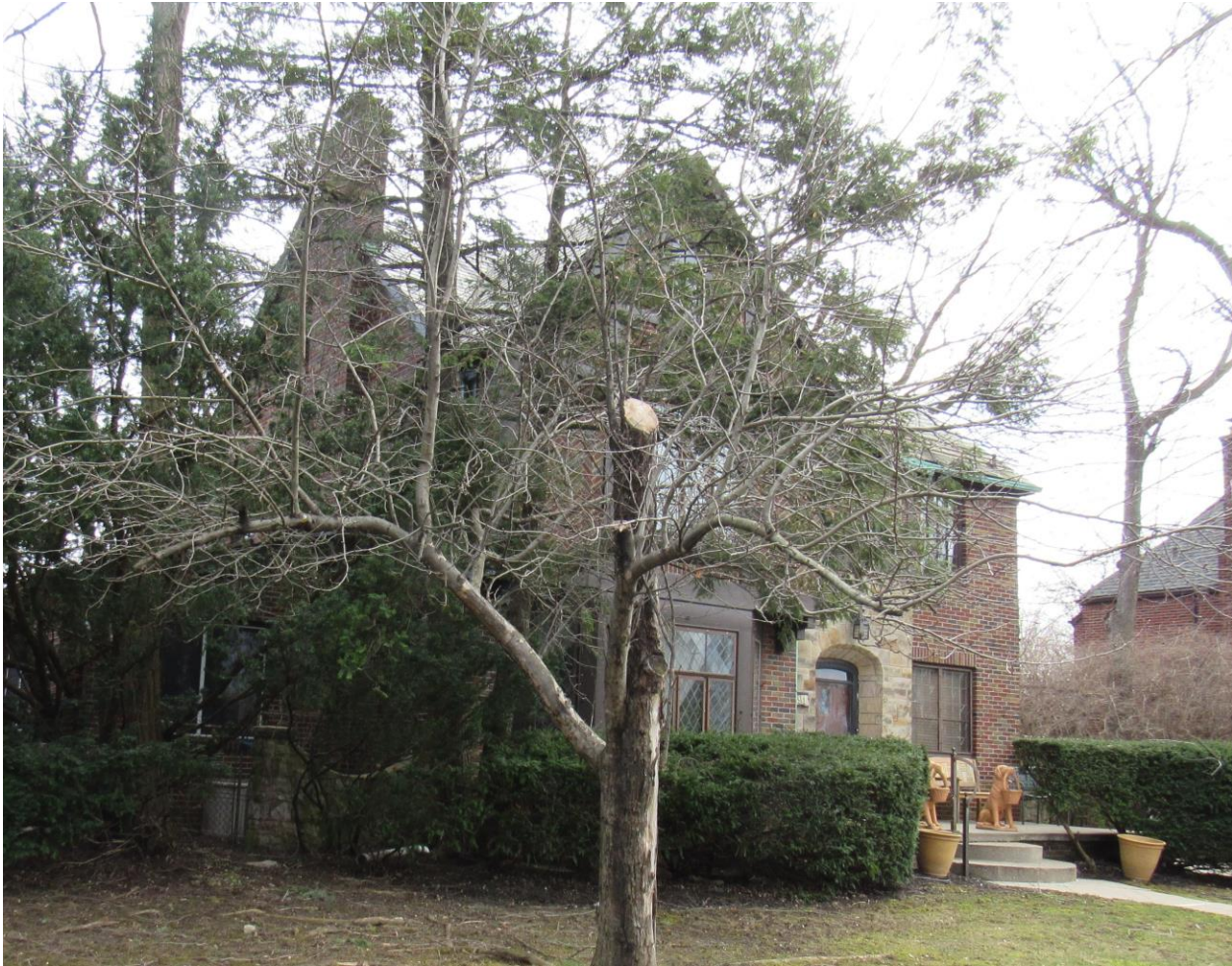
NY_Erie County_Town of Amherst_91 Crosby Boulevard_North and East Elevations