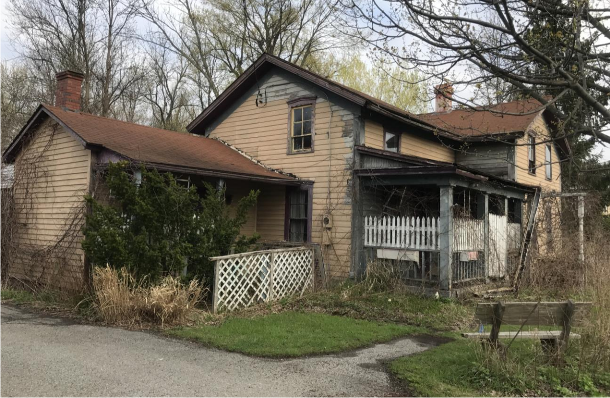
NY_Erie County_Town of Amherst_9920 Transit Road_South and East Elevations