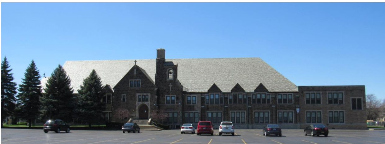
NY_Erie County_Town of Amherst_1317 Eggert Road_St. Benedict's School_North Elevation