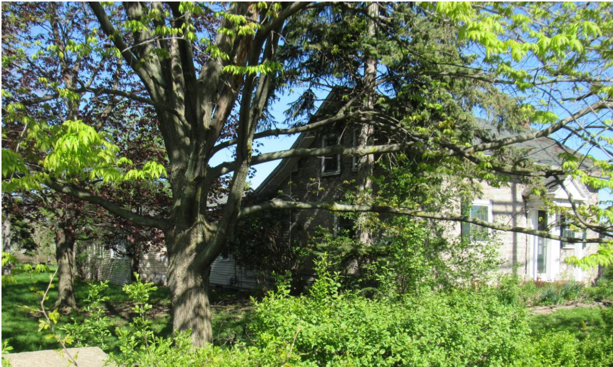
NY_Erie County_Town of Amherst_4030 Rensch Road_South and East Elevations