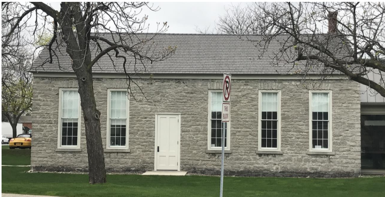
NY_Erie County_Town of Amherst_5178 Main Street_East Elevation