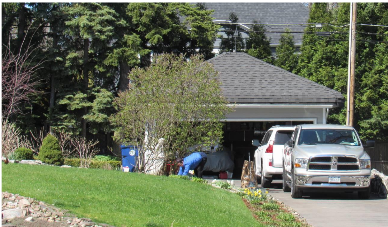
NY_Erie County_ Town of Amherst _89 Berryman Drive_ Detached Garage