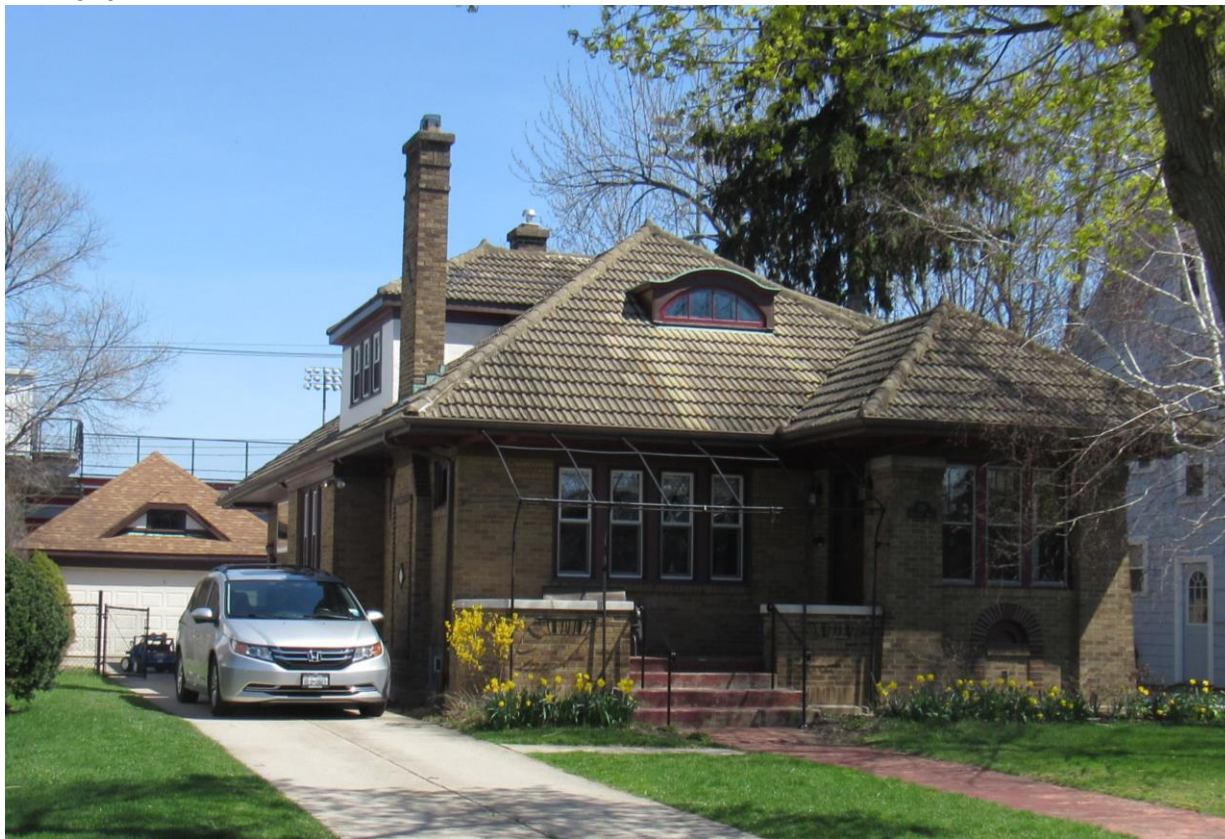
NY_Erie County_Town of Amherst_130 Berryman Drive_North and West Elevations

20. HISTORICAL AND ARCHITECTURAL IMPORTANCE: Remains unchanged.