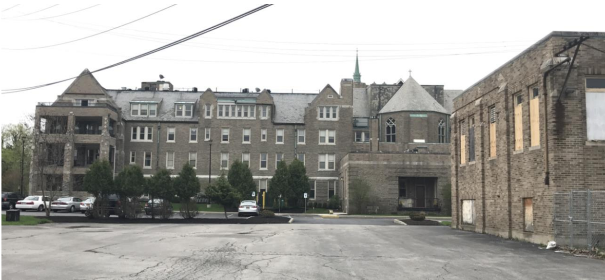
NY_Erie County_Town of Amherst_508 Mill Street_North Elevation