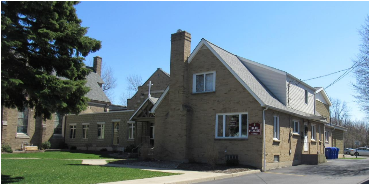
NY_Erie County_Town of Amherst_4001 Main Street_North and West Elevations