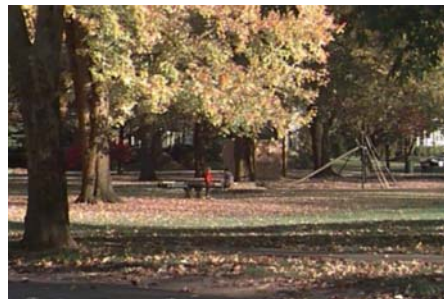
Island Park in the Village of Williamsville.