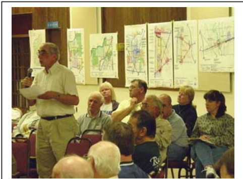
Residents comment on the Draft Plan at a Public Hearing.

In addition to the above components, the Town has maintained an active Comprehensive Plan website to further disseminate information and receive input on the Plan. Functions of the Comprehensive Plan website include: