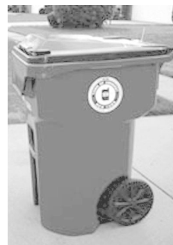
EH-93 (Rev. 10.08) ECHD

A neighborhood's best defense is the use of rodent proof garbage cans with tightfitting covers, or garbage totes provided by your municipality, to eliminate the rat's food supply, and the removal of assorted junk, to destroy the shelter needed by rats to survive. Also, rat proofing of all buildings and homes in a neighborhood will prevent infestation.