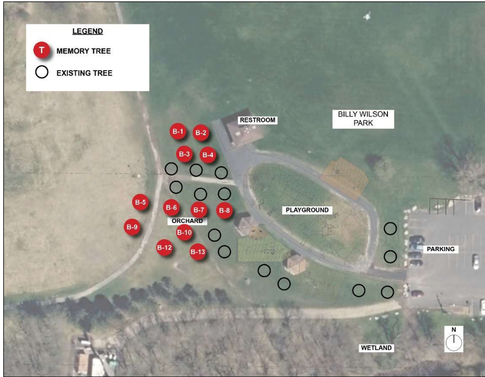
BILLY WILSON PARK