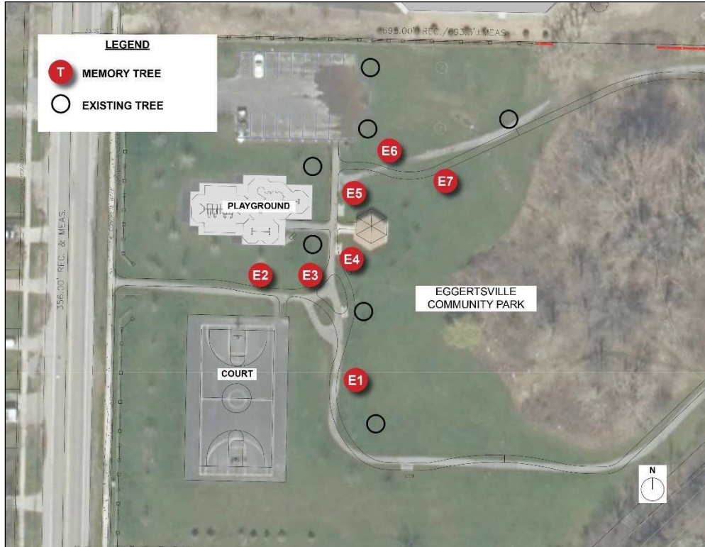
EGGERTSVILLE COMMUNITY PARK