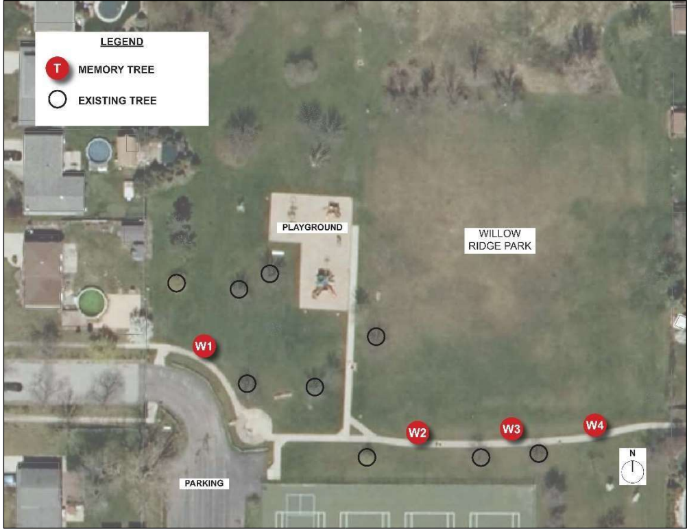
BEDFORD/WILLOW RIDGE PARK