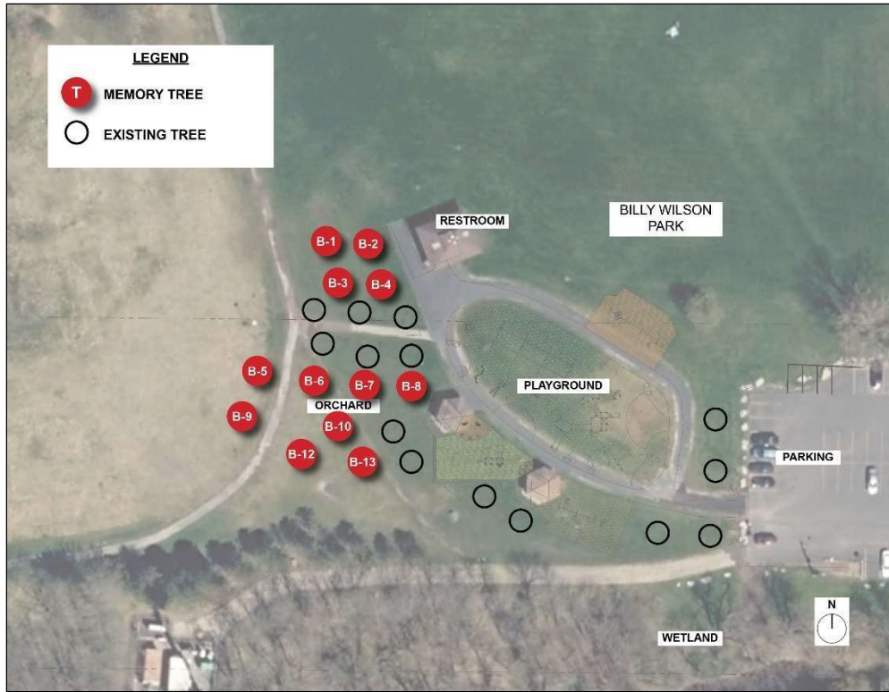
BILLY WILSON PARK