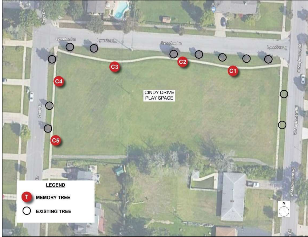
CINDY DRIVE PLAY AREA