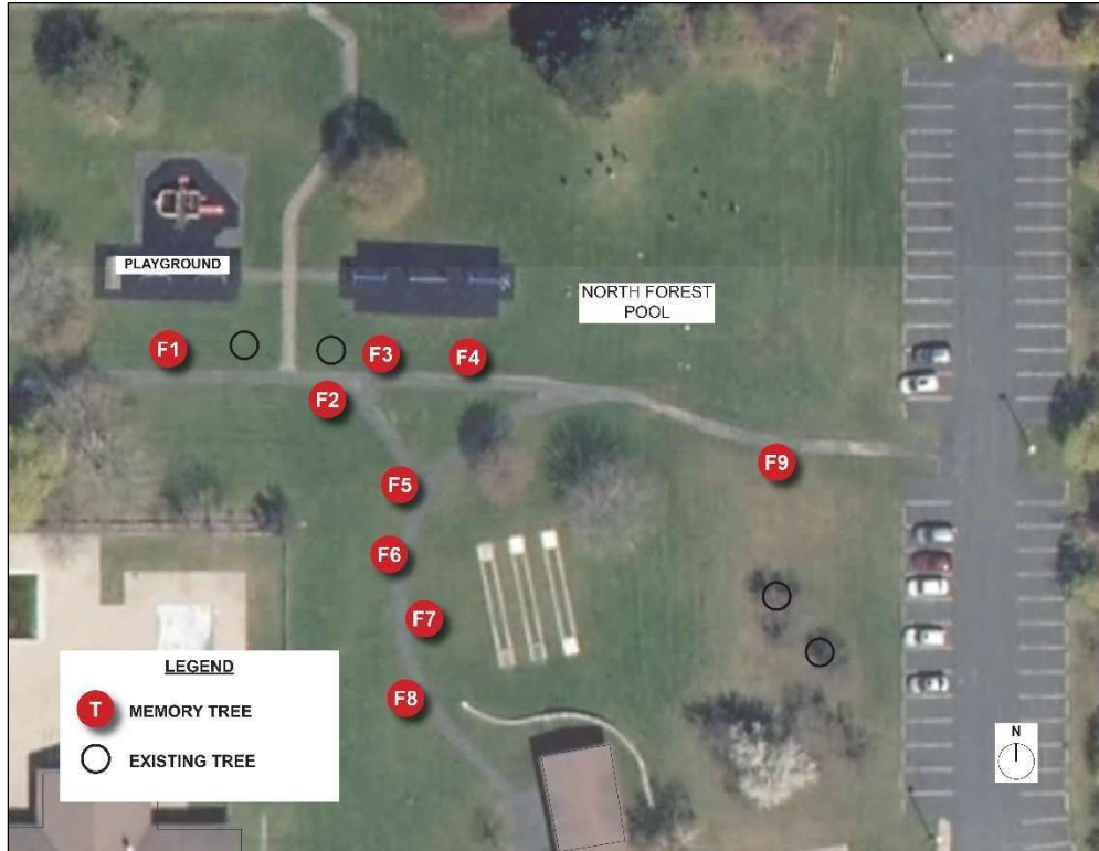
NORTH FOREST PARK & POOL