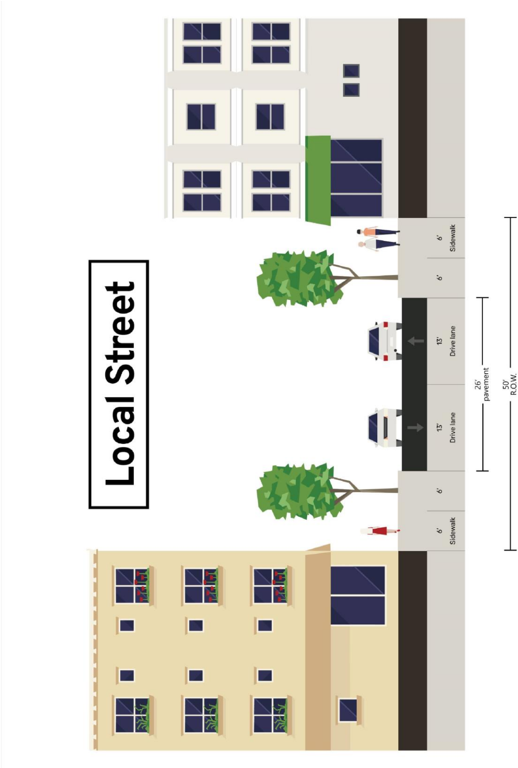
FIGURE 5: Boulevard Frontage