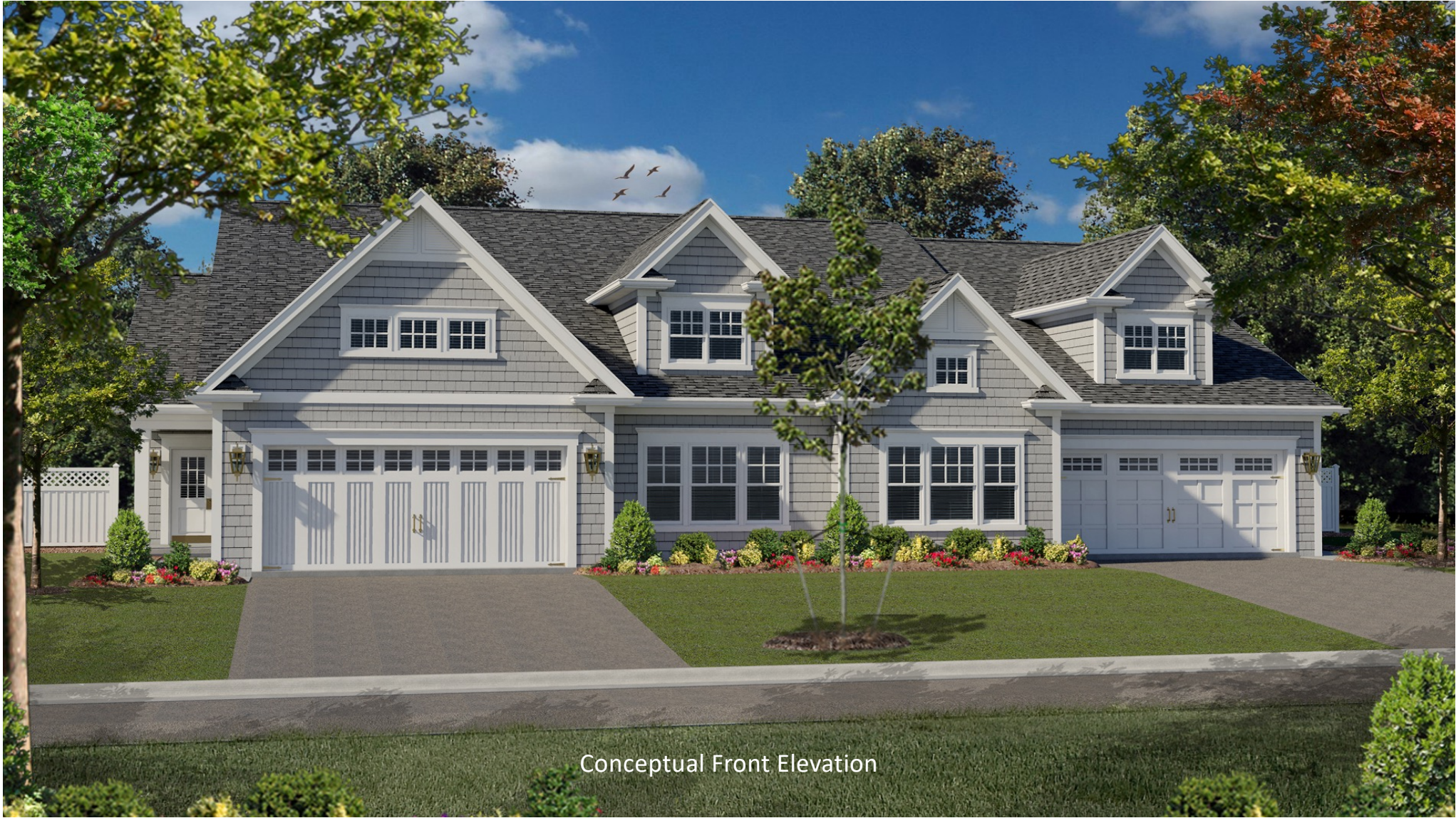
Conceptual Front Elevation