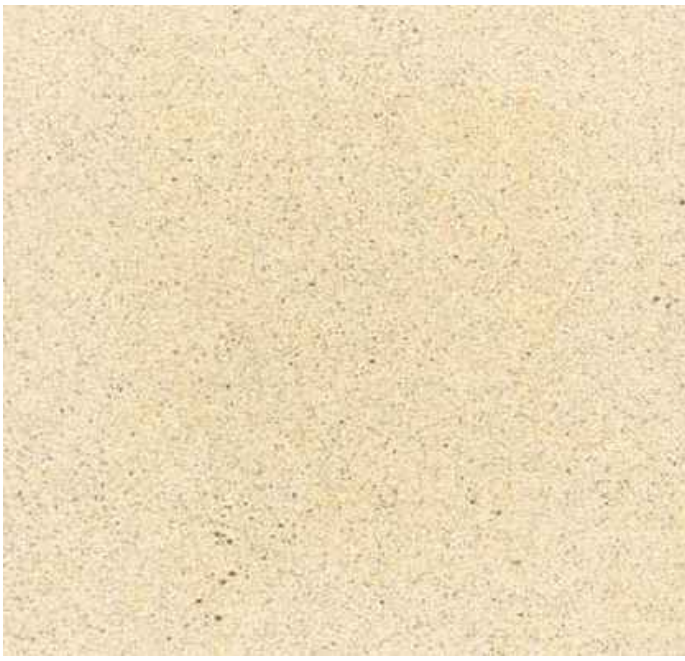
MAIN/REAR ENTRY FACADE AND ADJACENT FACADES GLASS FIBER REINFORCED CONCRETE (GFRC) BUFF