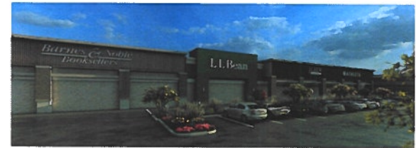
EXACT SIGN LOGO TBD, SIGNS SHOW ARE FOR PLACEHOLDER ONLY

EXTERIOR STOREFRONT SIGNAGE 1/8" = 1'-0"