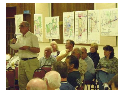
Residents comment on the Draft Plan at a Public Hearing.

In addition to the above components, the Town has maintained an active Comprehensive Plan website to further disseminate information and receive input on the Plan. Functions of the Comprehensive Plan website include: