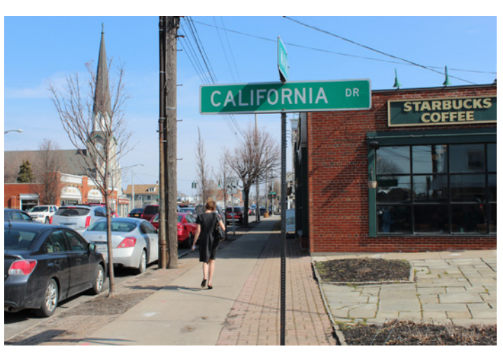
This is in the Village, but its a great example of good adaptive reuse of and old building with a contemporary use.