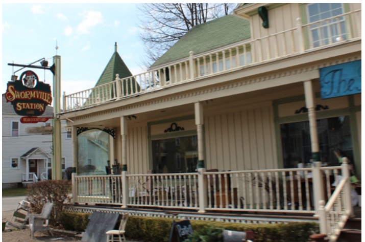
Swarmville was a place mentioned that had the potential to become a walkable node in the Town.