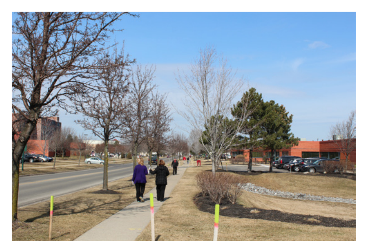
Amherst has a number of under-utilized office parks. People walking with nowhere to go.