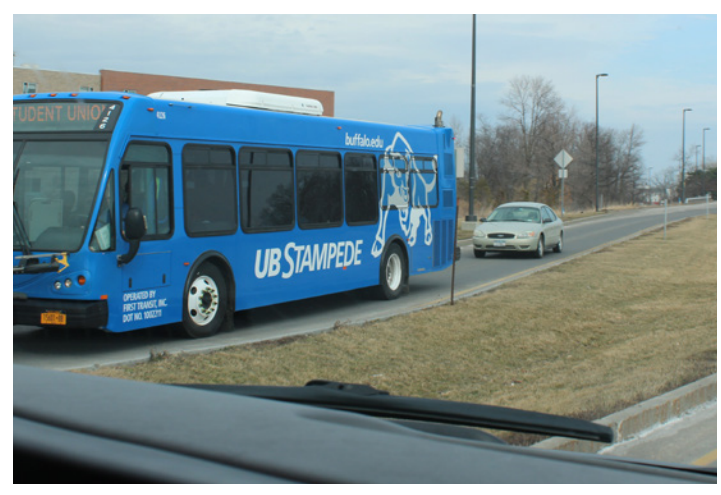
The UB Stampede.