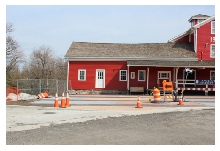
The old mill site is a stormwater project in the Village. Permeable brick pavers help to capture stormwater runoff.