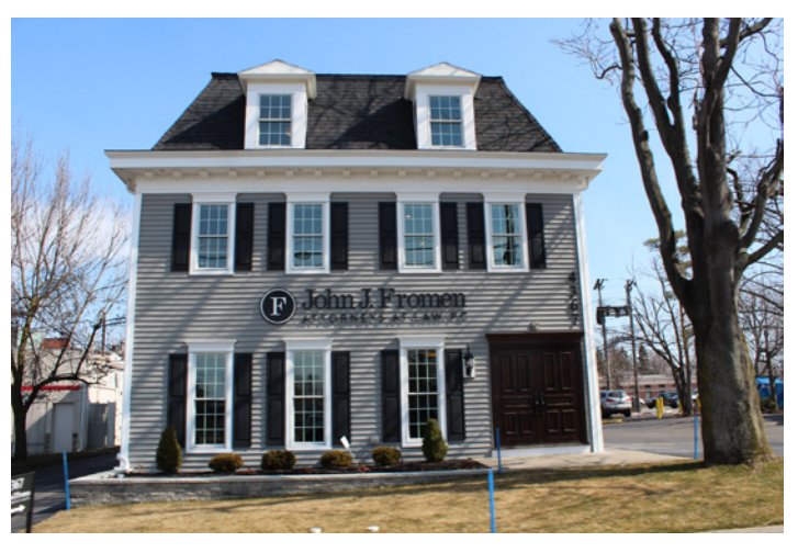
Houses can be offices too.