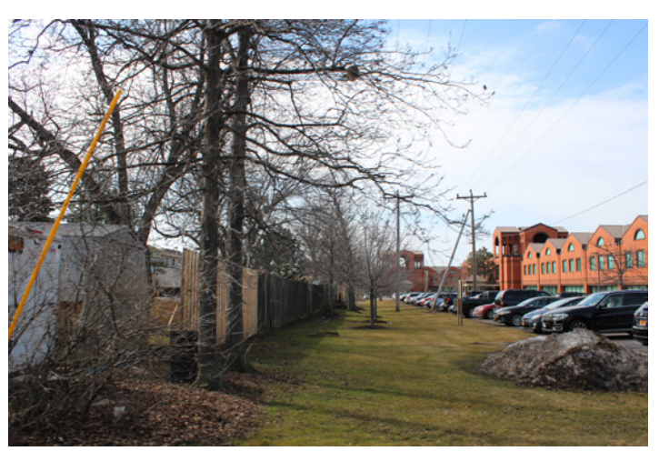
Another example of a buffer area