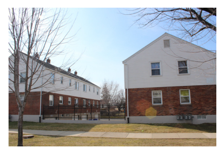
With parking underneath.