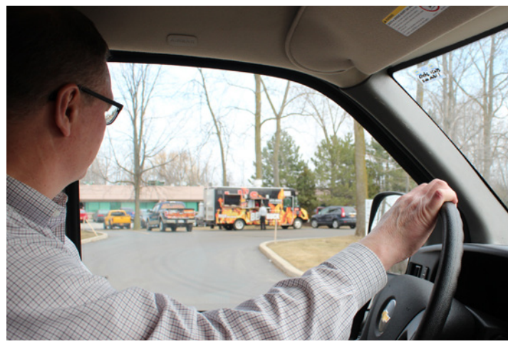
Lunch options are limited for workers in some of the Town's single-use office parks.