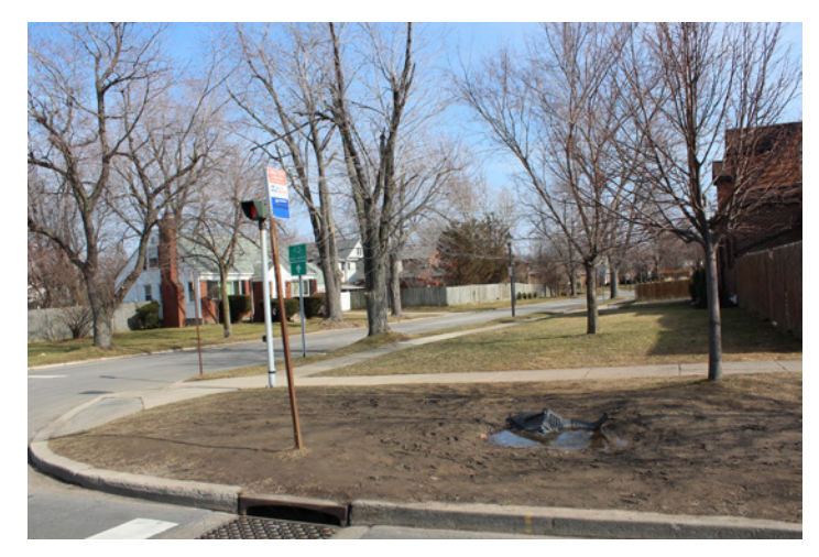
This bus stop could use some help