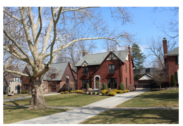
Amherst has some exceptional housing stock.