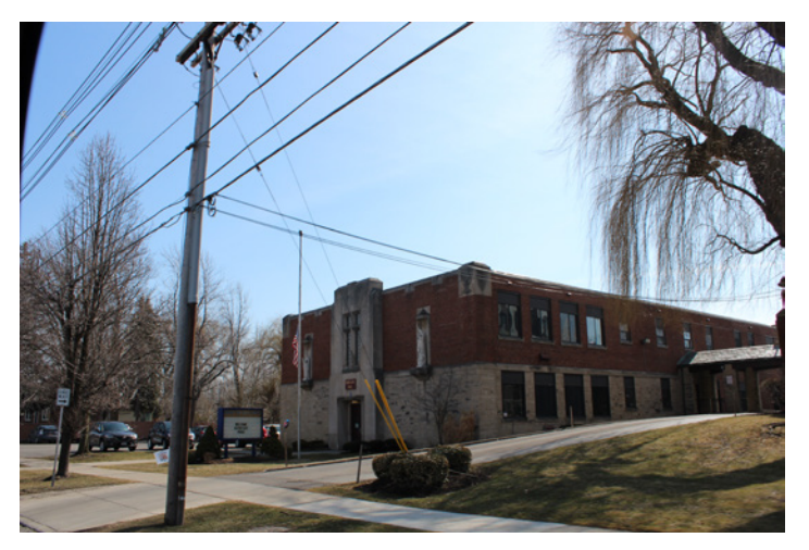
The Town has some great old buildings.