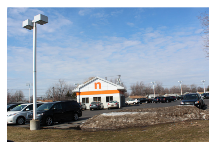
Snow storage is important.