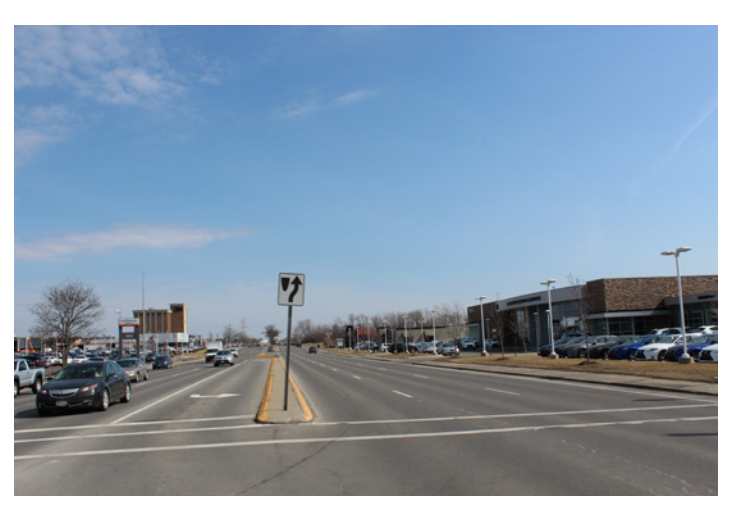
This road is also too wide.