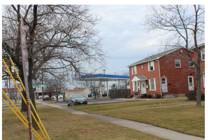
I wouldn't want to live next to this gas station.