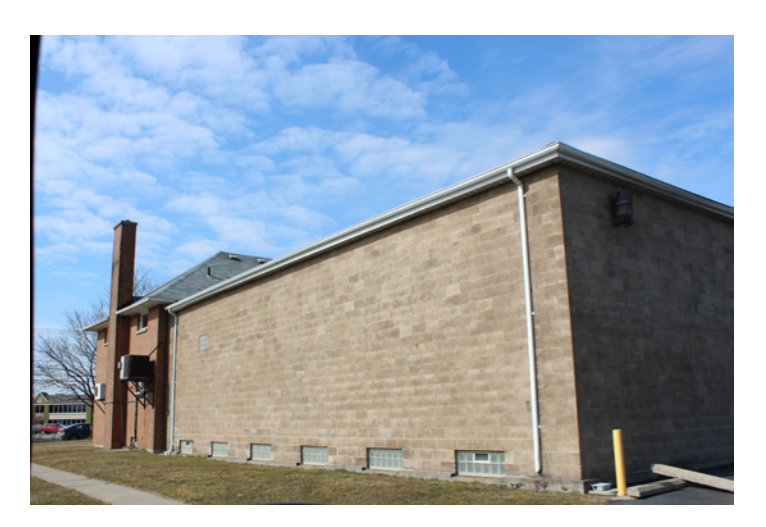
Blank walls don't encourage walking.