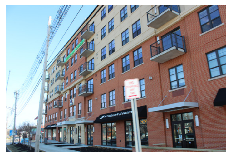
A number of people think the new Mosey building is too imposing.