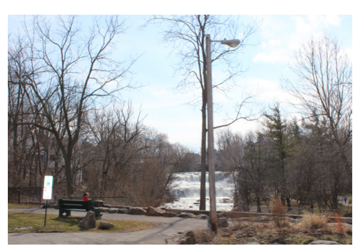
The Falls are a hidden gem in the Village.