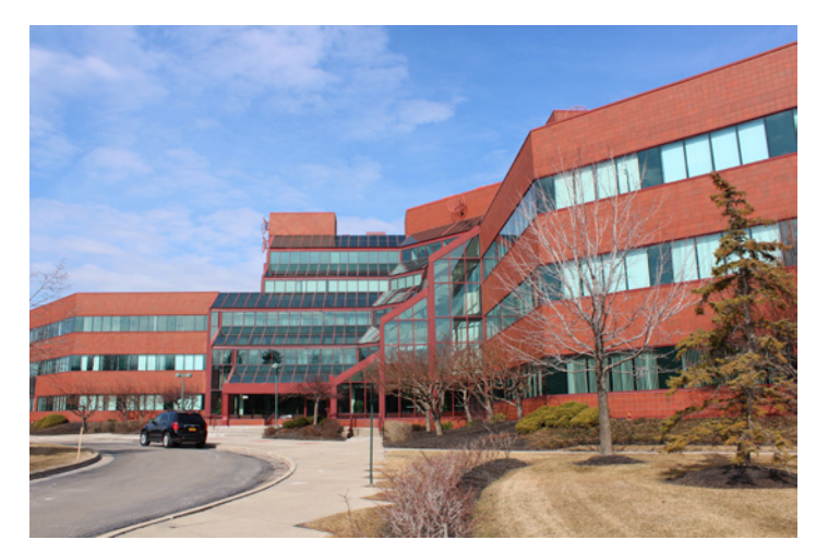
What is the future for these single-use office parks?