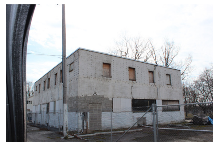
Old Niagara Falls Boulevard runs along Tonawanda Creek - this site has potential.