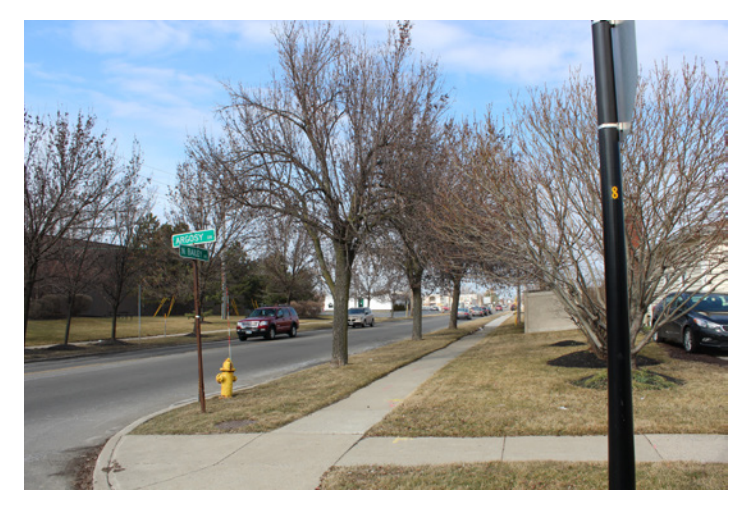
Trees in the tree lawn are awesome.