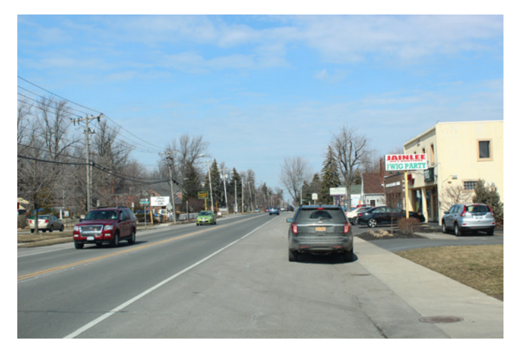
This road is too wide.