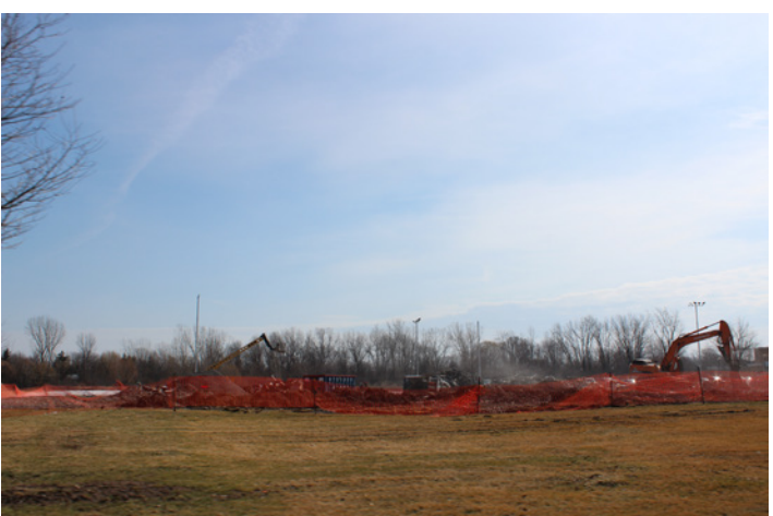
Things are happening in Amherst.