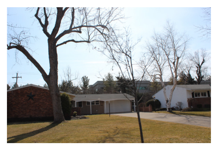
Another contentious adjacency.