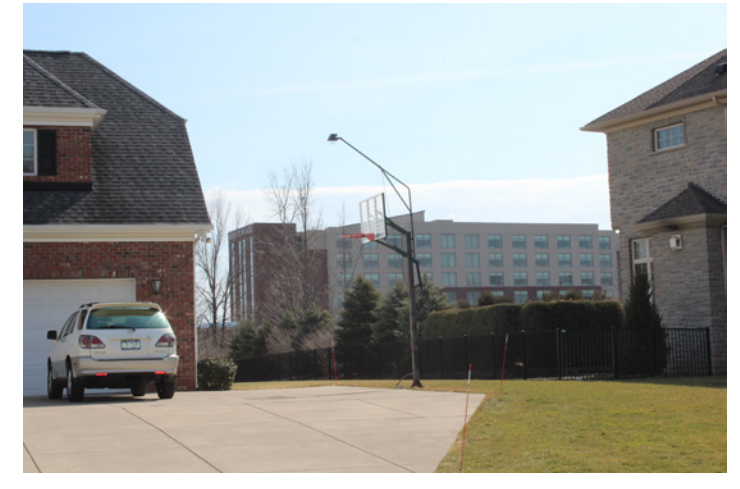
The view from behind the new Hyatt Place.