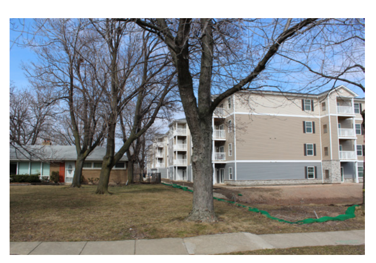
This person did not want to sell!