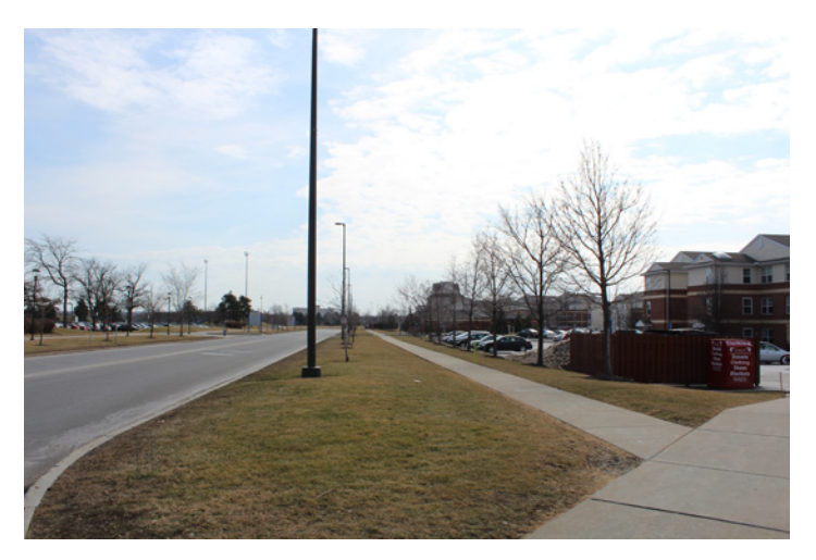
Now that's a buffered sidewalk.