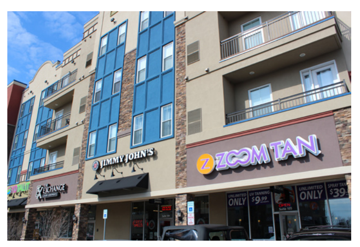
Student mixed use - not everybody's cup of tea.