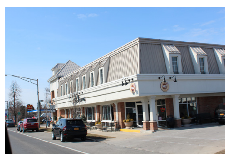
Spot Coffee in the Village. Snyder and Eggertsville need better retail options that people can walk to.