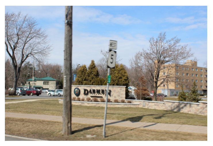
This was mentioned by a stakeholder as an example of a good new sign in Town.