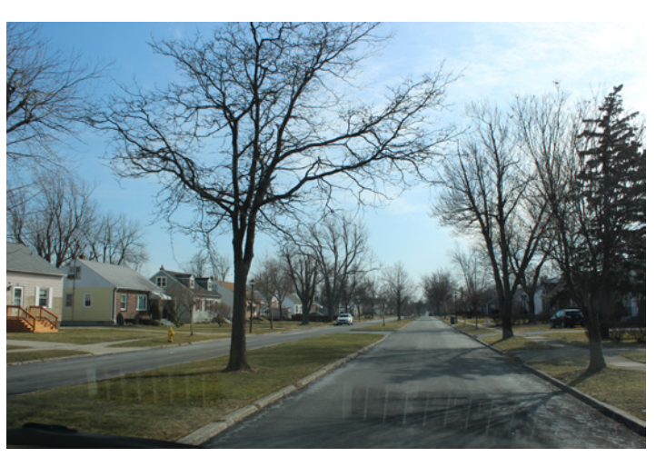
A median in the road makes all the difference.