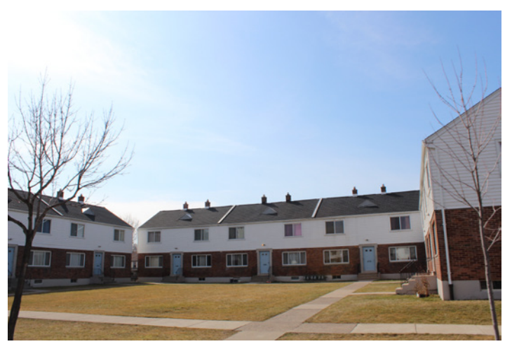
A great example of shared open space.