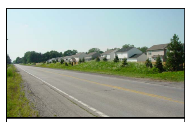
Reverse frontage development along North French Road near Dodge Road minimizes curb cuts.